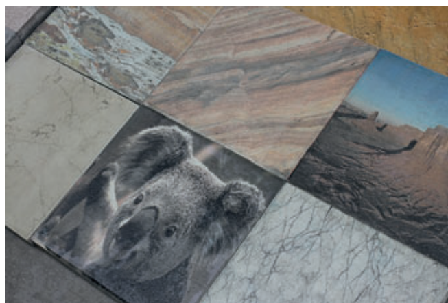
The visitors were offered a plethora of refinement options in addition to the colour koala bear imprint