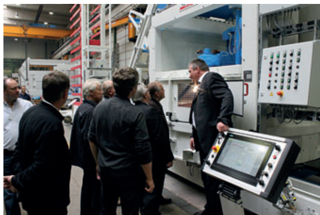
Presentation of a mixer from the SM series