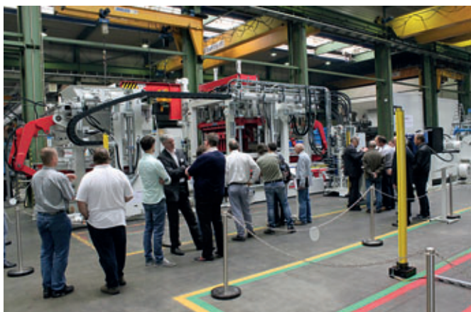
The exhibited RH 1500-3 MVA met with great interest

The second company, SR-Schindler from Regensburg, presented a complete refinement line together with the associated sample stones. Whether polished, blasted, coated, marbled, aged or curled: the visitors were offered a plethora of refinement options in addition to the colour koala bear imprint mentioned at the beginning. Some