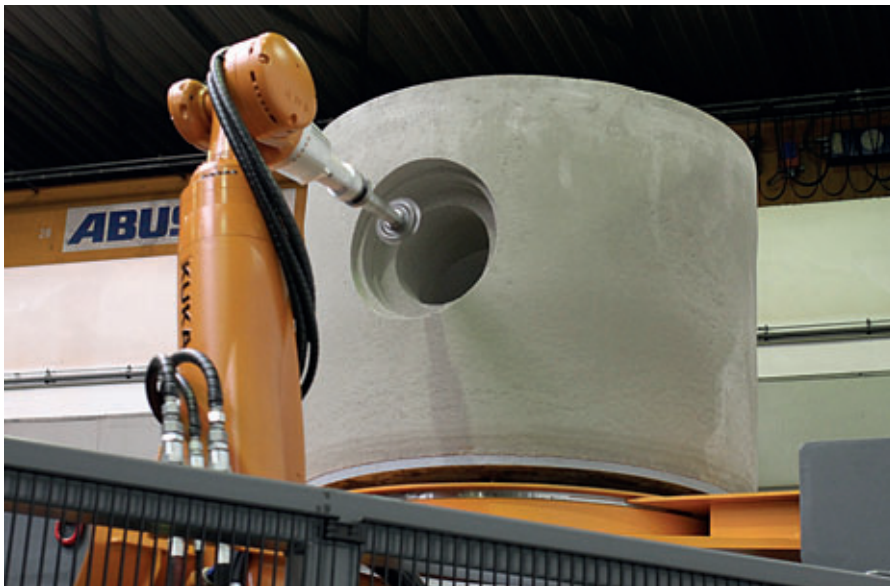
The Primuss concrete milling machine mills runs and channels in manhole bottoms with an accuracy of millimetres.

casting manufacturing samples provided with a wood appearance particularly stood out. Apart from the 'final touch', SR-Schindler naturally also offers suitable plants for manufacturing the refined slabs in the first place.