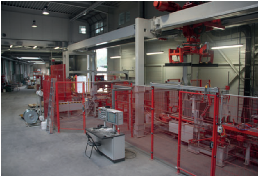
Packaging unit with 2-sided grab for tile packages