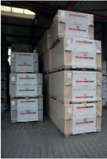
Upright packaged products