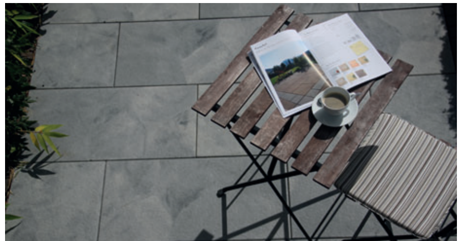
Coloured, blasted, curled and coated tiles