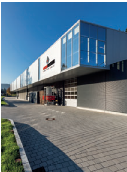
The new production hall at BraunBeton in Baiersbronn

The production cycle begins with the filling of the facemix by the first layer doser. The FMC marbling and colouring machine can be mounted at the first layer doser if required for the manufacture of two-colour, multi-colour or marbled tiles.