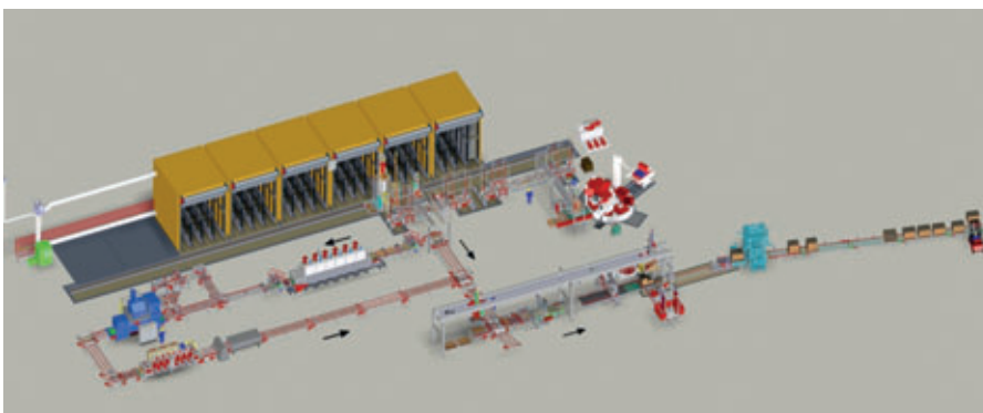
Extension stage 2

flat depositing device on the dry side and transfers them to the stack feeder of the flat depositing device on the press side.