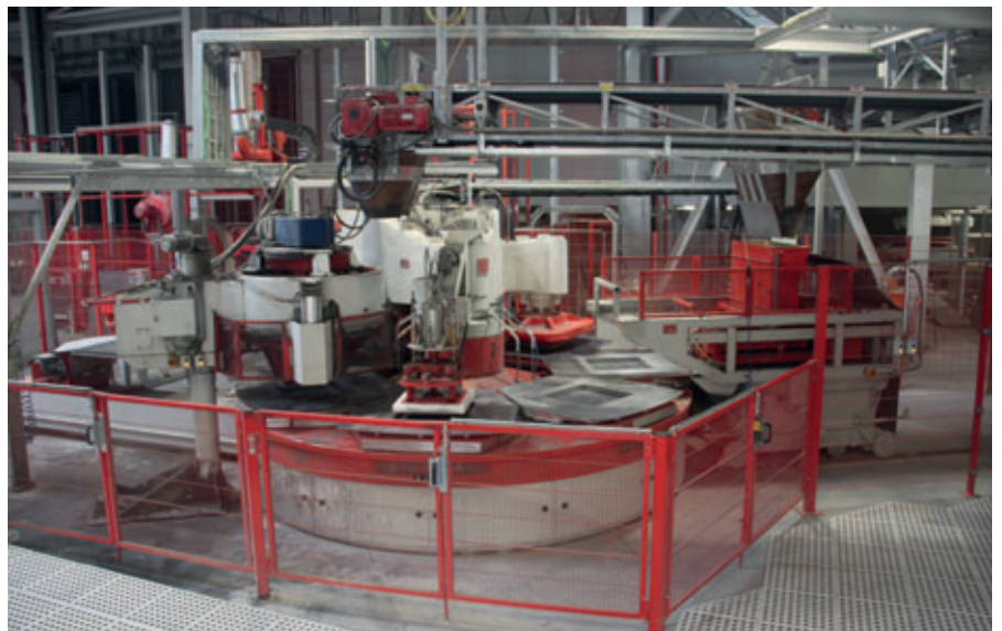
The hermetic press can manufacture formats up to max. 800 x 1,000 mm