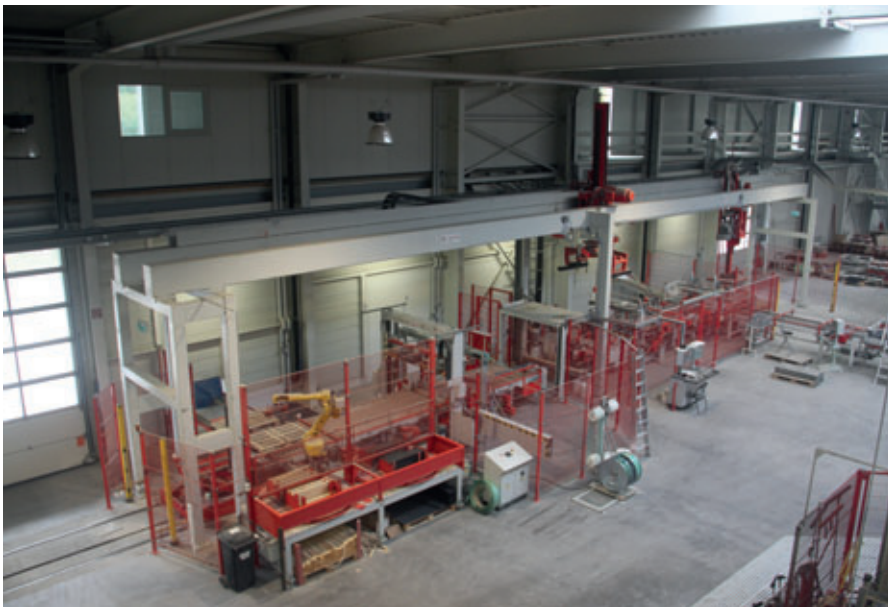
Flat/upright packaging unit with robot for the placement of wooden strips