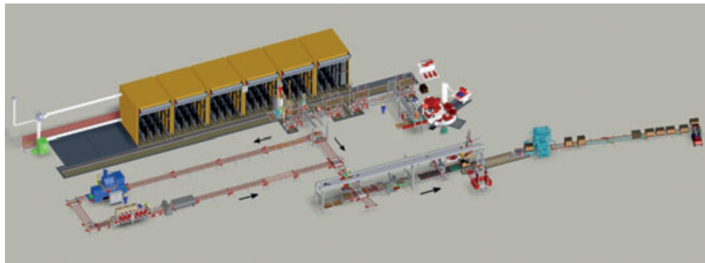
Extension stage 1

BraunBeton mainly uses the 1200-tons press to manufacture the formats 40/40, 60/40, 80/40 and 60/60 cm with a tile thickness of 40 - 42 mm. The tiles always consist of 2 layers, i.e. facemix and backmix concrete. Material is supplied by a mixing plant from Pemat with a PMPL 375 planetary mixer for the facemix and a PMPL 750 planetary mixer for the backmix. The press, as the core of the plant, consists