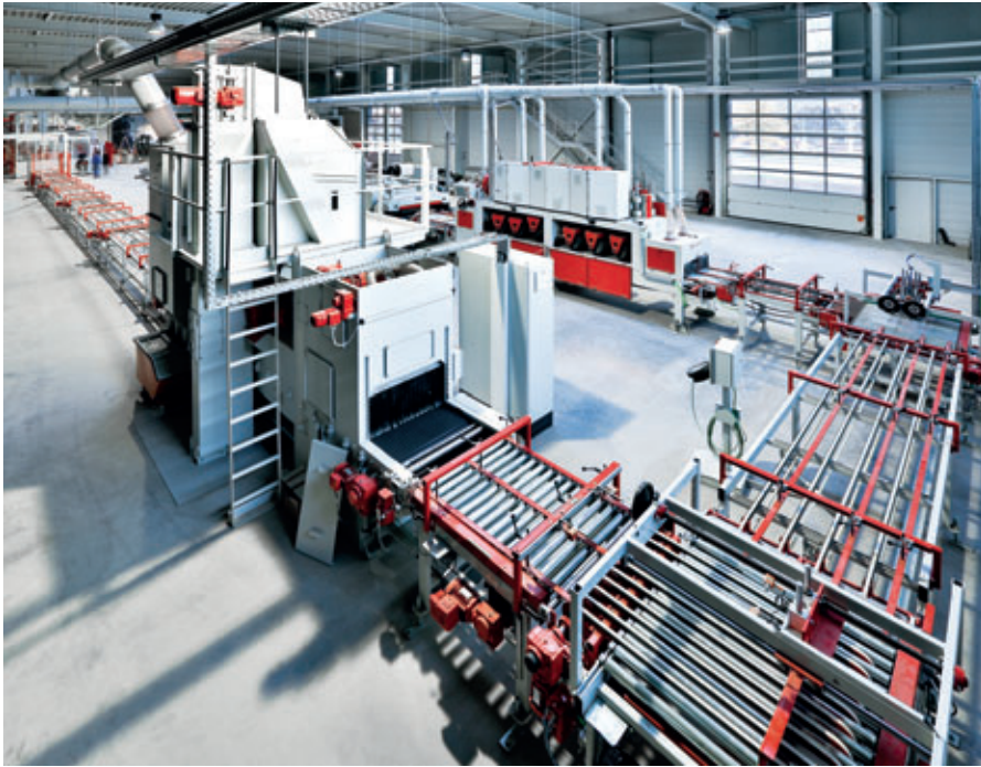
View of the finishing unit from SR-Schindler

The curling is followed by the coating line, which was provided by the customer.