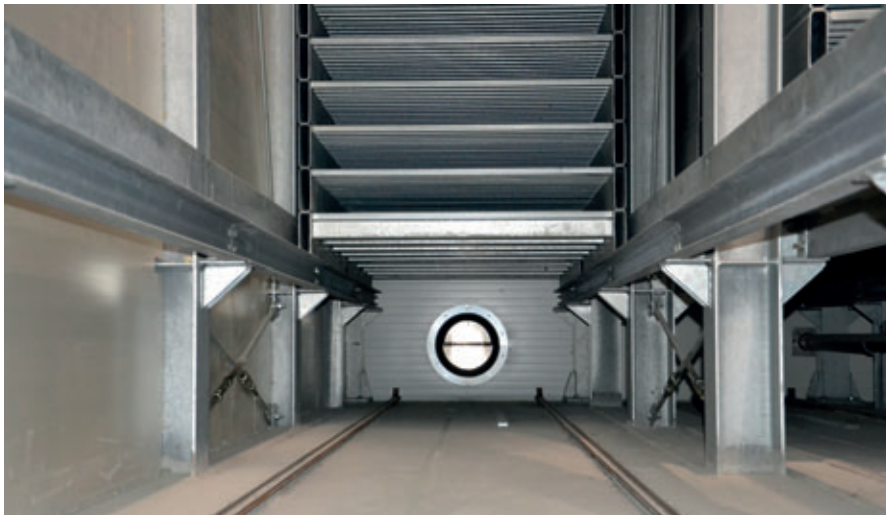
Inlet opening for the hot air under the slab rack.