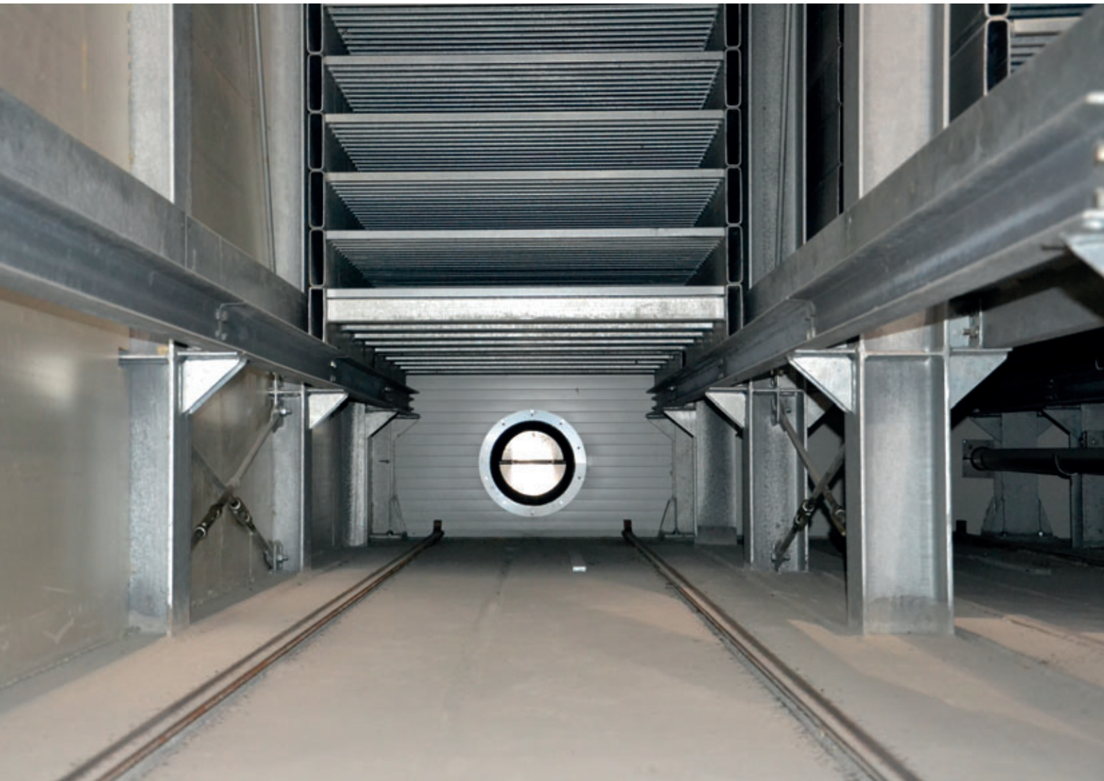
Inlet opening for the hot air under the slab rack.

only possible if the system is optimally calculated to match the production parameters and the customer's needs.