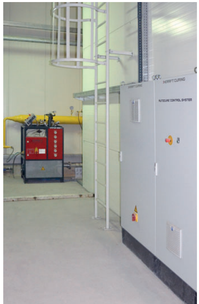
Kraft Vapor Mini™ vapour generator with Kraft Autocure™ controller in the new Bruk Bet footpath slab production plant in Tarnow.