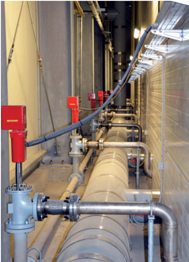
Piping gangway on the rear side of the slab rack with vapour pipe, a valve for each curing chamber and the air distribution pipe.

ation with Kraft: "The products that we manufacture on the hermetic press in our modern Schindler plant are mostly large, thin slabs that are subjected to various surface treatments. In order to enable this it is necessary to obtain sufficient hardness of the concrete as quickly as possible. We found that we could only achieve this in an isolated curing environment with closed chambers and the use of modern technology for heating and air circulation - with the vapour technology supplied by Kraft. Our co-operation with Kraft goes back a long way. Their Quadrix and Vapor systems have been used successfully in our plants for many years now. That's why we relied on the experience and proven solutions from Kraft for the implementation of our latest investment in Tarnow - in other words we relied once again on the Vapor system developed by Kraft."