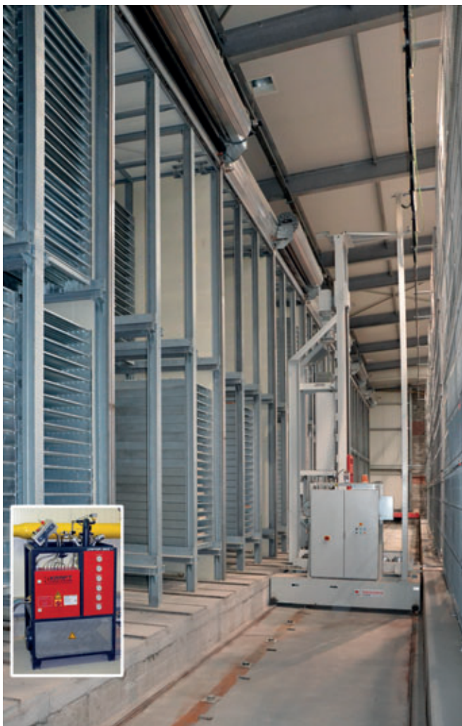
Direct size comparison of the vapour generator and the curing rack (40x8x5m). The operation of such a large plant with the smallest vapour generator from the Kraft product range (footprint only 95 x 77 cm) is possible only through precise adaptation to the customer's production parameters. The result is very high product quality with very low energy costs.

Zbigniew Lechowicz, director at Bruk Bet with responsibility for investments in new technologies for production, tells of his experiences with Kraft plants and co-oper-