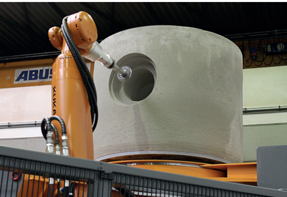
The Primuss concrete milling machine mills runs and channels in manhole bottoms with an accuracy of millimetres.

casting manufacturing samples provided with a wood appearance particularly stood out. Apart from the 'final touch', SR-Schindler naturally also offers suitable plants for manufacturing the refined slabs in the first place.