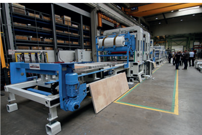
SR-Schindler from Regensburg presented a complete refinement line with the associated sample stones.