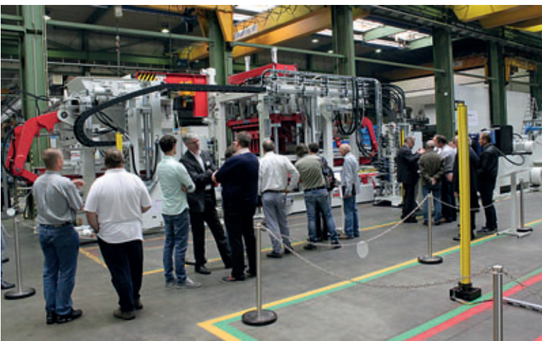
The exhibited RH 1500-3 MVA met with great interest

The second company, SR-Schindler from Regensburg, presented a complete refinement line together with the associated sample stones. Whether polished, blasted, coated, marbled, aged or curled: the visitors were offered a plethora of refinement options in addition to the colour koala bear imprint mentioned at the beginning. Some