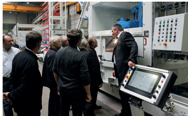
Presentation of a mixer from the SM series