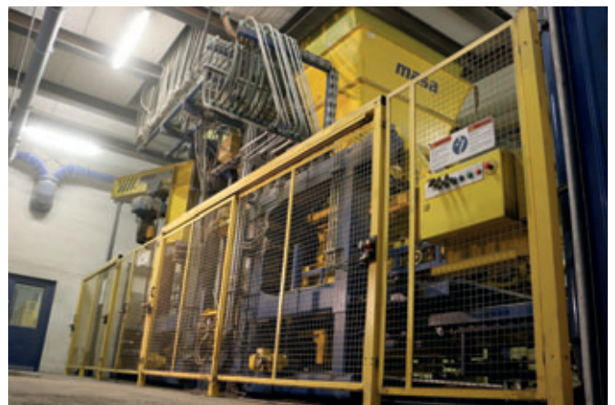
The new Masa XL 9.1 concrete block making machine at the Kann company's Leipzig plant