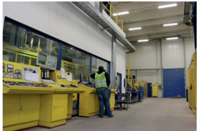
The XL 9.1 concrete block making machine can be observed through the window facade of the sound insulating enclosure