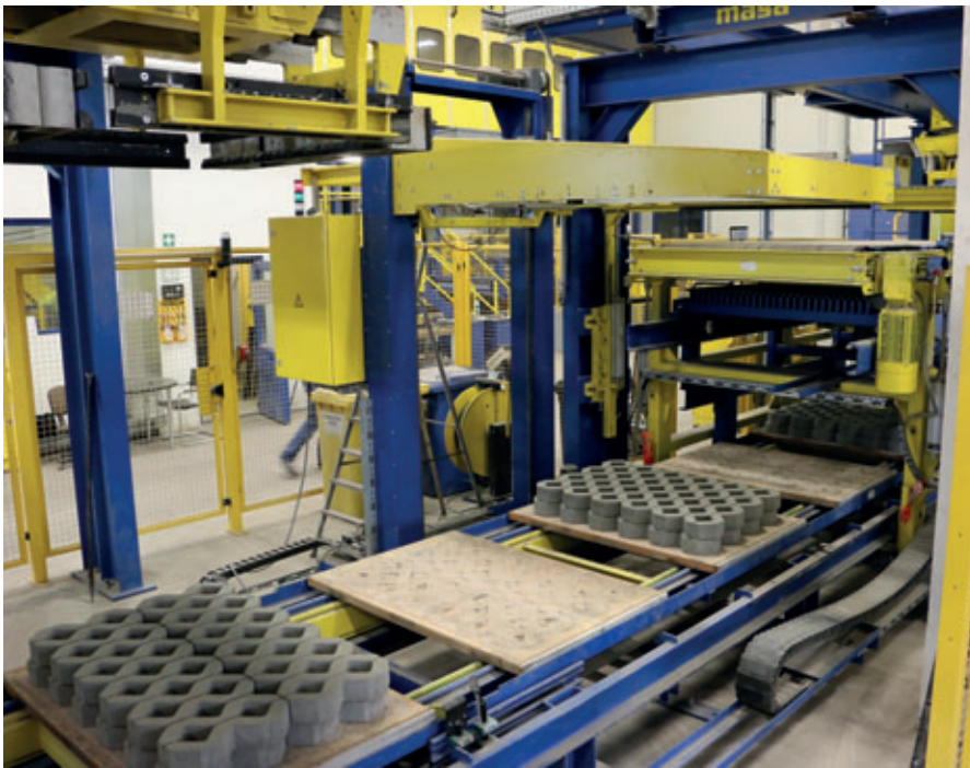
Horizontal strapping of individual layers – strapping takes place both on the return transport and during remodelling