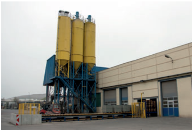
The traditional Kann company's modernised concrete block making machine at the works in Leipzig

"The old concrete block making machine had to be replaced by a modern block making machine. Due to the age of the machine it had become more and more difficult lately to meet our own quality standard", Plaschnik continues.