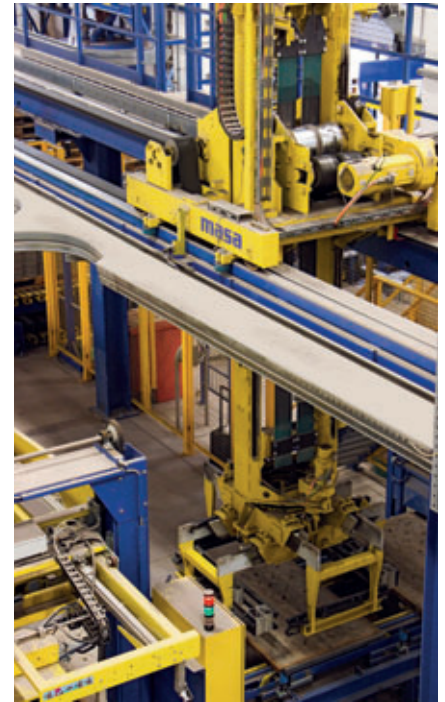
The Masa Cuboter has no hydraulic components; it uses exclusively servo drives