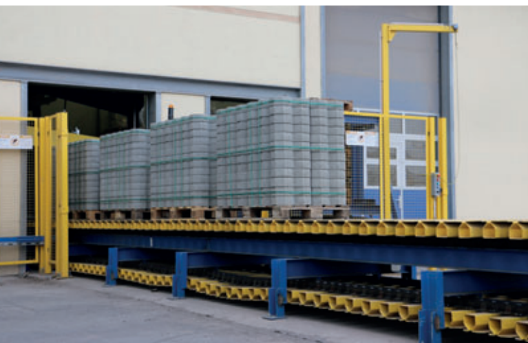
Packed and ready for delivery

For the placement of the order, clear criteria were stipulated from the very outset that had to be complied with and fulfilled