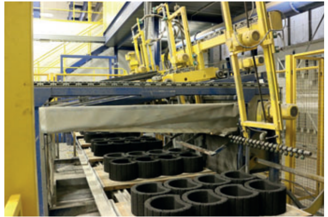
Masa washing plant

Therefore, also on account of the quality, an order was placed with Masa for what is now the third machine within the last two years.