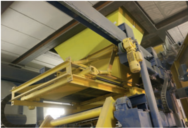
The Masa XL 9.1 concrete block making machine