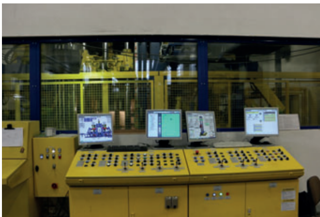
The Kann employees are always in control with the Masa FAST plant control software