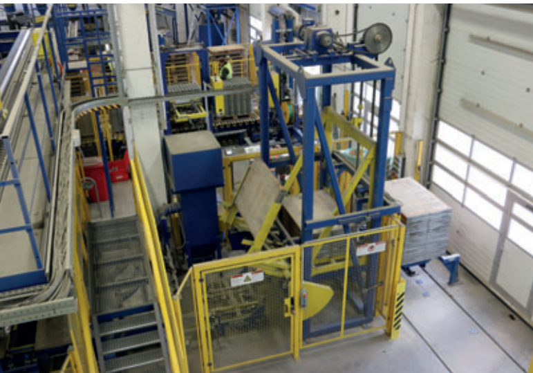
Stacked and buffered until the next use

100%. Apart from the short construction period of the plant, a guaranteed completion date was specified.