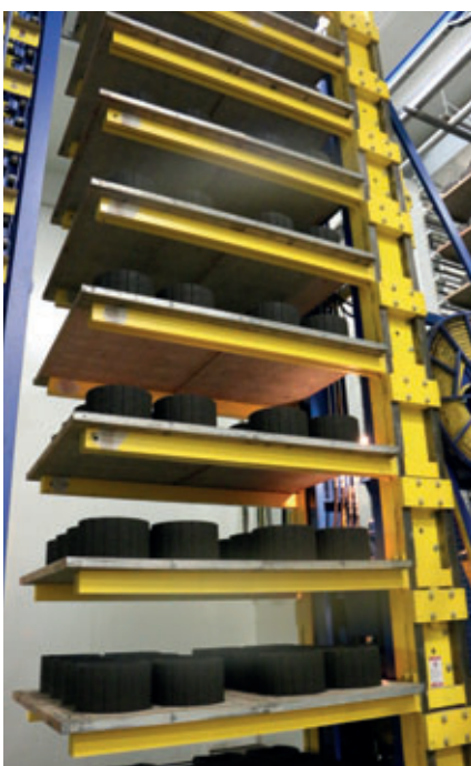
The distance between the forks is adapted to the product height

A further big advantage of the XL9.1 is the fast, automated mould changing procedure. The changing procedure is started via the plant controller. Following the completion of the last production cycle, the mould – including the tamper – automatically drives forwards for changing. If the concrete recipe is unchanged, the XL9.1 can already produce the next blocks in a new mould and with a block height of up to 500 mm after 7 to 8 minutes.