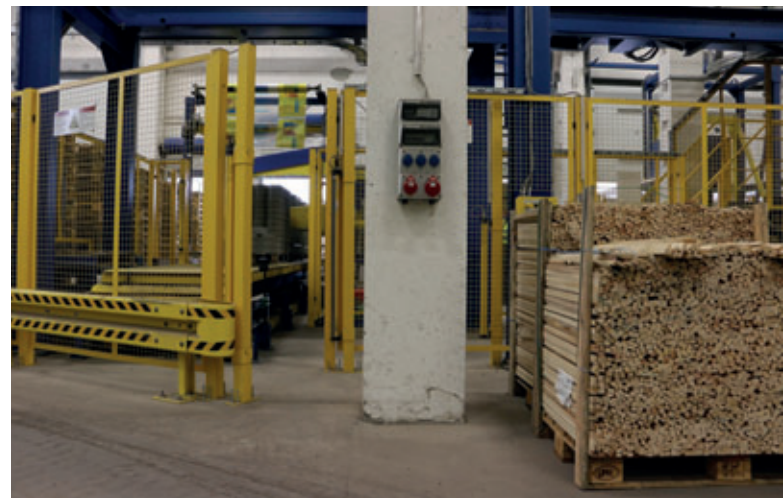
Safe working without loss of time – thanks to the light barriers the strips can be positioned reliably without disturbing the overall plant sequence