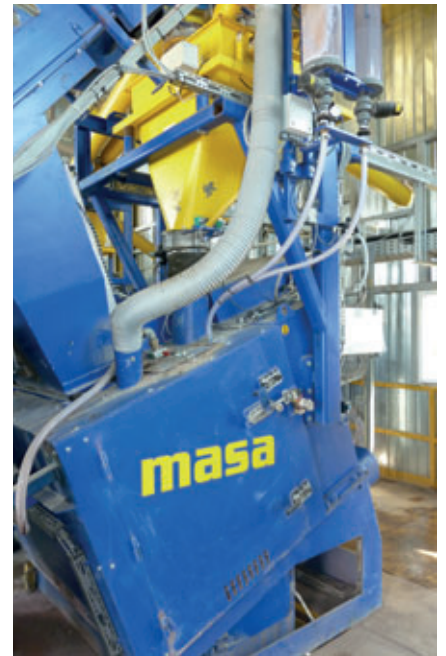
The new Masa S350/500 mixer at Magik Ltd. in the Ukraine

The putting into operation of the new Masa Mixer S350/500 and PH 1500/2250 needed a completion date by April 2014. Therefore, a tight time schedule was agreed to between the two companies and Masa began the manufacture of the mixers in Germany. Within a very short period the mixer was punctually delivered in Lviv. "It is looking good. We are on schedule," was the message to a delighted Lichnov in February 2014. The assembly work of the Masa employees went smoothly and all work was completed on schedule. The new dosing- and mixing plant was as planned ready for use and another milestone was reached.