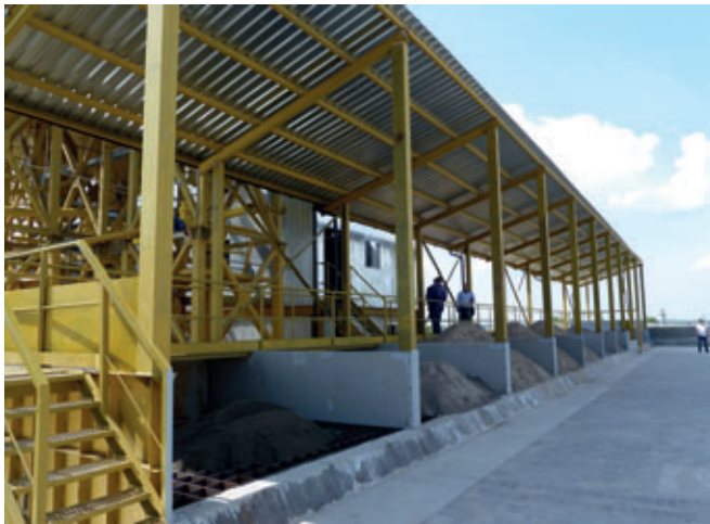
Magik Ltd. Storage bin