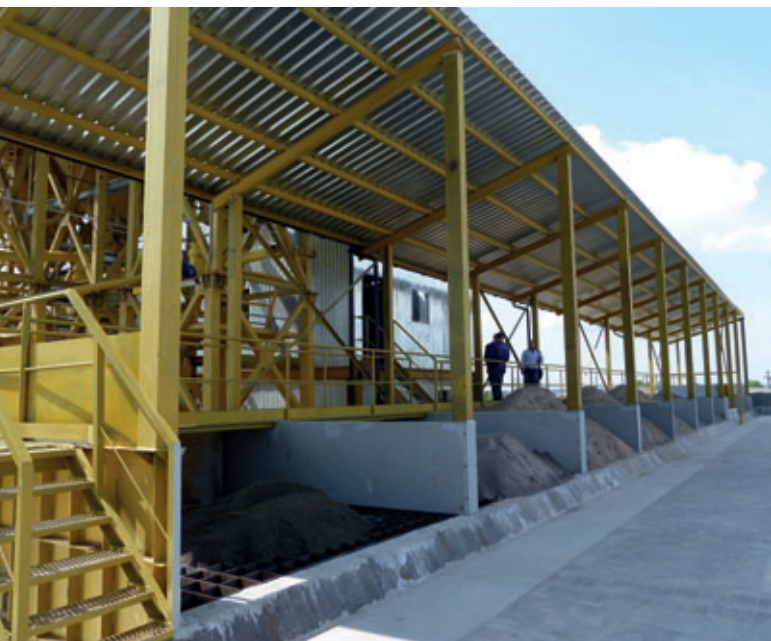
Magik Ltd. Storage bin