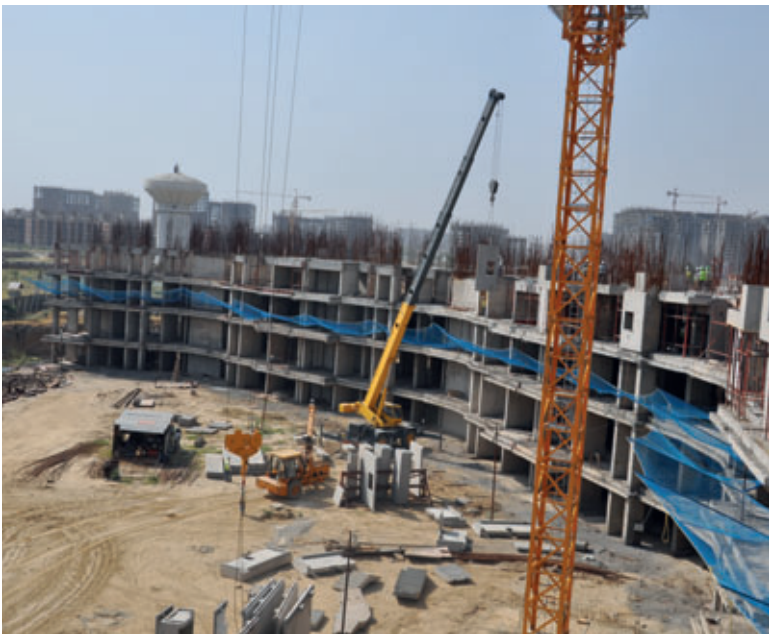
Construction site with precast walls and hollow-core slab

respectively with 60 and 68 towers of up to 33 storeys. The company has completed projects on residential and commercial complexes, townships, family entertainment centers, and offices spread over more than 500 acres in the Delhi National Capital Region.