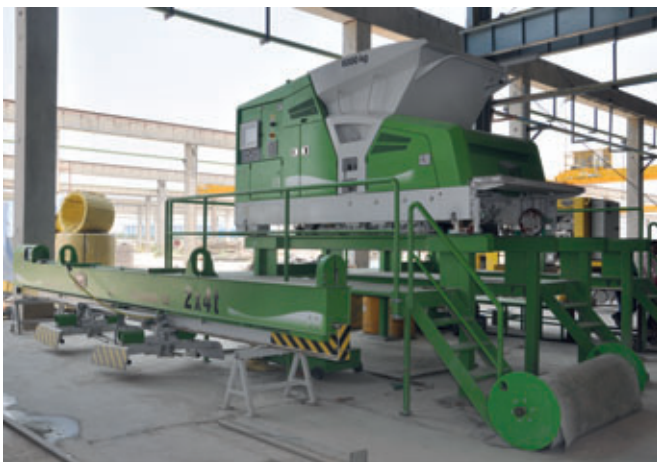
Extruder E9 and lifting beam

Amrapali has two major group housing projects to be delivered within the next four years of 15 and 20 million square feet