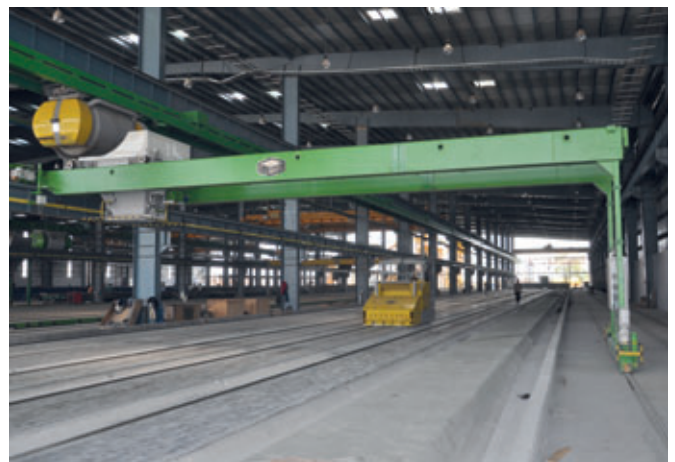
Hollow-core casting line with automated concrete distribution