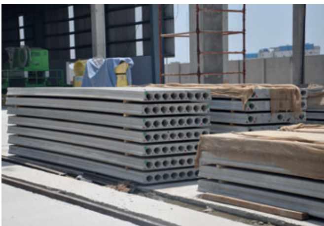
Hollow-core slabs and precast walls in stockyard