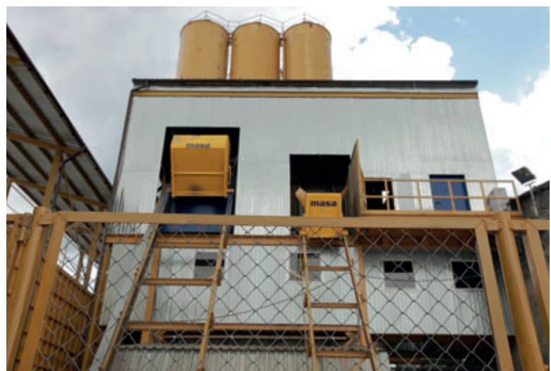
The new Masa dosing plant supplies the two mixers: S350/500 and PH 1500/2250.