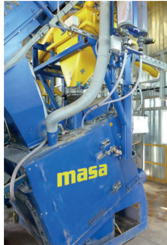
The new Masa S350/500 mixer at Magik Ltd. in the Ukraine