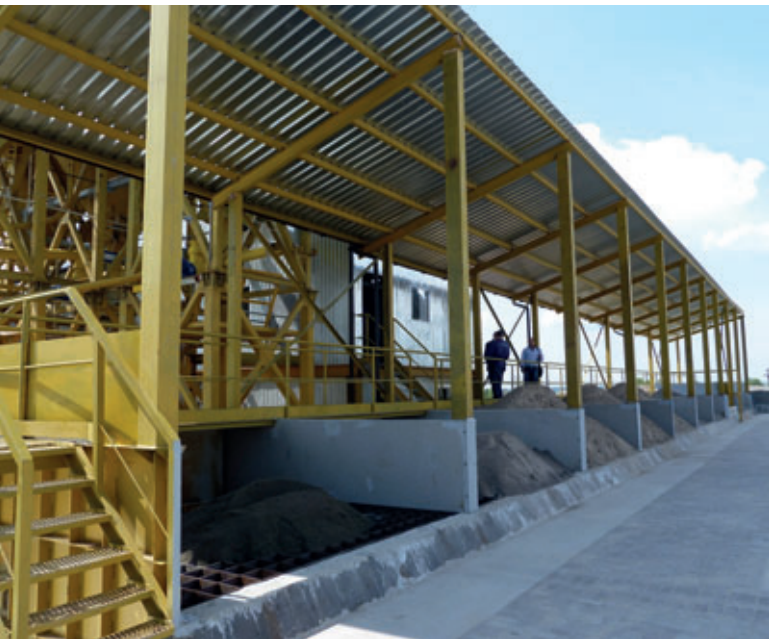
Magik Ltd. Storage bin