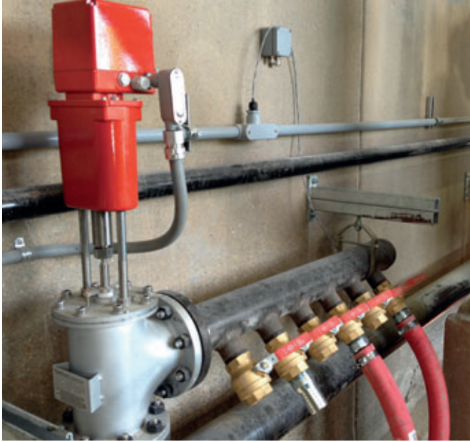
Vapor control valve with hose connections to inject vapor underneath the molds.