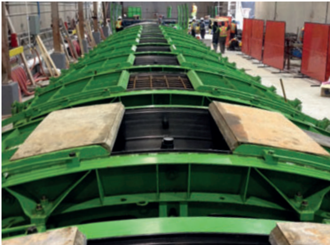
Evergreen Mold Segments cleaned and ready to pour concrete, molds are poured twice a day producing 48 segments a day which equals 6 tunnel rings.