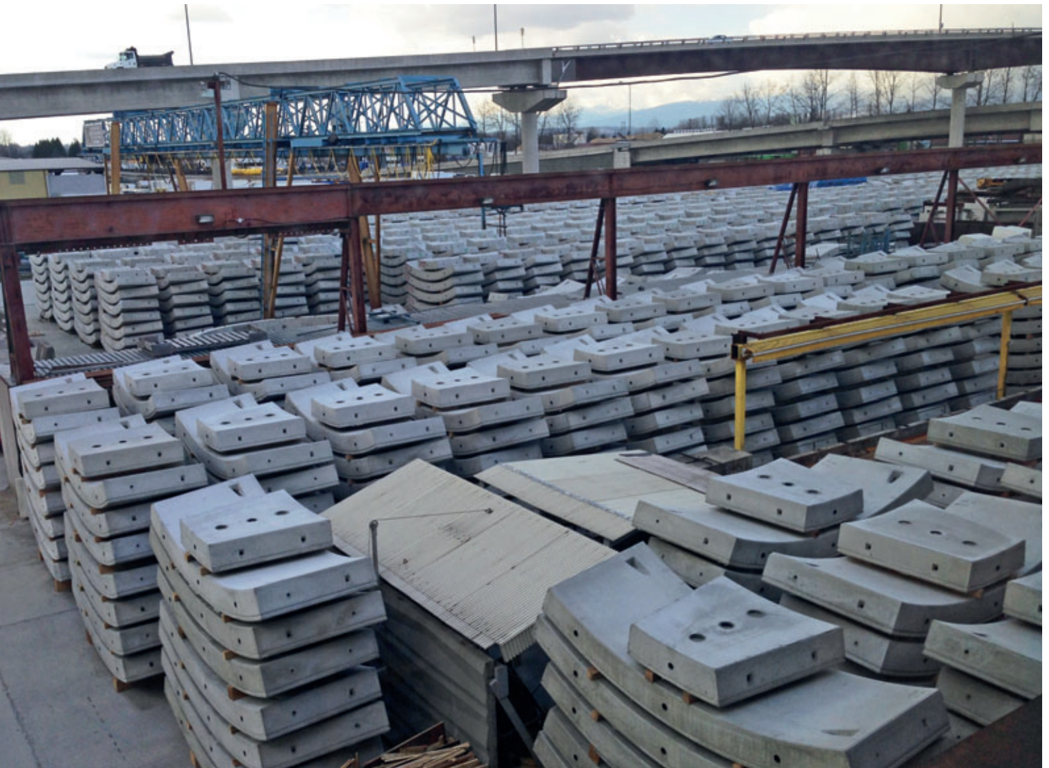
APS' Langley yard shows some of the 3504 segments/438 rings poured to date.

ments needed. 105 rings are rebar reinforced (they will be installed at both ends of the tunnel) while the rest of the segments are reinforced with steel fiber.