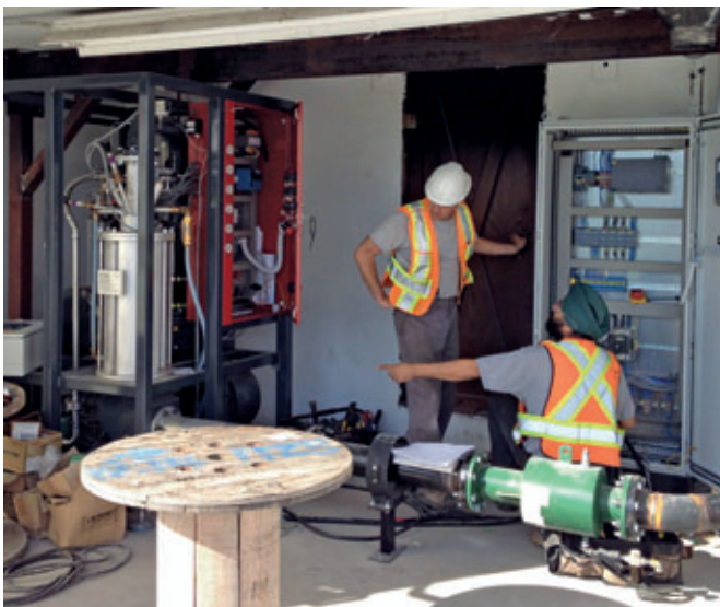
KC 20-1S Vapor Generator – Compact but powerful vapor system during installation