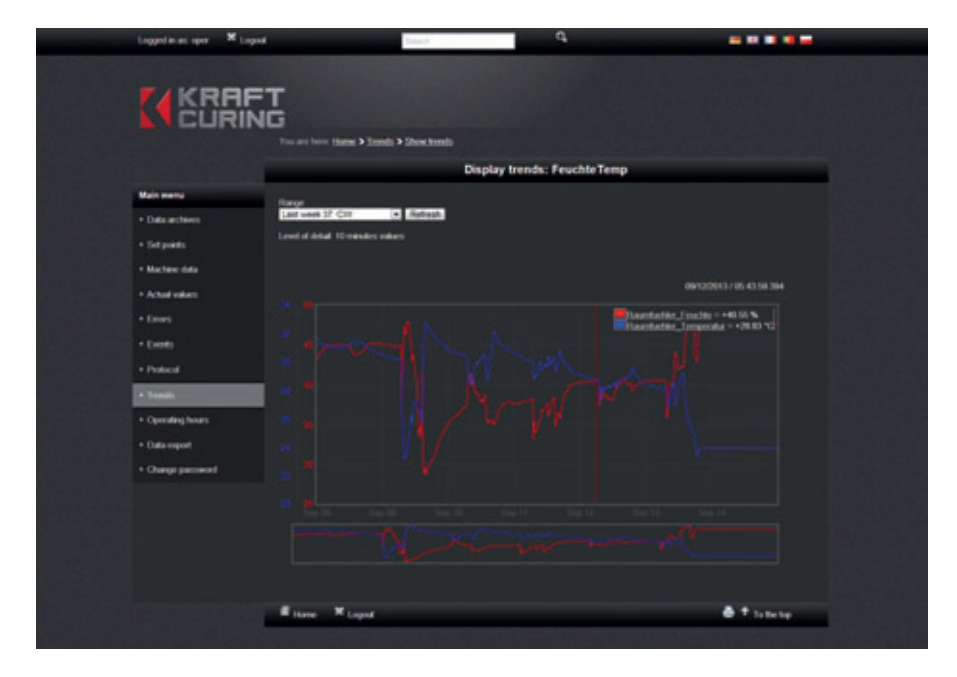
VaporWare™ Recording Software