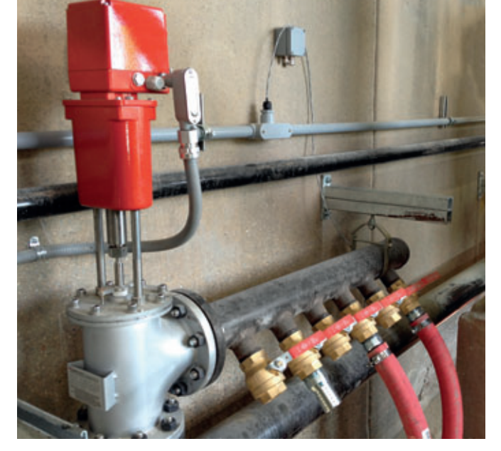
Vapor control valve with hose connections to inject vapor underneath the molds.