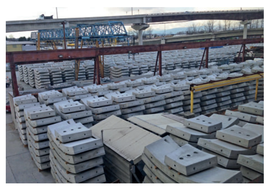
APS' Langley yard shows some of the 3504 segments/438 rings poured to date.

The custom solution created by Kraft allows the large tunnel segments to be vapor cured in stationary molds. The molds are covered by an insulated tarp that is tightly sealed. The forms are cured with vapor via an automatic valve and hoses. The temperature of the concrete is closely monitored with internal temperature measurement. The vapor provides the heat and moisture required for proper curing. All curing data (e.g. time, temperature, humidity, batch number and mold station) is sent to the VaporWare system that records this data for quality control and for the inspectors. This way, the segments are cured to the specifications of the project and in the most energy efficient way possible. After initial