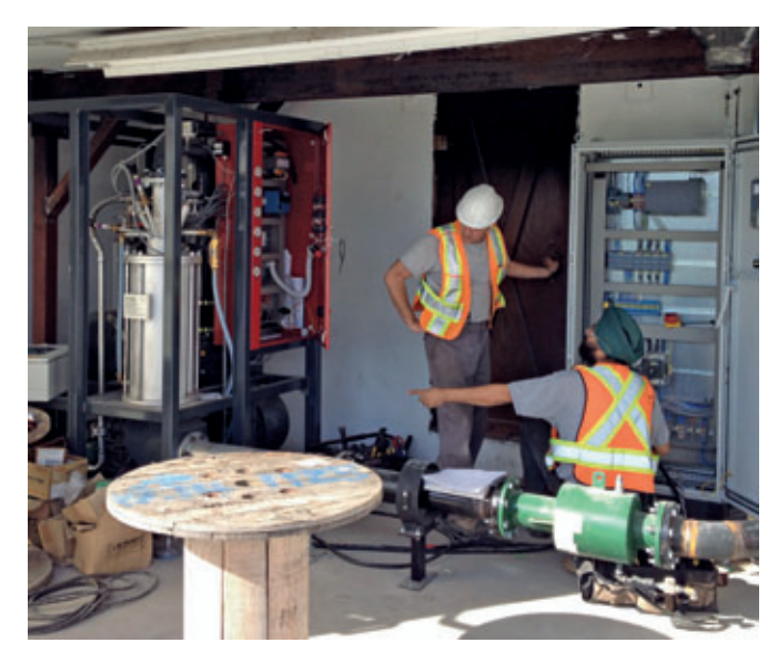
KC 20-1S Vapor Generator -Compact but powerful vapor system during installation

Evergreen Mold Segments cleaned and ready to pour concrete, molds are poured twice a day producing 48 segments a day which equals 6 tunnel rings.