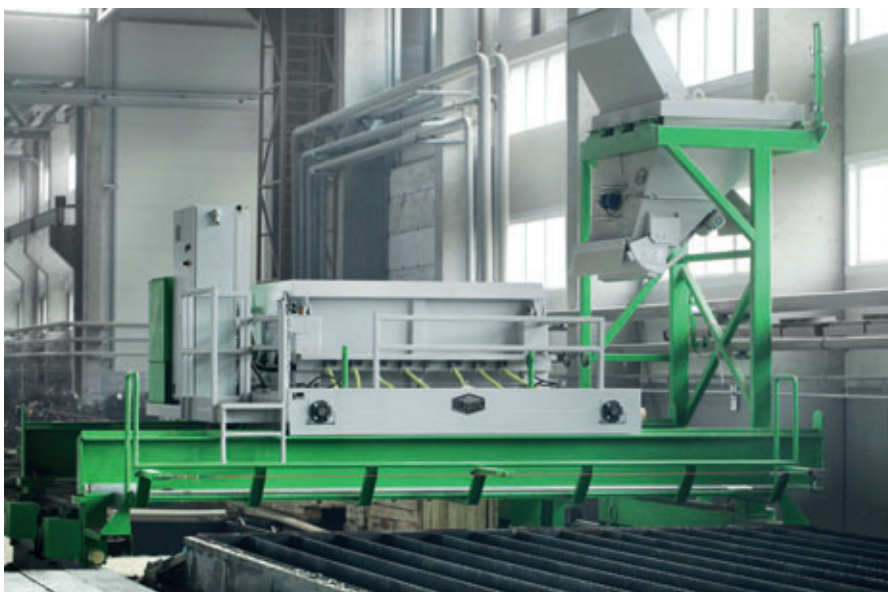
Many of Lider Prom's precast products are made with machinery and equipment produced by Elematic. The latest addition to the facility is a brand new precast pile production line. Elematic's pile casting machine is used for casting of molds. Casting machine moves along the molds and concrete is dosed into molds. Vibrators are then used for compacting cast concrete.

"We have good prospects for selected client relationships outside the group. Integral to this are our broad product range and ability to take on full-scale deliveries," says Mr Anufriev.