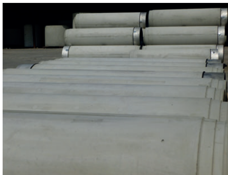
Since 2014 the Perfect Pipe jacking pipe has been manufactured in Stölpchen