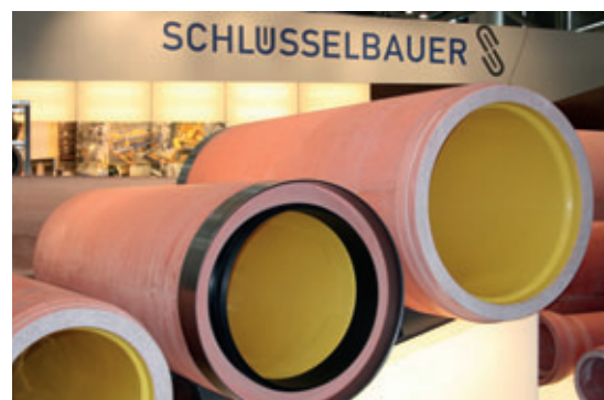
The Perfect Pipe jacking pipes on display at bauma 2013 – from presentation to industrial production in spring 2014

SCHLÜSSELBAUER TECHNOLOGY GmbH & Co KG Hörbach 4 4673 Gaspolshofen, Austria T +43 7735 71440 F +43 7735 714456 sbm@sbm.at www.sbm.at www.perfectsystem.eu