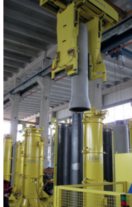
After curing in the formwork, the jacking pipes are demoulded the following working day