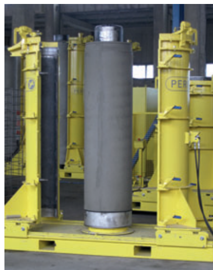
For future projects, the Perfect Pipe jacking pipes are produced to a nominal width of DN300 in 2 m lengths

product range possible for a medium-sized company, ranging from ready-mixed concrete, road construction and landscaping elements, and retaining wall construction and civil engineering systems, to a highly diverse collection of components with the quality of exposed concrete. Other than Saxony and neighbouring states, the company often delivers to customers in the Czech Republic and Poland. Grafe Beton sees its entry into concrete pipe manufacturing with Perfect Pipe as an essential step in expanding the precast concrete sector. This should enable the company that was established in 1903 to secure this positive trend for decades to come. ■