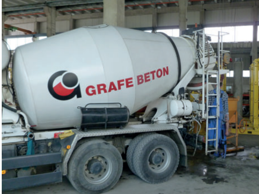
The concrete is mixed using trucks to produce jacking pipes and poured into the moulds using a pail

with pipeline construction back to our own sites. And, as has already been observed, Perfect Pipe also re-creates the potential for precast concrete manufacturers from various sectors to enter the pipe manufacturing sector.