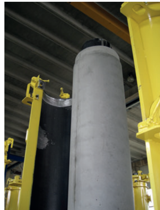
Concrete pipes made using liquid concrete are wet-cast and therefore manufactured to exceptionally low tolerances