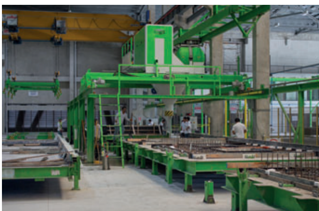
Comcaster casting machine at DDT

with twenty-four tables of 3.5 x 13 meters for structural wall production. The delivery consisted of a Batching and Mixing Plant, a concrete delivery system, a circulating line with a Comcaster casting machine, a plotting station, and an automated concrete transport system, and a precast wall panel transport system for storage. All highly automated.