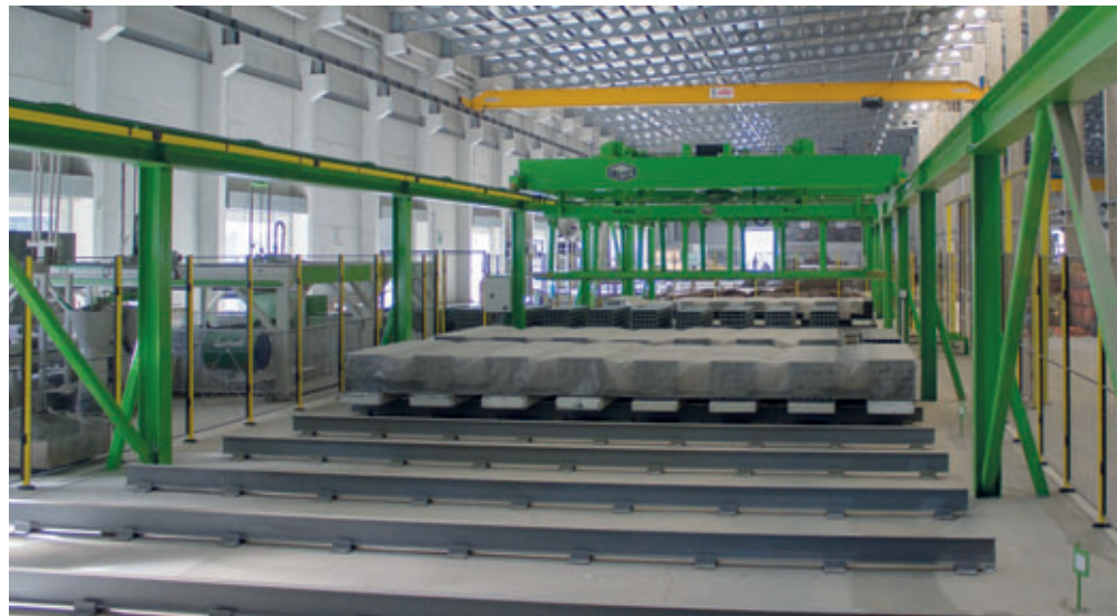
Acotec-Line at DDT with automatic precuring storage