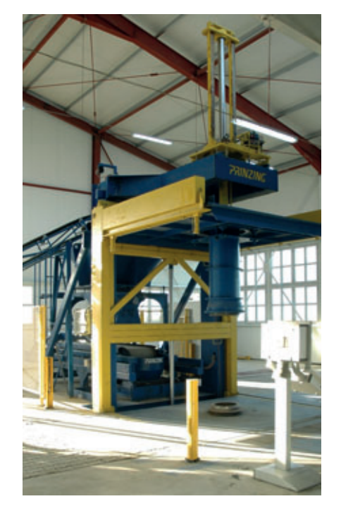
The new Prinzing Tornado 200/150 at Victor Construct in Romania

After extensive testing and inspection of various plants, the Prinzing Tornado 200/150 was selected. With a maximum nominal diameter of 2,000 mm and an overall height of up to 1,500 mm, the Tornado