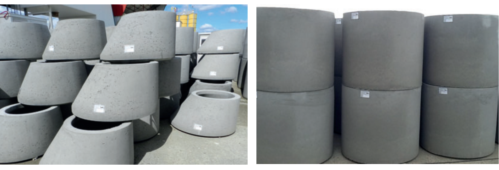
Victor Construct mainly uses the Tornado for the production of manhole rings and cones, alternatively with or without climbing elements