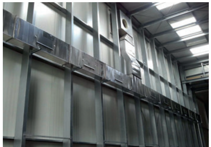
The stainless steel construction with an insulated housing guarantees a long service life, operational reliability and a constant high performance.