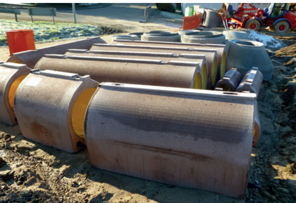
Perfect Pipe pipes with HDPE liner before installation in 3 m effective length, as an adaptor pipe with an individual construction length and as a 1 m link element

Due to the flexibility of the connectors which corresponds to a double joint, there is no excessive stress in angulation either and thus no longterm resulting fatigue of the gaskets used. Shearing loads are absorbed by the concrete bell and spigot in this type of pipe. The geometry of the prebed pipe also simplifies handling and installation in this execution.