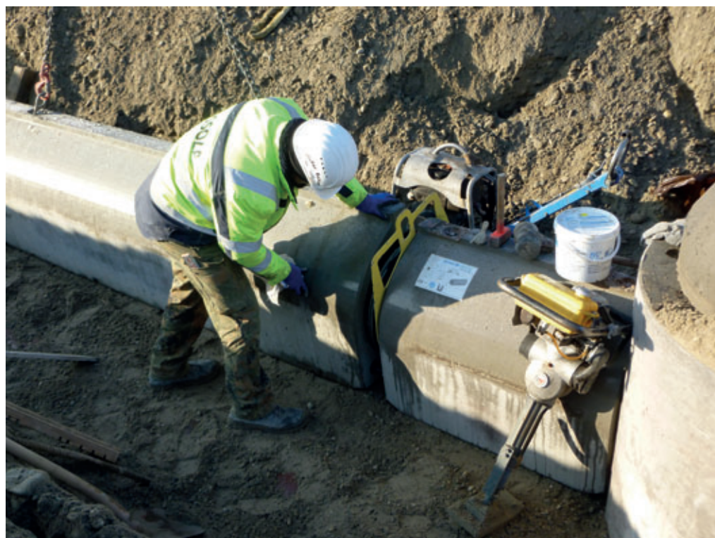
A link element is connected to the monobase with the same connectors as the pipe-pipe connection

Thanks to the connectors used at Perfect Pipe, an operational pipe with a tight and corrosion-resistant pipe connection is installed after lifting a pipe into the start trench and the sub-sequent jacking cycle. This is a revolution in installation and piping practice, especially in the non-accessible nominal width sector. The sophisticated process of the welding of plastic linings is