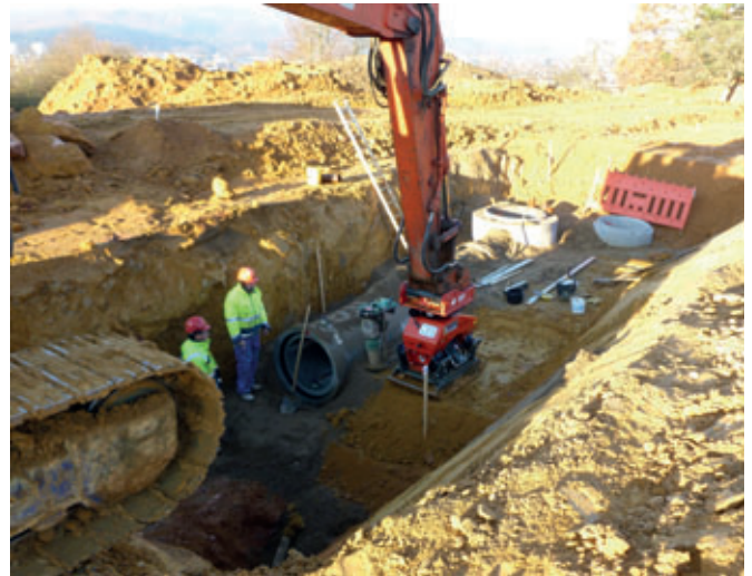
Rapid installation progress by simple and practical compression of the pipe zone