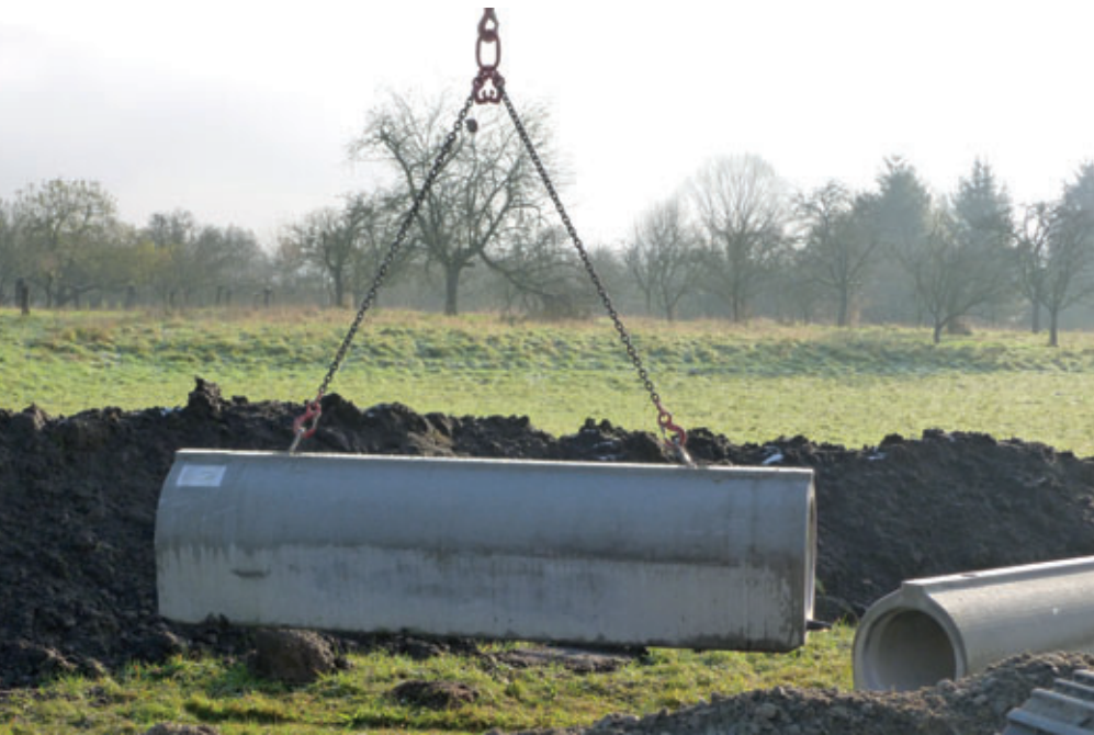
Simple and safe handling of the Perfect Pipes on the construction site with cast in lifting anchors