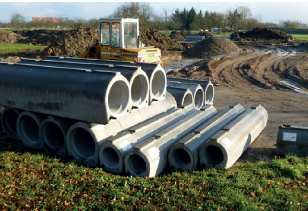
Concrete pipes can be produced with the same manufacturing technology with prebed geometry as lined pipes

thus relegated predominantly to small, non-accessible nominal widths from installation practice. However, these can of course be used in the case of subsequent repairs or renovations.