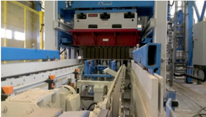
Hess RH 1000-2 high-performance machine with electric mould change carriage

The Weber company has a long tradition in Norway and has shaped the market for Leca lightweight concrete blocks for many years. The Weber Group has belonged to Saint Gobain since 2007 and operates in 47 countries. Weber employs over 300 employees at 6 locations in Norway. On account of increasing market requirements, the Weber company, located in Borge to the south of Oslo, decided to renew the concrete block making machine and parts of the circulation.