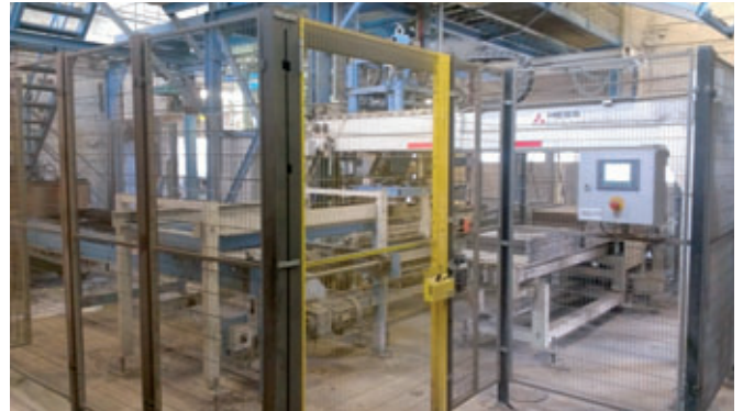
Integration of a board buffer in the existing plant

The main criteria for the selection for the new machine were high production performance, optimum quality with regard to the height, strength and appearance of the stones, fast mould exchange, low mould costs, ease of maintenance and good after-sales service. In addition there was the challenge of integrating the machine into the existing localities and placing it on the existing machine foundation without a pit in such a way that maintenance is easy.