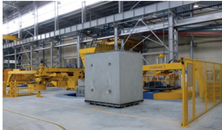
By using steel set-rings, the Exact XL plant permits precisely manufactured joints on all products – pipes and frame components.

Amiantit Oman Concrete's product range includes manhole components with nominal widths of DN1200, DN1500 and DN1800; pipe with nominal widths ranging from DN700 to DN1800, and rectangular profiles with dimensions of 2000 x 1500 to 2500 x 2500 mm. The Schlüsselbauer Exact XL production system is equipped with two