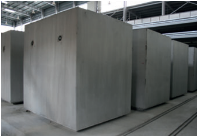
Large-format frame components with 2000 x 1500; 2000 x 2000; 2000 x 2500 and 2500 x 2500 mm dimensions are produced on an industrial scale at Amiantit Oman Concrete Products LLC.

Most recently, concrete precast components used for surface drainage, infrastructure construction and waste water draw-off are being produced in the Sultanate of Oman at an Exact XL production plant with especially flexible equipment supplied by the Austrian equipper Schlüsselbauer Technology. During the feasibility and profitability analysis, the manufacturer, Amiantit Oman Concrete Products LLC, was faced with meeting the requirements of a greatly changing demand for different products or component dimensions in this growth market, in addition to offering product range variability. Therefore, the new manufacturing technology to be developed had to provide perfect-quality and durable concrete components in a reliable, highly automated manufacturing process.