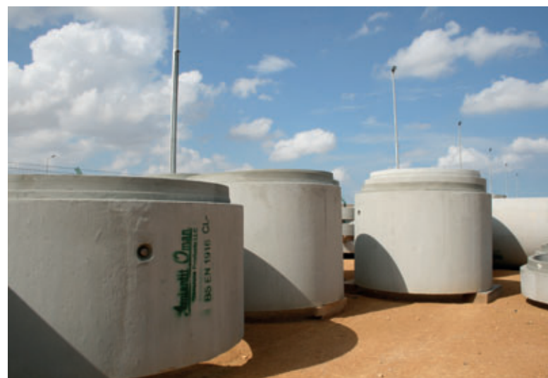
Even large format manhole components are manufactured on the Exact XL production line.