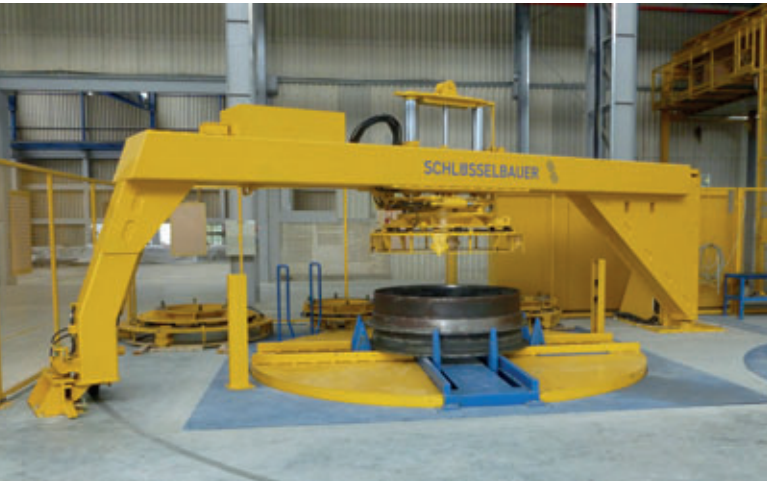
Spigot set-rings are automatically inserted into the machine before the compacting process and remain on the product throughout the curing cycle.