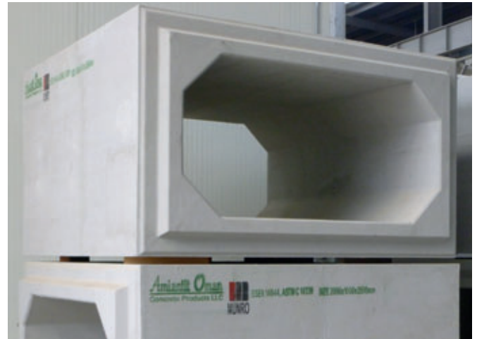
Frame components are increasingly used in infrastructure construction and are especially used in road construction to prevent flooding by high flow rates during heavy rain events.

when the station was being equipped for the next cycle, concrete filling and compacting was taking place on the second station. With high-frequency core vibrators, the earth-moist concrete is compacted uniformly over the entire installation height of the precast component. A robust, force-guided press allows the production of rectangular components in the same process without sacrificing quality.