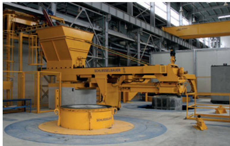
The flexible Exact XL production plant is ready for the next pipe production cycle.