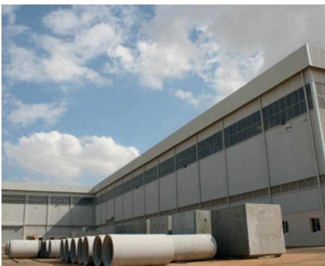
Amiantit Oman, which specialises in the construction sector, was established in 1974 and employs more than 900 staff. About 80 of these employees are at Amiantit Oman Concrete Products LLC.

This type of Exact XL system enables the production of concrete pipe with and without liners and at the lowest conversion costs. Furthermore, the use of set rings ensures very high quality spigots of all product types and exact joints to comply with very low tolerances. The dimensional stability is a crucial criterion for both high-quality pipe as well as high-quality manhole constructions. For the manufacturing of manhole components, climbing aids can be directly installed by the Exact XL system, or it can produce products furnished with appropriate pre-punched holes. The maximum product overall length for this type of system is 3600 mm. Concrete precast components with an overall length of up to 2500 mm and maximum nominal width of 3600 mm are manufactured in the area of Muscat. Only two employees are required to operate the two production stations, including the lowering of the products and equipping of the moulds.