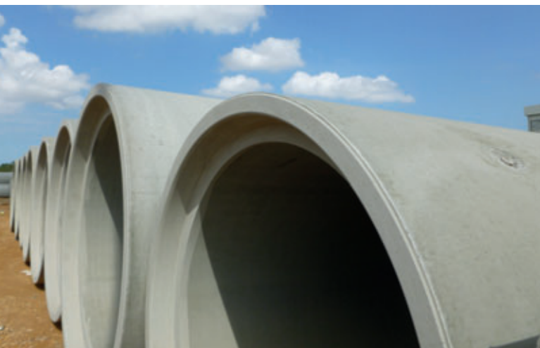
Visible product quality thanks to the use of the of set-rings; for use on concrete pipe up to DN1800.

casting stations that can be converted quickly, by means of hydraulic core bracings, to produce different product types or dimensions. During the first weeks of manufacturing, one station was used for circular components and the second station was used for rectangular components. While product was demoulded on one station and then