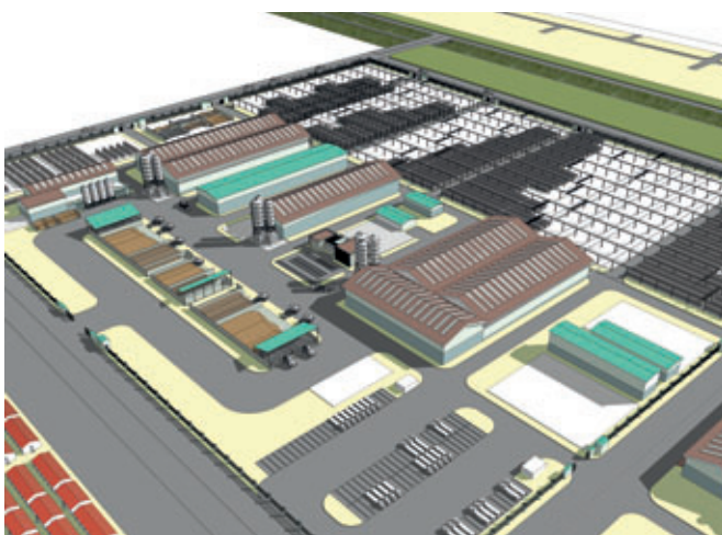
Hanwha Bismayah Factory; Bird-eye-view