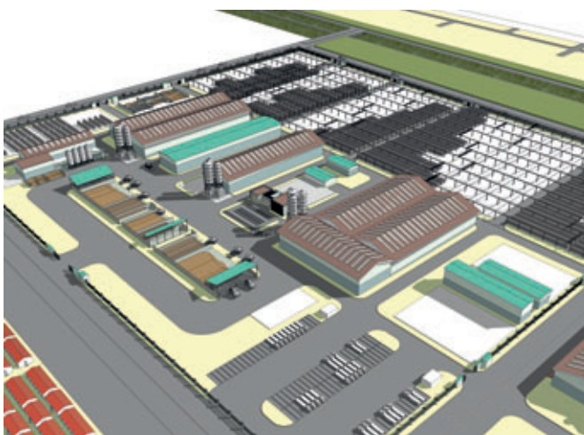
Hanwha Bismayah Factory; Bird-eye-view