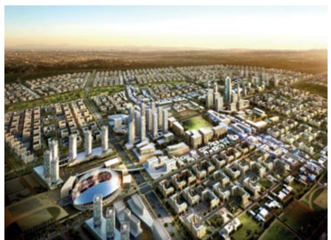
Bismayah City; Bird-eye-view