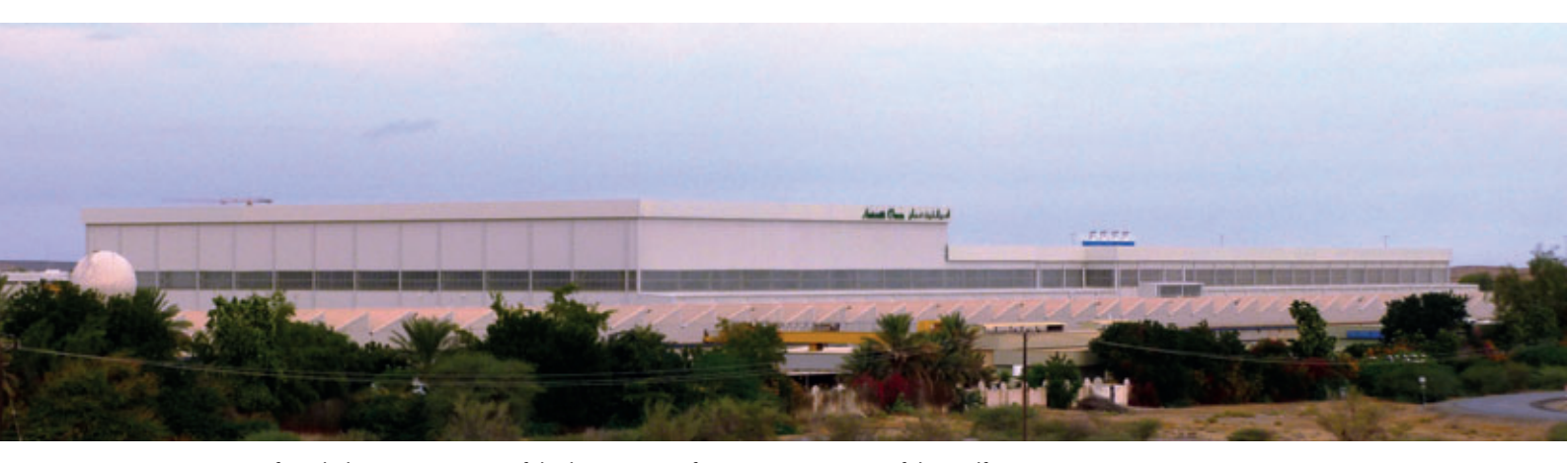
Amiantit Oman, founded in 1974, is one of the largest manufacturing companies of the Gulf state.