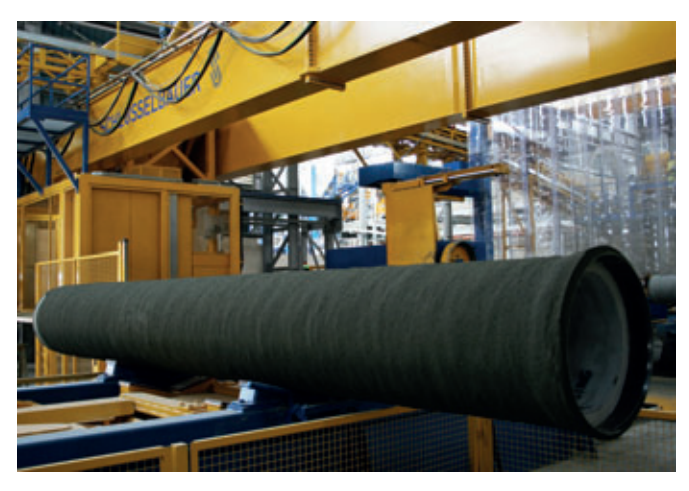
Concrete pressure pipes can be manufactured with different joinings. In the specific project, joints and spigot ends are moulded with steel end rings.

It is primarily the manufacturing technology of the concrete pressure pipe principle which has changed fundamentally since the previously described project. Individual working steps were modernised, the entire