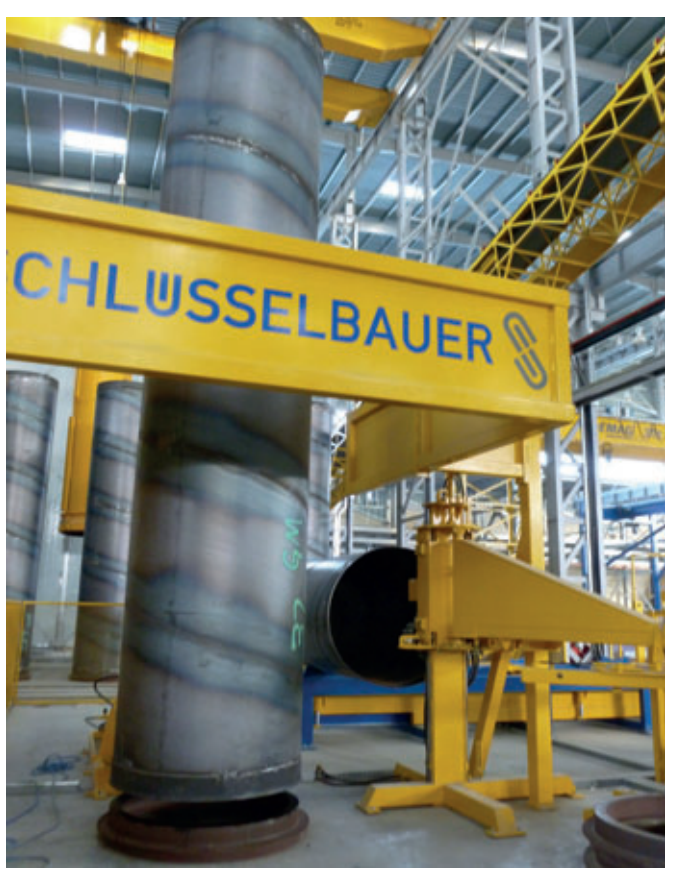
The sheet steel cylinder is automatically placed on a joint and concreted after the equipping of the mould for the manufacture of the internal lining of earth-moist concrete.

gravity sewers in a first stage in the nominal widths DN 300 to DN 1800 and box - culverts of 2000 x 1500 mm to 2500 x 2500 mm. The box - culverts and the large DN 1200 to DN 1800 mm pipes are manufactured on a Schluesselbauer Exact XL vertical dry casting machine, the smaller pipe dimensions are manufactured on a packerhead machine. This subdivision into two manufacturing processes is justified by the fact that this machine type was needed for the inner lining of steel cylinders for the production of concrete pressure pipes - the subsequently described second stage in the