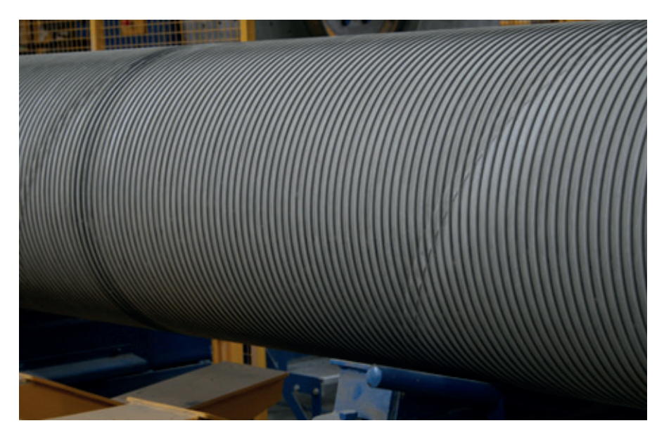
In accordance with the necessary operating pressure of the concrete pressure pipes, wire thickness, pre-stressing and the pitch of the wrapping are determined.