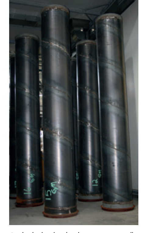
Steel cylinders lined with concrete generally harden in kilns in one day. Completion then follows with application of the pre-tensioned wire and the external coating.