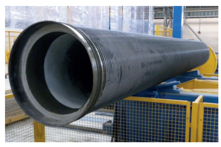
A range of fully automated manipulators move the semi-finished concrete pressure pipes through the production plant. The picture illustrates an insight into the concrete lining of the concrete pressure pipe.

production process intensely automated and individual pipe components can now be manufactured and processed more quickly and precisely. The integration of the pre-stressing in particular frequently constituted a bottleneck process in series manufacture in the past. With a processing speed of 6 m/s the pre-stressed wire is now integrated so rapidly with state-of-the-art technology that upstream and downstream processes are no longer delayed as a result. However, the basic concept of pressure pipe manufacture has remained almost the same and encompasses three fundamental areas: steel cylinder manufacture, wire pre-stressing and coating in concrete. Added to this in modern concrete pressure pipe manufacture is the manipulation or handling of individual components, semi-finished components and finally the end prod-