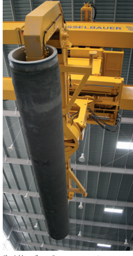
The Schluesselbauer Transexact automatic crane transports the finished products into the hardening chambers and then to the delivery conveyor belt. It also operates the chamber covers.

Amiantit Oman was founded in 1974 and now numbers among the largest manufacturing companies of the country with a broad range of products. Amiantit Oman employs approximately 90 staff, roughly 80 of whom work at Amiantit Oman Concrete Products LLC. The company harks back to a joint venture of the largest industrial groups in the Sultanate of Oman, the Omzest group, the Suhail Bahwan Group and the Saud Bahwan Group. Over 75 companies are integrated into the Omzest Group currently in full or part possession, approximately two thirds of the turnover is generated in manufacturing companies. The Suhail Bahwan Group comprises more than 40 companies and in the Saud Bahwan Group among others products of numerous reputable vehicle manufacturers such as Ford, Toyota or MAN are marketed. In addition to the Amiantit Oman product range, which is primarily focused on the construction sector, the most diverse of services can be found in the group of companies as a whole. Consequently, almost the entire population of the country is integrated into the value-added process.