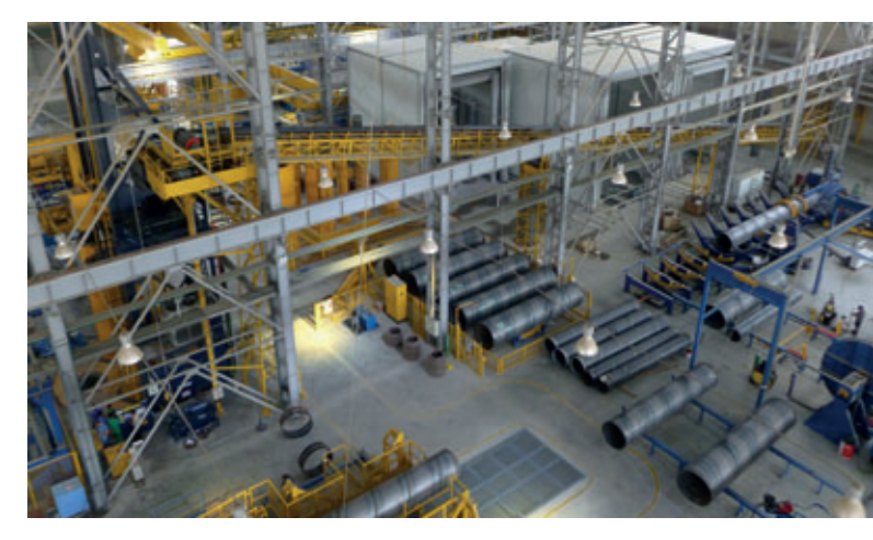
The high degree of automation of the entire plant makes a considerable contribution to the protection of workers and products. Thus, cycle times can be optimised and the reject rate minimised.