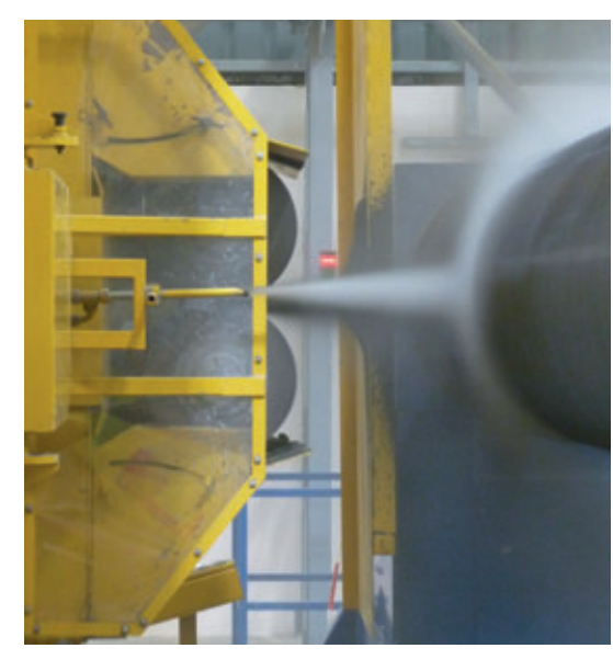
In the final manufacturing step, an external protective layer is applied to the pipe with spun concrete.

ufacturer of concrete pressure pipes. After clarification of pipe construction requirements in the Sultanate of Oman and comparison with available manufacturing methods, a two-layer concreted pipe with a sheet steel core and ring pre-stressing reinforcement to be provided with an outer protective layer created from shot - crete was selected. The pressure pipes will be manufactured in the nominal diameters DN 600, 800, 1000, 1200 and 1400mm in accordance with the AWWA C301 and C303 standards.