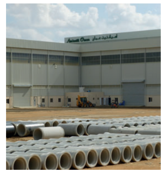
In addition to concrete pressure pipes, reinforced concrete pipes of nominal widths DN300 to DN1800 and concrete jacking pipes are manufactured.

The segment of concrete pre-cast component manufacture is new for the manufacturer. To date, they have longstanding experience with the materials PVC, PE and GRP and the now prohibited asbestos fibre cement pipes. In the newly established company Amiantit Oman Concrete Products LLC concrete pipes are now produced for