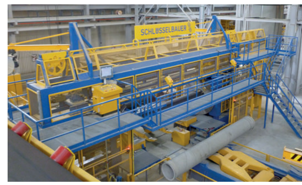
The pre-stressing machine developed by Schluesselbauer works at a wrapping speed of up to 6 m/s.

ring and/or longitudinal pre-stressing, steel pipe connections with a rolling or sliding rubber connection and the resulting different product characteristics led to the decisionmakers establishing a team of advisors under the coordination of a successful man-