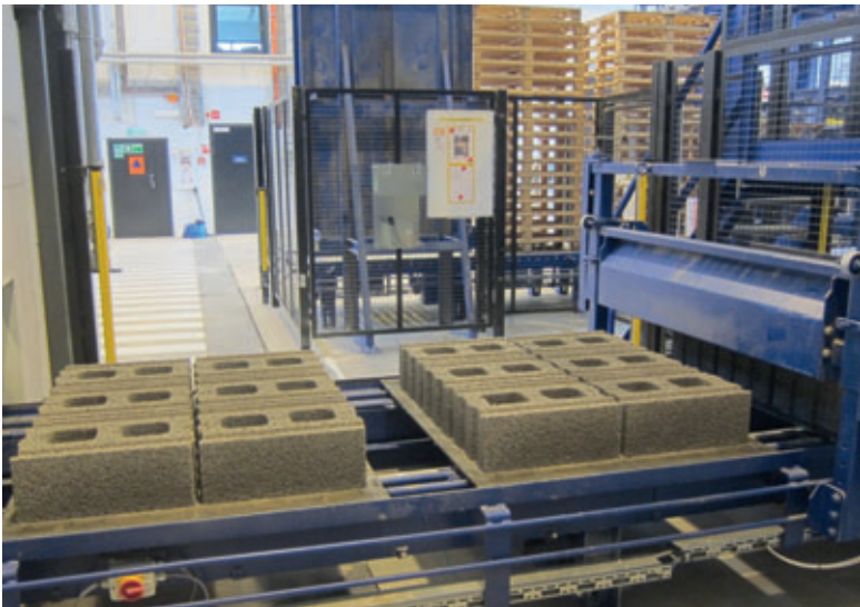
Hardened concrete blocks on the dry side

The steel boards with the hardened products run synchronously via a servo-motor-driven walking beam conveyor to the next station, the turner with integrated layer doubler. As the name already indicates, this device always places two layers of blocks on top of one another. To do this a horizontally rotating gripper first pushes a layer of blocks together, picks it up with its four clamps, rotates it horizontally by 90° and sets the complete layer down on the reforming line arranged parallel to the conveyor. A second layer of blocks is placed on top of this first layer in the same way.