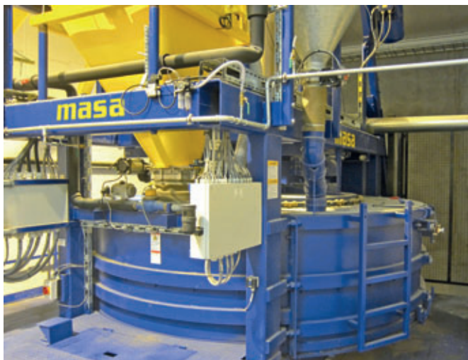
PH 3000/4500 horizontal compactor from Masa

As already mentioned, only the concrete silos for the aggregates remained from the original concrete plant and were saved by strengthening measures for the new production. Today, a total of eight silos, six old and two new ones, are fed by a newly installed bucket conveyor. The six larger silos each have two discharge openings in order on the one hand to avoid segregation and on the other to enable fast, accurate dosing. The two smaller silos each have one discharge opening. Dosing takes place volumetrically. The raw materials used in the production of lightweight concrete can sometimes absorb large quantities of water, which can lead to problems with the mixing process if these raw materials remove mixing water from the mixture. Therefore all dosing belts are equipped with spraying devices that spray the dosed aggregates with water, thus saturating them with water for the mixing process. The raw materials fall from the dosing belts onto a conveyor belt, which transports the