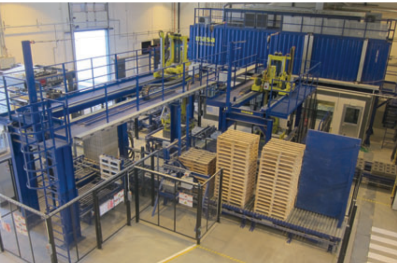
Clearly arranged and equipped with extensive safety technology: the new Masa concrete block production plant at Saint-Gobain Weber in Oitti, Finland

Masa's scope of delivery also includes the complete handling systems on the dry side.