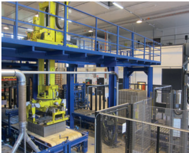
The second gripper robot takes up two block layers, which had been prepared by the layer doubler beforehand, and makes block packets out of them on the track located behind.

The empty production boards drive on automatically and subsequently pass through a cleaning station with scrapers and rotary brushes. After cleaning, the steel boards are placed in a buffer magazine again, ready for the next production cycle. An automatic oiling station is arranged directly in front of the block making machine. This applies the necessary release agent.