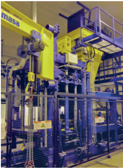
Masa XL 9.1 concrete block making machine

entire material to a bucket elevator. The filled bucket drives to the mixer level and empties itself into the mixer. The cement is conveyed from three cement silos to the mixer via screw conveyors and precisely dosed using cement scales.