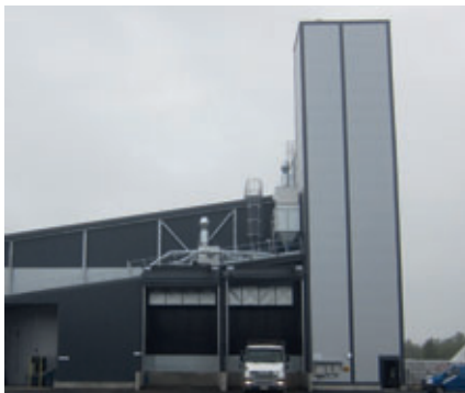
The newly built concrete block plant in Oitti