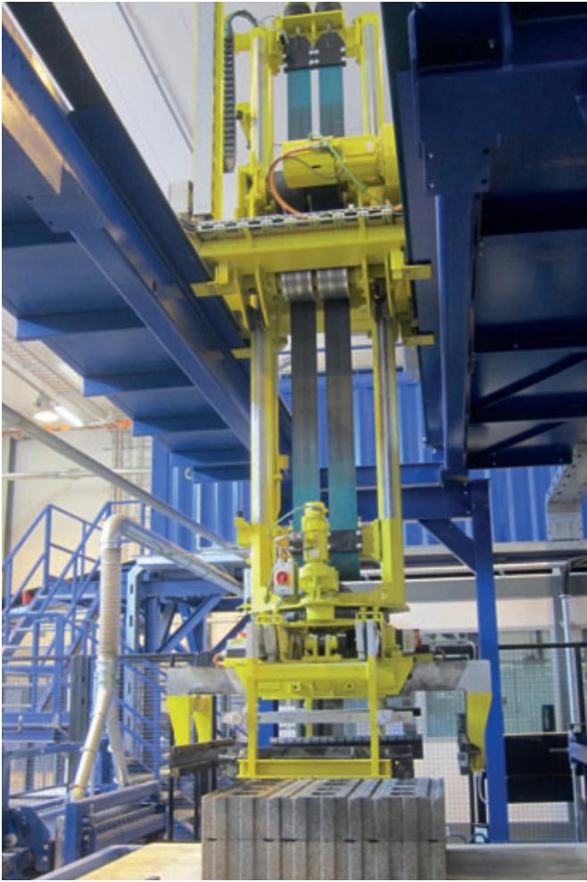
The rotary suspended gripping and clamping device with electrically-driven four-sided clamp

On the reforming line, which consists of an electrically driven pushing system and the reforming belt, the block layers can be increased or decreased in size in the direction of transport in new layers of any desired layer size. The reformed block layers are transported by the reforming belt under the pick-up point of the packet assembler. The reforming line is designed in such a way that it is faster than the block making machine even with unfavourable layer sizes. The block layers do not have to run via the reforming line, but can also be picked up directly from the packet assembler by the walking beam conveyor.