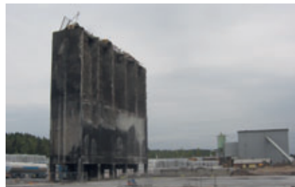
After the fire the plant was completely destroyed. Only the concrete silos could be preserved.

Gobain Group, which has reached a worldwide turnover of around € 43 billion. With an investment of nearly 10 million Euros, Weber erected one of Europe's most modern concrete plants for concrete blocks made of lightweight concrete in Finland. More than 1 million Euros were accounted for by fire prevention measures as a conse-