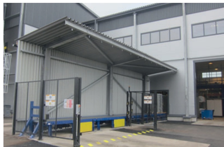
No corners were cut in Oitti where safety technology was concerned. All stations were planned and implemented to very high safety standards.