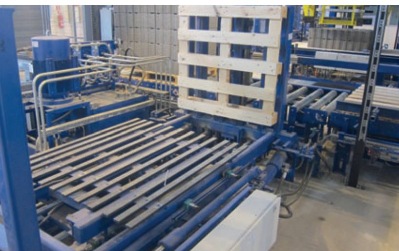
Block packets can be prepared 'lying down' with the tilting table.

Before the block packets are driven out of the production hall, they can optionally be provided with stretch hoods in the next station. Before leaving the hall, each finished packet is automatically marked by a labelling machine with a label for quality control purposes. This allows the exact production time and also the product specifications to be checked even months later. After that the packets are transported out of the hall into the outdoor area and are