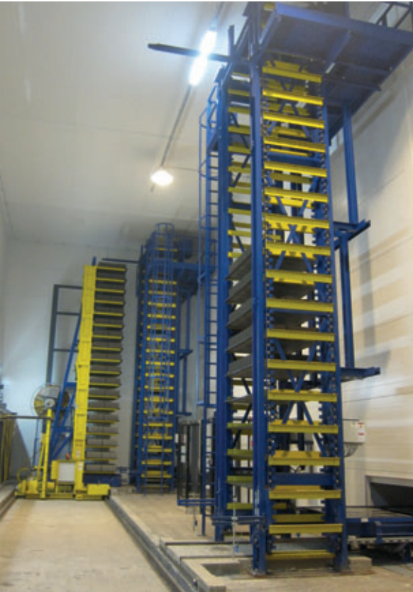
Transfer of hardened concrete goods to the lowerator on the dry side

unit seems to have raised the bar even further in terms of height accuracy, much to the delight of Saint-Gobain Weber. The standard scope of delivery of the XL series from Masa includes an automatic mould changer with automatic height