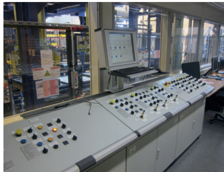
The entire circulation can be controlled and monitored from the control room.