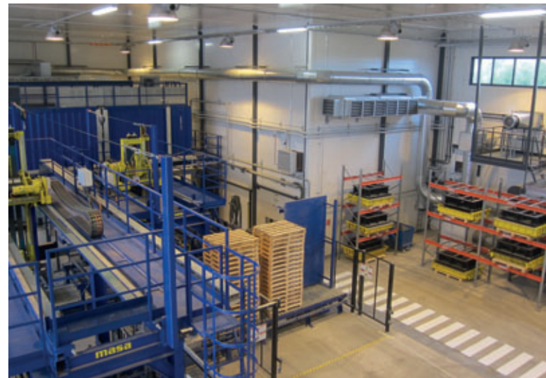
The winters in Finland are long and hard. In order to be able to produce continuously despite that, the complete hall has been lined with flame retardant insulating elements.