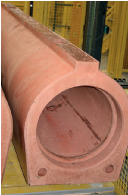
Perfect Pipe concrete pipes with or without inliners are manufactured as link pipes in construction lengths from 1000 to 2500 mm.

part of the installation, these can be efficiently installed in the concrete works. All variants can be manufactured semi-automated whilst retaining the favourable static qualities of this pipe.