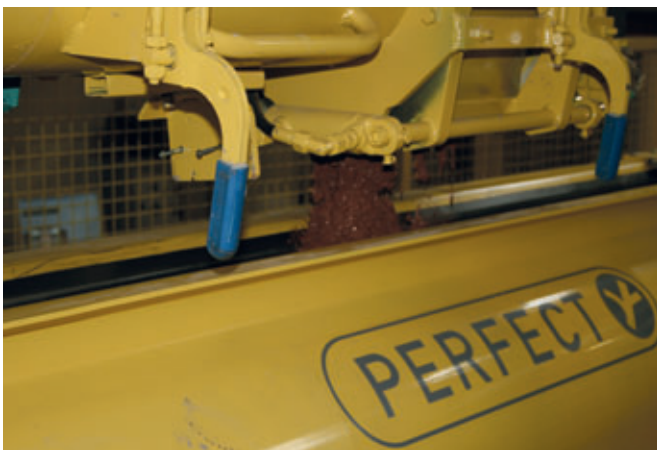
The concreting equipment specifically designed for Perfect Pipe manufacture.

pressure of 2.5 bar. The flexibility achieved for link pipe manufacture enables the manufacturer to produce pipes with and without HDPE liners respectively. Regardless of whether the new base pipe is designed as a concrete pipe or a pipe with an inliner, link pipes are also available in both variants with and without cage reinforcement. Where lateral intakes in the pipe are already required as