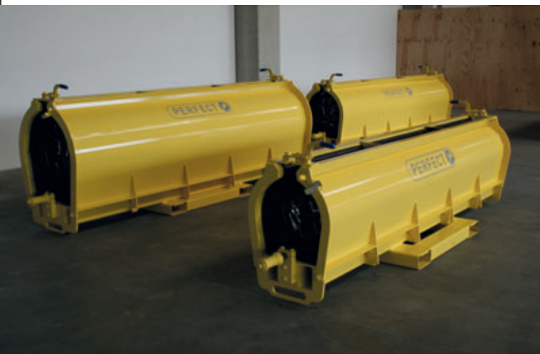
Separate mould equipment is available for the manufacture of link pipes of the nominal widths DN250 to DN600.