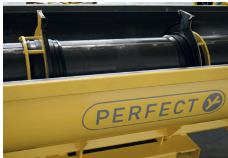
View of a link pipe mould with freely adjustable lateral seals.