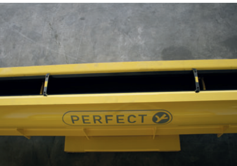
Individually adjustable lateral seals enable individual construction lengths in Perfect Pipe link pipe manufacture.

Schlüsselbauer Technology GmbH & Co KG Hörbach 4 4673 Gaspoltshofen, Austria T +43 7735 71440 · F +43 7735 714456 sbm@sbm.at · www.sbm.at www.perfectsystem.eu