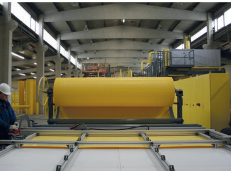
The HDPE inliner tracks are cut to length for a perfect fit according to nominal width and construction length.

With regard to media resistance, the Perfect Pipe can optionally be universally equipped with an HDPE inliner. Universal means that the pipe is equipped with a lining which is firmly anchored into the concrete and the pipe connection also consists of HDPE. Dependent on manufacture and processing, the wall thickness of the inliner is a minimum of 1.65 mm. A multitude of geometrically optimised anchors on the reverse of the inliner ensure that this comparatively thin plastic film is reliably bound to the concrete. The tensile force of an individual anchor is at least 250 N. The pipe connector is able to durably withstand an internal