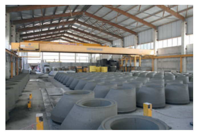
The new Perfect manhole base manufacture is housed in the rear section of this hall, where precast manhole components have been produced with a Schlüsselbauer Exact plant for years.

ingly manufactured by hand at Grafe Beton every day before commissioning of the new Perfect manufacture. With the modern Schlüsselbauer manufacturing system, one single employee can now manufacture ten concrete shaft monoliths every day.