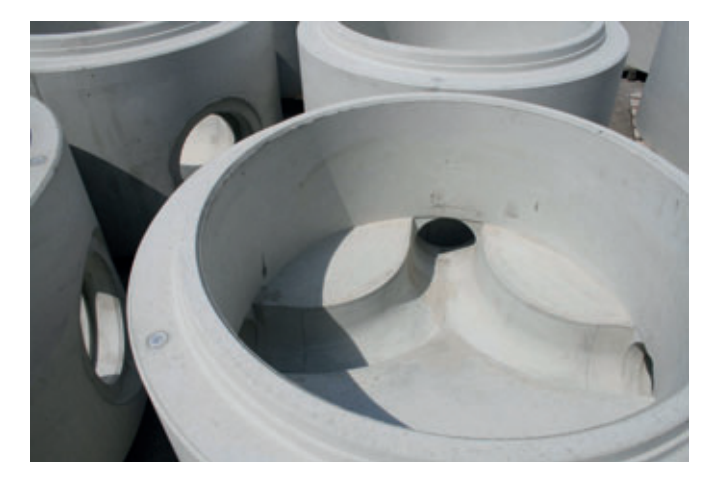
The high quality of the concrete surfaces convinced Grafe Beton right from the outset