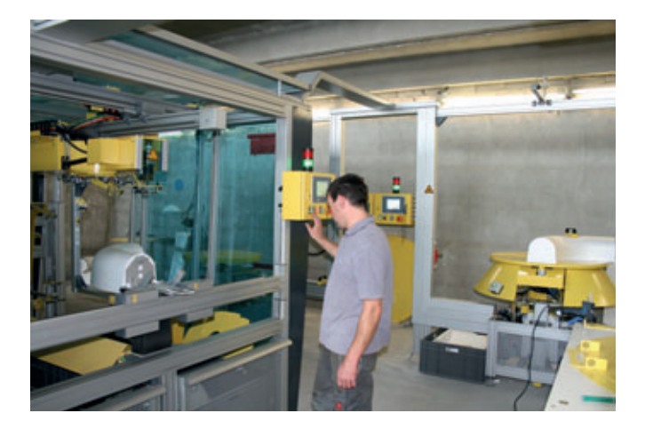
View into the processing centre for the EPS negative channel