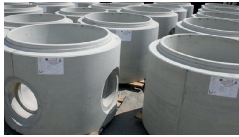
Finished Grafe Perfect manhole bases in the field warehouse.