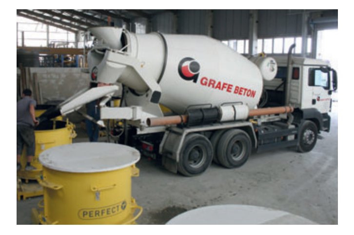
A truck mixer from Grafe's own fleet transports concrete to the production site

The truck mixer is not used for small quantities at Grafe. A complete day's production is always encased in concrete. This means that the employee only manufactures the negative channel for up to ten moulds in the processing centre and installs it into the moulds. Only when all moulds are fully filled and firmly sealed is the concrete mixer called.