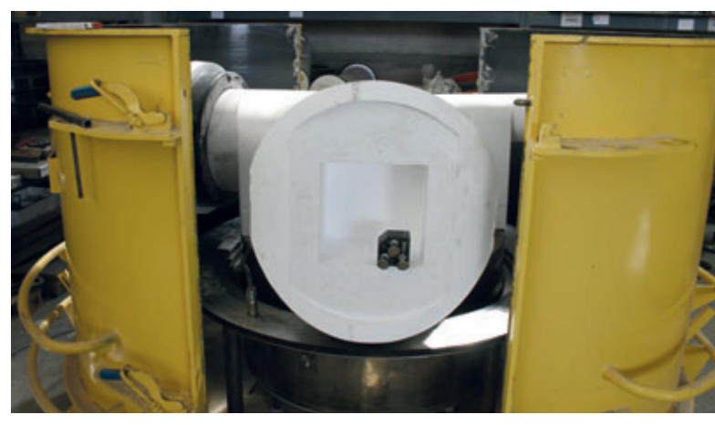
The assembled EPS negative channels are fixed in the steel mould using magnetic technology and secured from lifting.

and also glued. Different negative bodies are available for the connections. EPS connection negatives with assembled seals permit, for example, the manufacture of concrete manhole bases with integrated seals. Once the concrete shaft elements have hardened, the EPS bodies are removed and the seals remain firmly connected to the concrete in the pipe connection.