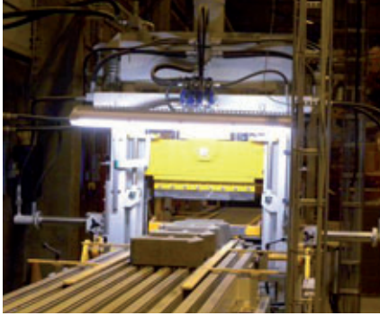
1st splitter with walking beam conveyor