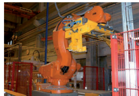
Robot with pincer type grab