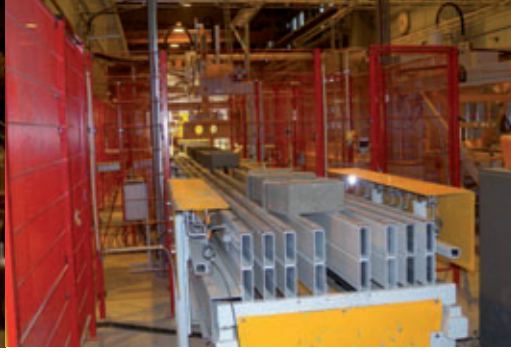
Formatted products before removal by robot