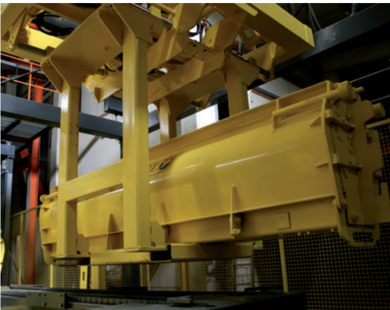
A robot accepts the filled mould and deposits it in the curing area provided or a mould with pre-hardened product is accepted and placed in the plant for automatic demoulding.

lining, the new type of pipe should also be manufactured as an optimised pure concrete pipe. A requirement which was in perfect harmony with the focus in Schlüsselbauer's current development activity. The nominal width range DN300 to DN600 represents the highest substitution