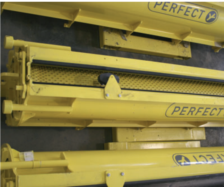
The shapes designed for horizontal manufacture are available with or without a liner for the concrete encasing process which is also automated.