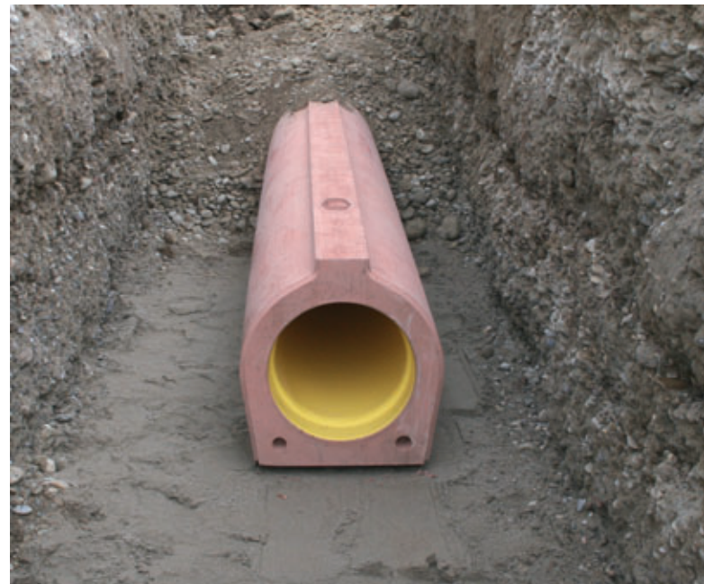
The first tests for productivity, quality, and performance exceeded the expectations of all involved.