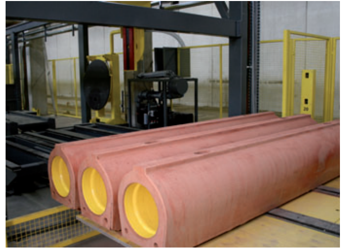
The demoulded products are placed in groups on the outfeed belt according to the nominal width after an in-line vacuum test and conveyed out of the hall for storage or delivery.

for concrete products. This trend should be actively counteracted with a new concrete pipe. The benefits of the rigid material should once again become the focus of pipe planning due to the selected pipe geometry and the use of different need-based concrete mixtures. The new quality of pipes cast from self-compacting concrete and the advantages of the simple installation of the pipe together