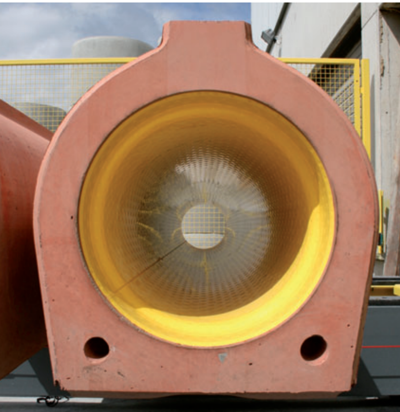
The base pipe geometry facilitates construction site use and accuracy of the pipeline. The flat bottom surface also facilitates handling for storage and transport.

with the acknowledged advantages of concrete should increasingly be promoted for the construction of durable pipeline systems. Beton Müller places its trust in its great in-house concrete competence with both variants of the new pipe – with and without lining. The standard version of the Perfect Pipe concrete pipe is manufactured from C40/50 self-compacting concrete. With increased demands on the resistance of the concrete pipe C60/75 high-performance concrete is selected, using HS cement with increased sulphate resistance up to 3000 mg/l. The concrete formula optimised at Beton Müller leads to proven increased resistance to chemical attacks. In both cases the concrete pipes harden in the mould. Dependent on project-specific requirements the pipes can be exe-