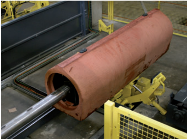
The internal steel core still located in the pipe – which is equipped with a shrinking mechanism which is also newly developed – is now automatically ejected.

for concrete products. This trend should be actively counteracted with a new concrete pipe. The benefits of the rigid material should once again become the focus of pipe planning due to the selected pipe geometry and the use of different need-based concrete mixtures. The new quality of pipes cast from self-compacting concrete and the advantages of the simple installation of the pipe together