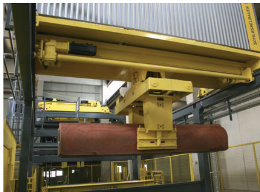
An additional robot accepts the product after automatic opening of the moulds.