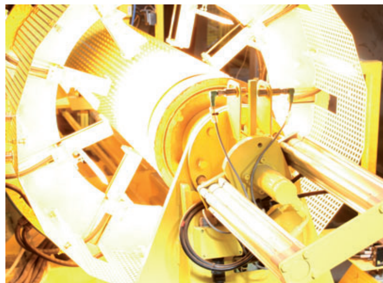
The liner ends are shaped according to the design of the pipe joint in a thermoplastic reshaping process.