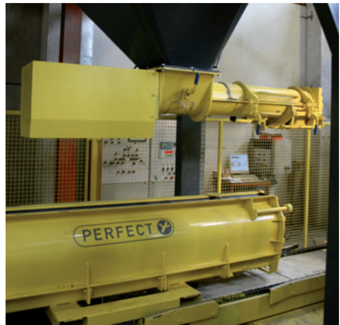
The concrete encasing station is continually supplied with SCC from the mixing plant via a transfer hopper.

industry in particular, has to be taken into consideration, and these would currently be the manufacture of concrete pipes and the increased application of piping with higher resistance to chemical attacks. The concept for a new concrete-plastic composite pipe Perfect Pipe+ first presented in