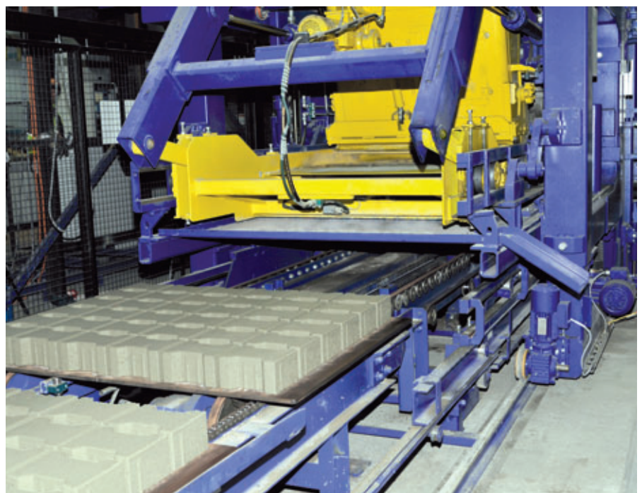
XL 9.1 Fast Version