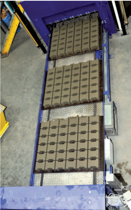
Wet side transport in the form of a chain conveyor

Customer service/assembly work: HS Anlagentechnik Ant GmbH & Co. KG Hegelstraße 6 • D-57290 Neunkirchen Tel. 0049/2735/781160 • Fax 0049/2735/781162