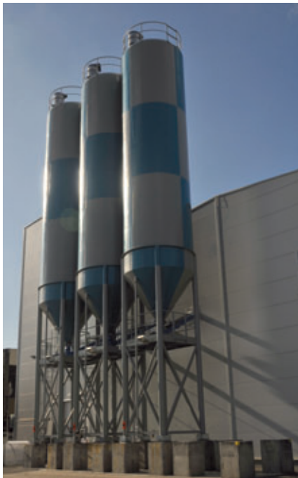
External view of the Diton Paskov works

In winter 2010/2011 Masa GmbH received an order from the Diton company to supply a complete block-making plant to the Czech Republic. This is Diton's third Masa machine following the first in 2005 and the second in 2007. As special highlight and in contrast to the previously supplied plants, the third generation is equipped with "FAST - Factory Automation System Tool" – Masa GmbH's new plant control software. This software provides even better assistance to the operators in the control of the plant.