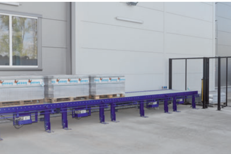
Packet transport to removal by fork lift truck

The blocks are removed from the rack system to the dry side after hardening. To this end the transfer table transports the dried