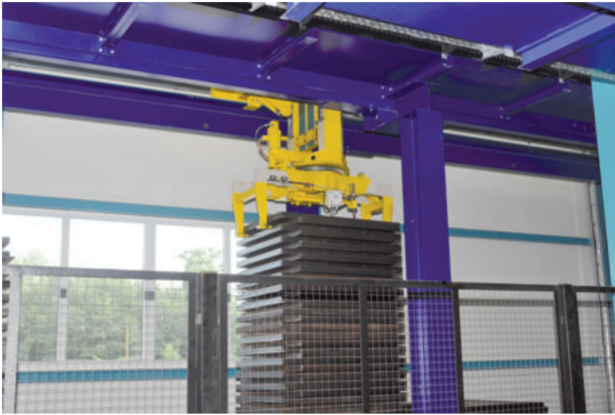
Pallet packet gripper for putting the production pallets into and taking them out of the pallet store

blocks to a mobile buffer rack and from there the products are taken to the lowerator. The layers are taken by the return transport with 4-sided centring to the packet assembler, where the blocks are assembled fully automatically into block packets. The return transport is likewise executed as a chain conveyor.