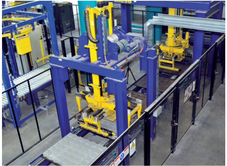
Return transport with four-sided centring and packet assembly

concrete filling sections. These filling sections can be opened separately, so that the machine is much more accessible for cleaning and maintenance.