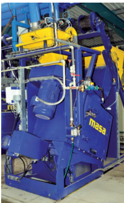
Twister S 350/500 facing concrete mixer

The Masa PH 2000/3000 and S 350/500 high performance mixers produce highest concrete quality for all quality classes with short mixing times. The large mixer for the production of the core concrete works according to the counterflow principle with mixing tool movements at several levels. This results in even and homogeneous mixing. The facing concrete mixer