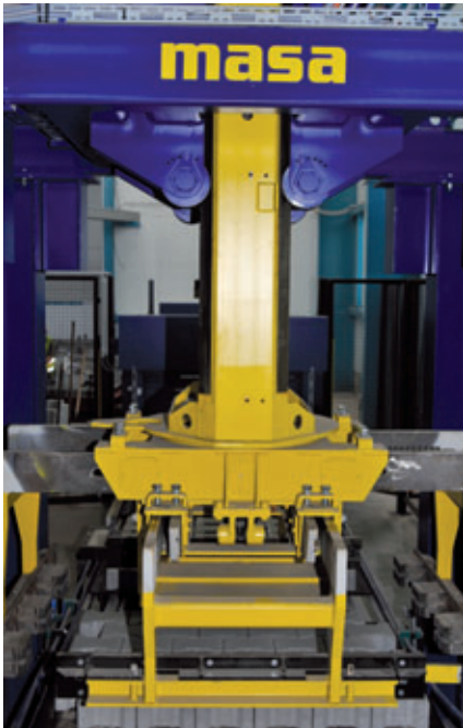
Detailed view of a four-sided centring unit with servo drives