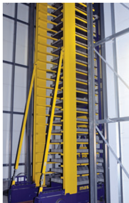
Pre-lift in the form of a mobile buffer between the transfer table and lowerator