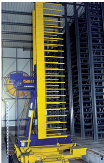
Transfer table and rack system

The machine consists of a three-part machine frame, the centre section with vibrating table, and the core and facing