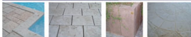
Wet cast production

Contact our sales / distribution service at +33 (0)4 50 03 92 21 www.quadra-concrete.com