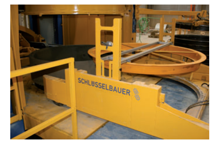
An innovation in the manipulation of support rings – a manipulator undertakes the work-intensive process of fitting support rings

Immediately demoulded products are removed by an electrical truck at Eurobeton. The support rings used to protect the construction are automatically placed on the product by the electrical truck. Thus, a working step which in the past always required a second worker for a short cycle time due to the large dimensions of the components is now unnecessary. The entire manufacturing process can now be accomplished by a single worker as the production plant has been additionally equipped with an automatic pallet feeding device. It is therefore not only the cost-effectiveness of