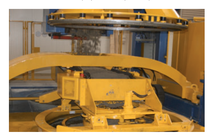
The entire concrete supply of the Magic2500 was newly constructed with a view to rapidly inserting concrete into the machine

than 8,000 cbm of concrete annually, Eurobeton is one of the leading manufacturers in the Czech Republic. The specification of drastically reducing the wall thickness of 120 mm which was customary