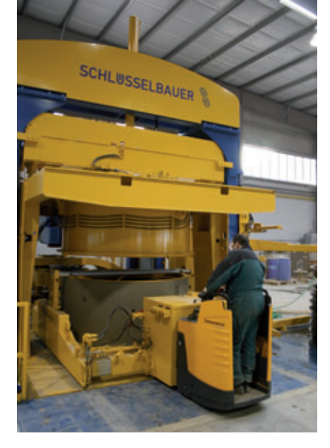
The support ring manipulator permits the operator to effortlessly place the support rings on the new product without being assisted by a second worker

for large-format components on the Czech market whilst simultaneously increasing production quality was crucial for the company in the decision for investment in new manufacturing technology. The aim was to attain a roughly 20 % reduction in the concrete volume used. In the decision-making phase, the Magic2500 was ascertained as the plant which would be able to implement the specifications. The Magic2500 is a production plant which enables predominantly large-format precast components to be manufactured economically with the flexibility of the Magic. For DN2500 manhole rings the envisaged over 20 % reduction in the concrete used was achieved, for DN1500 and DN2000 manhole rings the reduction was even more than 25 %.