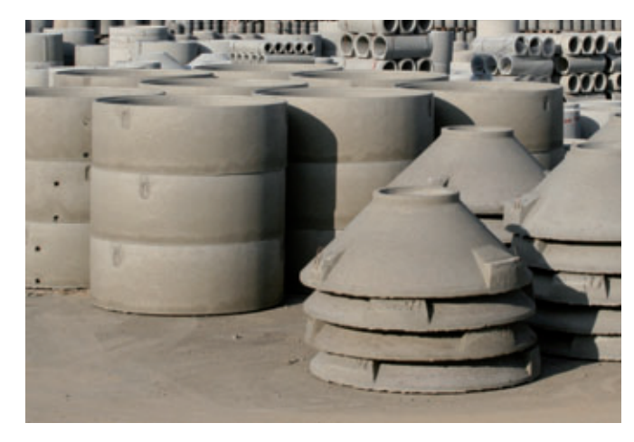
The MAGIC2500 products on stock at Eurobeton Chvaletice: manhole rings, seepage rings, cones

The renowned precast component manufacturer Eurobeton which is located in the Czech city of Chvaletice has started the new year with a noteworthy boost to its production technology. A plant for the manufacture of large format rings and cones was commissioned at the beginning of the year in the company which belongs to the MABA group. This created the basis for the manufacture of products with reduced wall thickness and generally took into account the special significance of this important product segment for Eurobeton customers. With the Magic2500 supplied by Schlüsselbauer, manhole rings, cones and 3 chamber rings to DN2500 can from now on be produced more economically and to higher quality standards than previously. The reduction of costs is due, on the one hand, to reduced concrete consumption, and on the other hand to the one-man operation during manufacture which has now been accomplished. In addition to these basic requirements of a new manufacturing plant, it was predominantly flexibility and the ability to change production over to other products with minimum time expenditure which were crucial for the investment decision at Eurobeton.