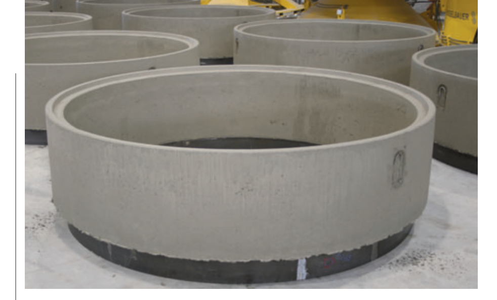
DN1500 manhole rings in the setting area