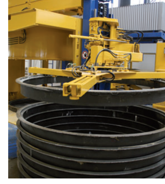
The automatic pallet feeding device is a crucial element in the one-man operation of this plant.

Thanks to intensive cooperation with Schlüsselbauer, the decision was finally made to manufacture the entire product group consisting of manhole rings and cones in the nominal widths DN1500, DN2000 and DN2500 with a wall thickness of 90 or 95 mm. All manhole rings are also now equipped with three transport loops respectively. The rings can optionally be equipped with percolating holes. Three-chamber rings are also manufactured in the nominal widths DN 2000 and DN2500. Cones of all nominal widths are executed with three stacking notches each in order to be able to store the products safely on top of one another, thus saving space. The stacking notches have been executed in such a way that inflows and outflows can be integrated at a later date. The component height of the