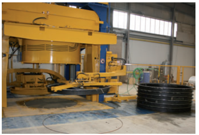
One-man operation of the entire production plant by automated processes, only the insertion of the reinforcement ring is manual.