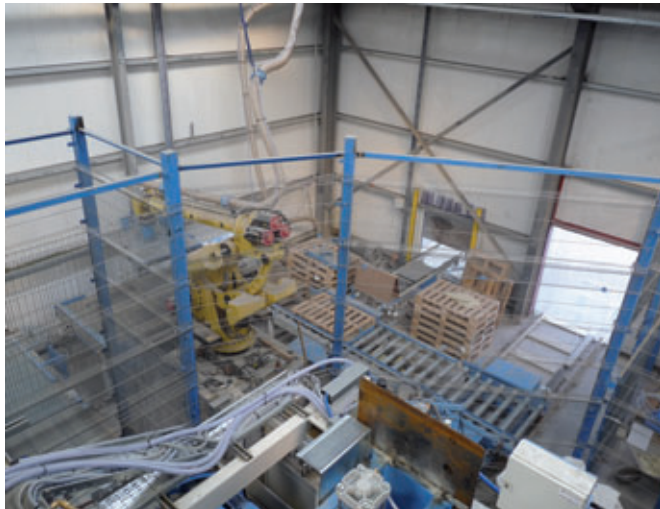
Fanuc robot takes off the products individually after quality control

The following flat or on edge packing is format related. For on edge packing a Fanuc robot takes off the products individually after quality control and puts them on a pallet which gets fed from an empty pallet magazine and transported by a roller conveyor to the loading position. For stable packing of the products in an upright position a wooden chock transported by a chain conveyor to the loading position gets put on the pallet by robot. Only then the robot deposits the products on the pallet. That way 2 product packs – one left and the other right of the chock – are on the pallet then. For flat packing product layers get pushed and if need be rearranged by layer pusher on a take off table where the robot picks them up. Upon flat and on edge packing a vacuum suction plate mounted at the robot wrist is used. Once the pallet is fully loaded a heavy load roller conveyor trans-