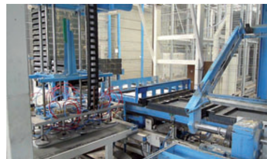
Demoulded products deposited on belt