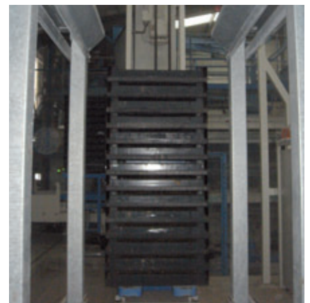
Finger car with pallet stack

For packing a belt conveyor transports the demoulded products to the drum turning device for 180° turning that the product face shows upwards for visual control by operator. 2nd choice products get exchanged manually.