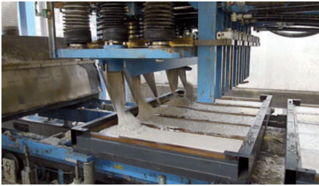
The heart of the plant is the patented volumetric Smartdoser