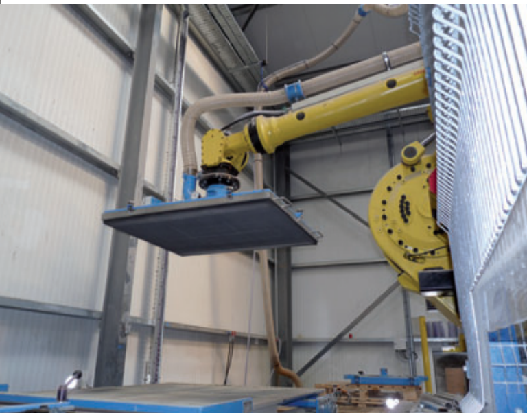
Upon flat and on edge packing a vacuum suction plate mounted at the robot wrist is used.

The following flat or on edge packing is format related. For on edge packing a Fanuc robot takes off the products individually after quality control and puts them on a pallet which gets fed from an empty pallet magazine and transported by a roller conveyor to the loading position. For stable packing of the products in an upright position a wooden chock transported by a chain conveyor to the loading position gets put on the pallet by robot. Only then the robot deposits the products on the pallet. That way 2 product packs – one left and the other right of the chock – are on the pallet then. For flat packing product layers get pushed and if need be rearranged by layer pusher on a take off table where the robot picks them up. Upon flat and on edge packing a vacuum suction plate mounted at the robot wrist is used. Once the pallet is fully loaded a heavy load roller conveyor trans-