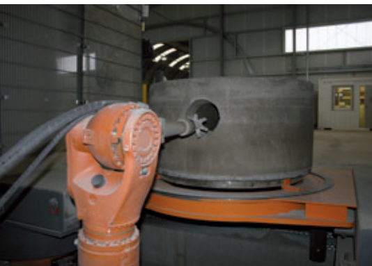
Once a connection has been milled, the robot arm moves back and the manhole is automatically turned to the next milling position.

Prinzing GmbH Anlagentechnik und Formenbau Zum Weißen Jura 3 · 89143 Blaubeuren, Germany T +49 7344 1720 · F +49 7344 17280 info@prinzing-gmbh.de · www.prinzing-gmbh.de www.top-werk.com