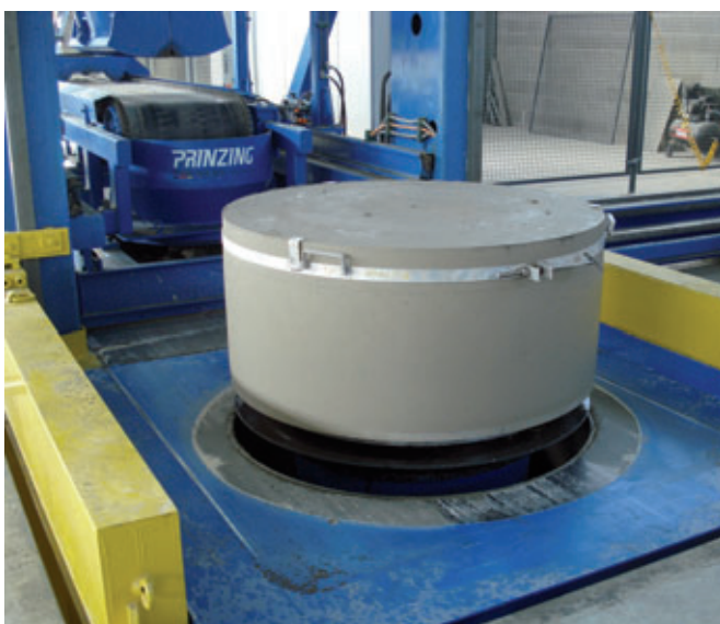
Raw manhole base blank after demoulding. After a short hardening time the blank can be taken to the milling station.

be pushed into the Tornado machine with the pallet inserter. Short mould exchange times enable economic production with frequent dimension changes, while the infinitely variable height adjustment system enables flexible production of manhole elements.