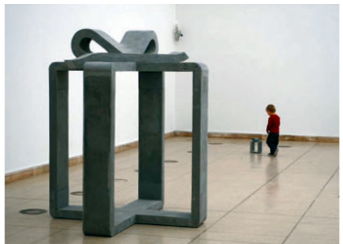
Concrete art – made by Dolomit