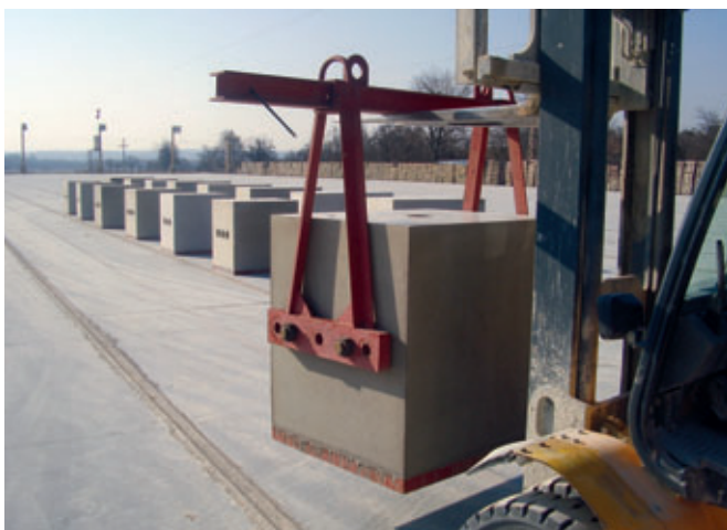
Special components made of SCC – another Dolomit speciality

Although the young company is not yet one of the big players in the Hungarian market,