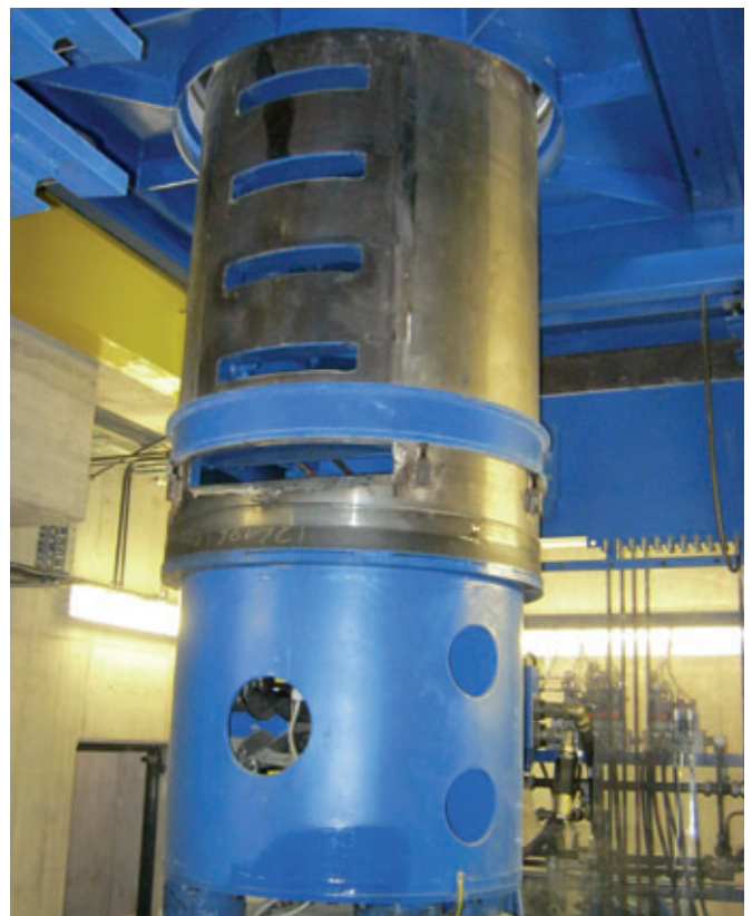
Manhole mould core for direct integration of manhole steps