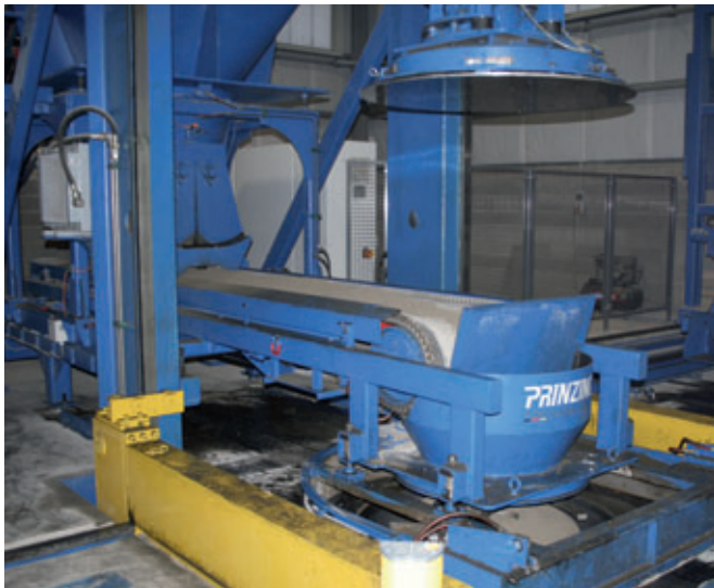
Dosing shutters below the concrete reservoir ensure optimised mould filling