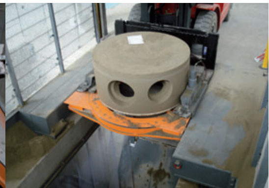
Removal of milled manhole base from the Primuss machine