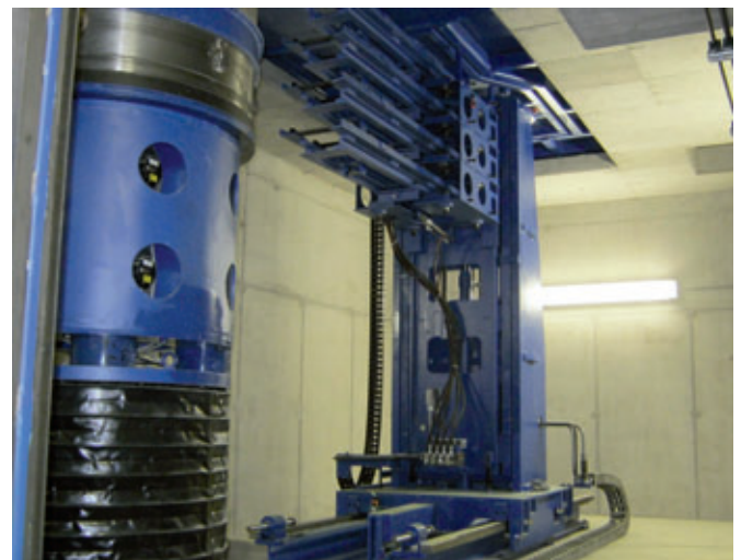
Automatic step magazine for manhole ring and cone production