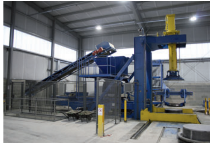
Fully automatic Tornado manhole machine from Prinzing

The base pallets are collected and transferred to the automatic enclosed cleaning station with a forklift truck. The pallets are separated before they pass through the cleaning station. After the cleaning cycle the cleaned pallet is pushed out of the station and replaced with another pallet for cleaning. After the cleaning station the pallets enter the release agent station connected to it, where release agent is applied to the pallets quickly and precisely via a rotating spray mechanism. The pallets prepared in this way can then