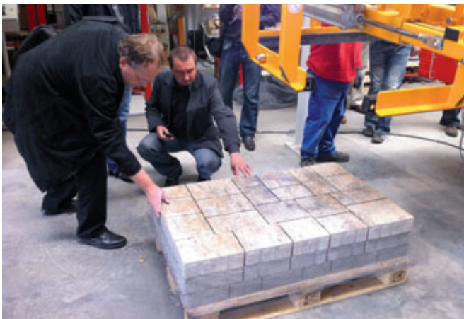
The refined blocks practically "force" one to touch them

The demonstration plant, by the way, will be installed together with a second refinement line in a concrete plant in Poland in the coming months. CPI-Worldwide will report in detail on this. ■