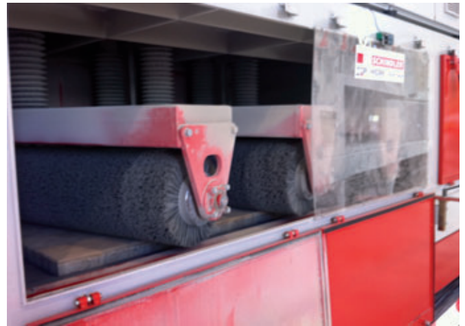
View of the curling brushes

Surface coating was introduced as a new development. Here, the products are pre-heated by infrared heating, then sprayed with the appropriate surface protection coating and finally dried by infrared radiation. The TopCoat surface protection coating was developed by a Polish chemist and is marketed by the Chemtech Bayern company. During the in-house trade fair, chemists von Chemtech provided the visitors with technical information and the Riedel company, abrasives experts from Rheinböllen and suppliers of the grinding