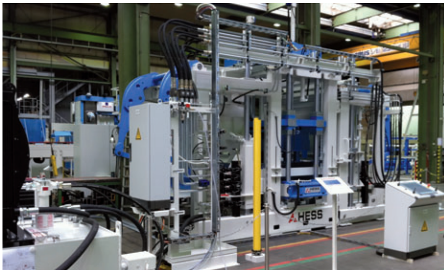
As an entry-level machine, the new RH 1400-3 VA concrete block making machine is intended to pave the way for future customers of Hess's large pallet machines

The Hess Group once again sent out invitations to the traditional in-house trade fair at the company's headquarters in Burbach Wahlbach, Germany, on 22 and 23 September. More than 340 customers, suppliers, guests and friends from Germany and abroad took the opportunity to see for themselves the production facilities and latest developments at first hand on site.