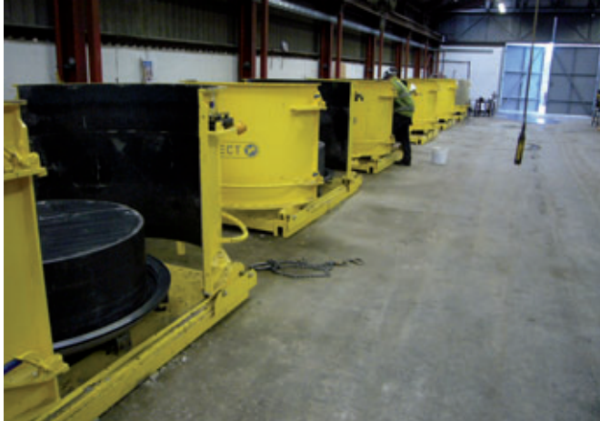
CPM manufactures monolithic Perfect manhole bases in a dedicated production hall.