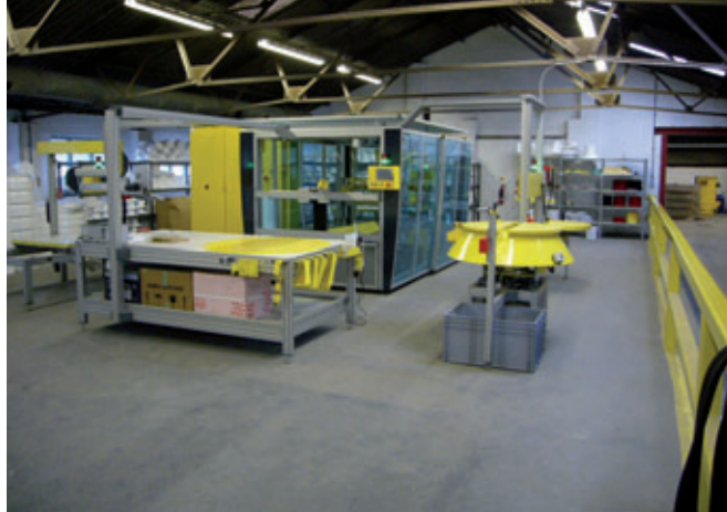
Hot wire saw technology provides simple methods in the manufacturing of individual manhole bases.

with the Perfect system at other production sites across Europe, working closely together to organise day-to-day manufacturing. The channel mouldings are essentially delivered entirely preconfigured to the site in Ilkeston, Derbyshire where they are formwork-hardened using self-compacting concrete. This reliable manufacturing process turned out to be exceptionally easy for Stanton Bonna.