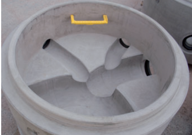
Perfect manhole bases not only offer perfectly shaped channels for the most complex structures, they also boast integrated seals.