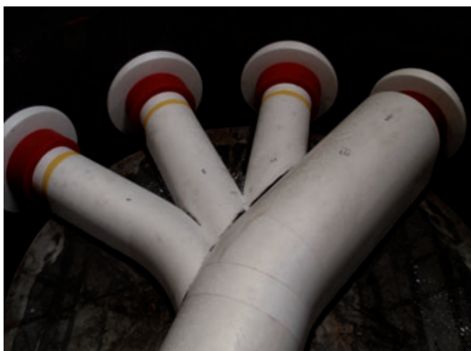
There are no limits in terms of planning freedom – all negative channel mouldings can be individually adjusted.

Both CPM and Stanton Bonna take full responsibility for the manhole structure in terms of planning and designing the manhole base, including the precision-fit channels and pipe connections. This responsibility includes ensuring that production complies with the relevant standards, taking quality control into consideration (internal and external monitoring), as well as ensuring that the project is well executed in terms of planning and implementation. In most foreign markets, such a move would be rejected by manufacturers of prefabricated components. For the UK manhole construction sector, this approach does however create an opportunity to drive forward technological advances and transform a side venture in precast manufacturing into an attractive business area for the leaders in modern manhole base production. From the very beginning, CPM was convinced that this approach could well create a shift in the market away from the time-consuming