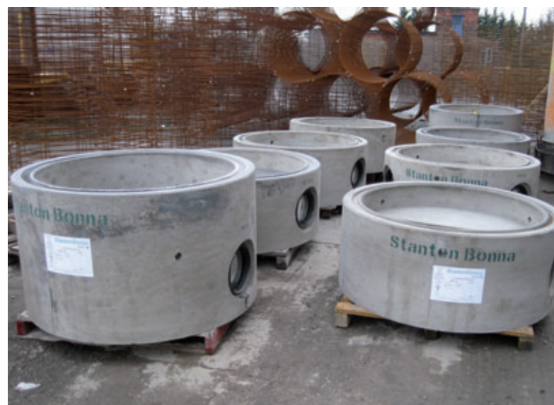
Immediately after demoulding, the manhole bases are loaded onto pallets at Stanton Bonna