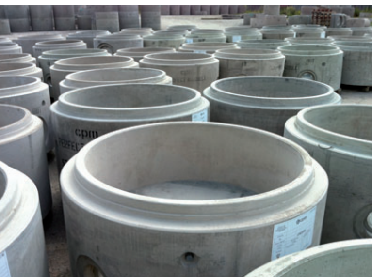
Perfect manhole bases in the loading area at the CPM site in Staffordshire

Another member of the Concrete Pipeline Systems Association, Stanton Bonna adopted a different approach to implement the manufacturing method as quickly as possible. As part of the Bonna Sabla Group, one of the largest European manufacturers of prefabricated concrete components for drainage engineering, Stanton Bonna was able to draw on many positive experiences