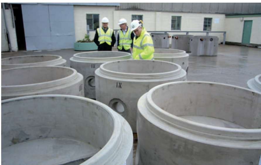
Construction companies and clients interested in the work are informed of the benefits offered by precision-fit precast concrete components at CPM.

Schlüsselbauer Technology GmbH & Co KG Hörbach 4 4673 Gaspoltshofen, Austria T +43 7735 71440 F +43 7735 714456 sbm@sbm.at www.sbm.at www.perfectsystem.eu