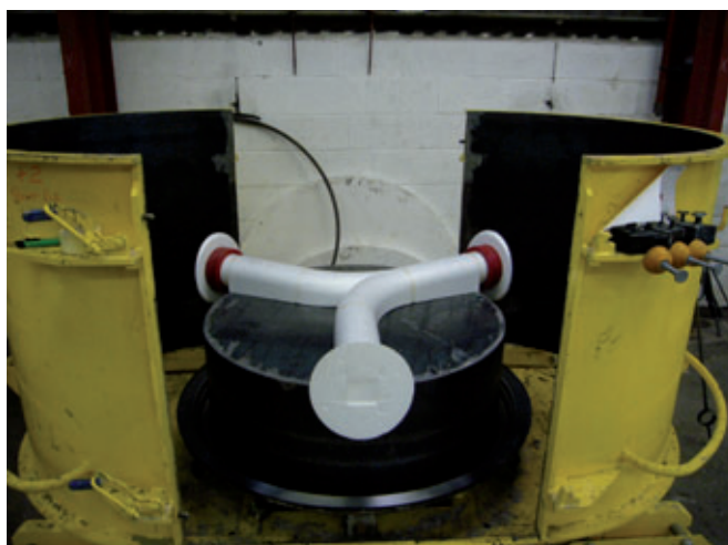
The EPS channel parts are positioned in steel moulds where they are then cast using self-compacting concrete.