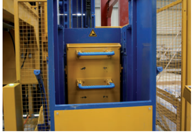
The automatic unit for fitting the moulds with steps is called the Stepmaster

The concrete is produced at the start of the chain and in this case is provided by a Skako concrete mixing and transport system. The concrete used for the production of the manhole components is made with Portland cement and corresponds to compressive strength grade C 40/50. This is transferred earth-moist to the Magic 1501 and fed straight to the system via a conveyor belt. After the mould is filled, a vibration unit provides for uniform compression of the concrete. The smoothing and pressing bar guarantees the dimensionally accurate finish of the head of the concrete ring. After the fresh blank comes out, preparation is made for the next manhole component with the programme-controlled insertion of the bottom pallet.