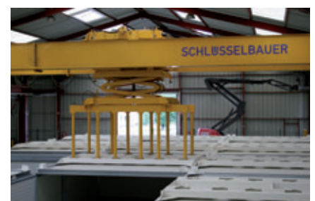
The rotating gripper bars allow the cover sections to be moved without the need to change tools