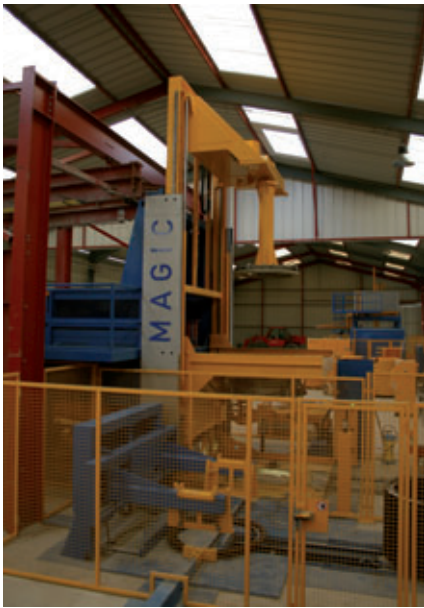
The new Magic 1501 production system at Bonna Sabla in the precast plant in Bruz

A minimum of personnel, consistently perfect product quality and an average of 25 risers in one hour was the challenge set for Schlüsselbauer by the French precast concrete manufacturer Bonna Sabla in the summer of 2010. After a short, intensive planning phase, the answer was found and Bonna Sabla went for the manhole component production system known as Magic 1501. It can be used to produce large quantities of manhole components like rings and cones. In August 2011 the fully automated system went into production at the precast concrete plant in Bruz near Rennes in France at its most advanced level yet worldwide.