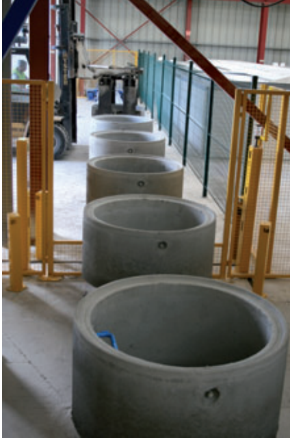
Transfer to the product conveyor belt. The concrete components leave the production hall in the next shift

and storage of the fresh concrete products in the hardening chambers, the so-called kilns. After storage in the kilns, the support rings are removed from the concrete components and fed back into the production cycle. This process also is done automatically.