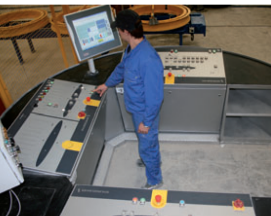
All the work sequences between the concrete mixer and removal of the products are so highly automated that one operator looks after them all.

As the name suggests, the pallet is separated from the concrete component in the pallet removal and cleaning station, the pallet