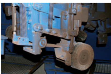
Steel brushes removing concrete residue from the pallets