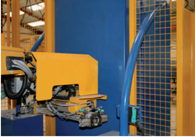
The robot fully-automatically takes two anchors and positions them into the mould