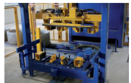
The latest development from Schlüsselbauer: the quick change unit for grippers