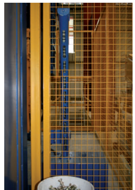
A new feature in precast concrete production: the transport anchor magazine with a capacity of about 25 anchors per mounting side

Planning the restructuring of the precast plant in Bruz involved setting some tight restrictions with the motto being how to create high production capacity with the least possible use of personnel in existing production facilities; a challenge indeed for any machine or system builder. With the Magic 1501, at its most advanced level yet, Schlüsselbauer can offer a fully automated production system for manhole components where one operator can control and handle the entire production process. From the transfer of the concrete to the hopper to the removal of the hardened manhole components to the final store, the whole thing runs fully automatically.