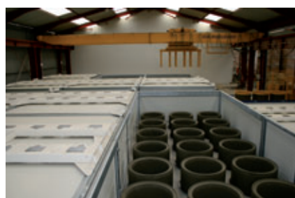
The hardened manhole rings shortly before removal by the crane robot