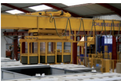
Storing the fresh manhole rings in the kilns

The automatic transport and storage system "Transexact" is the essential element of the fully-automated system in the Bonna Sabla plant