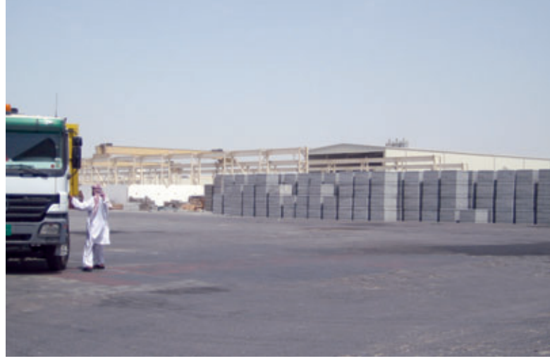
The total capacity of Foresight Cement Industries L.L.C in Abu Dhabi is 100,000 hollow blocks per day.

without welding work and elaborate alignment of the replaced components. The manufactured block formats remain dimensionally accurate and meet the quality demands of the international concrete industry. Versions of special block types, e.g. even flanks of cornerstones or special mortar pockets, are supported by Kobra with bolted facing parts, which can also be replaced as wearing parts.