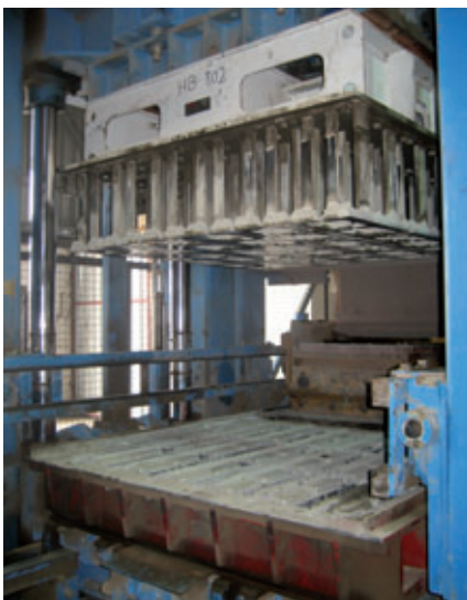
Foresight Cement Industries L.L.C. produces the 8" hollow block on a Masa XL 9.2

At Kobra, all parts for mould construction are entirely reproducible and convince as spare parts with the quality of an original part. If small quantities of these critical parts are kept in stock in the concrete works, production losses with long downtimes, for example after an accident in the block manufacturing, can be avoided. The ease of repair of the moulds has been adapted to the conditions in the concrete works and significantly increased. The damaged mould is rapidly restored to full functionality