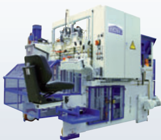
913 THE BESTSELLER