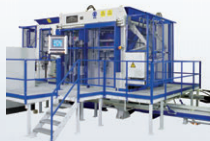
844 THE PAVER-CHAMPION