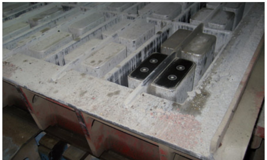
Bolted, case-hardened single cores have proven themselves in practice.