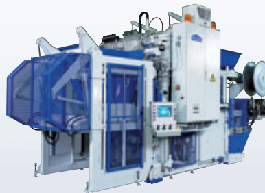
940 THE MULTITALENT