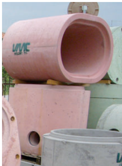
A distinctive feature at VMC: oval manhole bases (800/1200 mm)