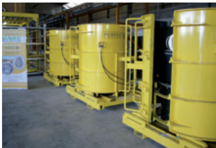
VMC has been producing monolithic Perfect manhole bases since the spring of 2011 in this adapted hall section

The spring of 2011 saw the start-up of another production system not too far from Venice, to produce individual monolithic concrete manhole parts using the Perfect process. In the family-run business VMC Srl., Veneta Manufatti in Cemento, in picturesque Resana, they had spent a long time working on processes to produce precision prefabricated components. Alongside the requirement to come up with new manufacturing technology that could also produce a new range of products, it was primarily quality aspects based on the end product that were taken as the basis for the decision to invest. In any case, the aim was to produce wet cast products, completely cured in the mould and thereby guarantee a reliable level of high component quality. Also, the manufacturing technology to be used was to be tried and tested and able to deliver the expected high standard of manhole components in everyday production. VMC put a considerable amount of time and effort into testing the actual product quality expected. Over several months components were repeatedly purchased from different manufacturers. These manhole bases were not used just to test market acceptance in Veneto; in fact, the company was able to get a consistent picture of the actual quality available without depending on the opinions of third parties or on an assessment of product samples, as they are plugged time and again at trade fairs or displayed in glossy brochures.