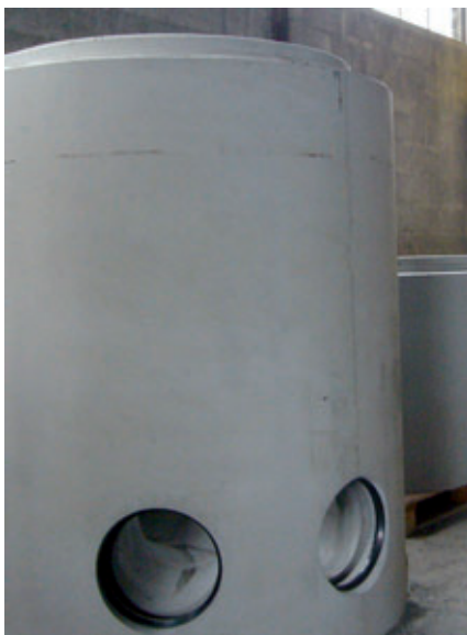
The quality of the wet cast components is evident – immaculate surface from the channel base through to the spigot.