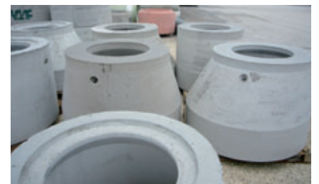
Alongside the Perfect manhole bases, the manhole structures – circular und oval – have the same concrete quality.

ed with circular and oval manhole components, while, in contrast to other users of the Perfect manufacturing system - some of whom were personally consulted ahead of the decision to go for this technology by Paolo Micheletto - there are special requirements in VMC's market.