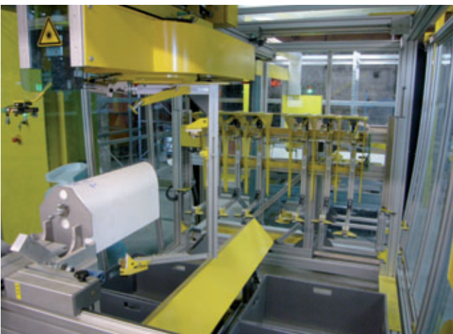
The channel sections are cut with hot wire and the negative channels are put together within a few minutes.

focus for VMC is the quality of the concrete used and also the durability of their final product.. In the past, the company consistently stood out from the competition with solutions that were well thought-out and carefully implemented in production and with the Perfect production system now installed, justice is fully done to this philosophy. All Perfect products are manufactured by VMC with self-compacting concrete of class C60/75. While the quality of the concrete per se already represents a significant difference compared to average components, the mould-cured design of these components, once again clearly sets the VMC range apart from what is on offer from the competition. In close cooperation with the University of Padua (Centre of Comprehensive Research for Studying Cement Materials and Hydraulic Binders Scientific Director: Prof. Gilberto Artioli, Responsible for VMC expertise: Dr. Michele Secco) a formulation for self-compacting concrete with high resistance to sul-