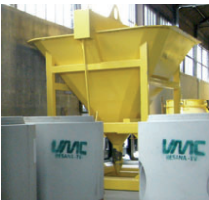
A concrete bucket brings only concrete of the class C60/75 into the casting moulds for the Perfect products.

Schlüsselbauer Technology GmbH & Co KG Hörbach 4 4673 Gaspoltshofen, Austria T +43 7735 71440 · F +43 7735 714456 sbm@sbm.at · www.sbm.at · www.perfectsystem.eu