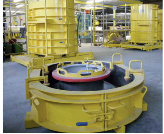
Manhole covers are also produced in the new production process.

regional features. On the one hand, the region is densely populated with town and city boundaries often running into each other across tens of kilometres. This population density increasing over a long time and the typical layout of those old Italian towns with picturesque narrow streets, creates considerable difficulties for drain builders. The lines and manhole structures must be of sufficient size to keep the operation going, but they must at the same time be designed to save as much space as possible to fit alongside other infrastructure lines like drinking water, telecommunications or gas. Against this background, VMC, in close cooperation with some reputable operators of infrastructure networks like ETRA, developed a new component. With an oval manhole cross-section with a width of 800 mm and a length of 1,200 mm, the accessibility of the system is guaranteed and the space required also reduced. Accordingly, the oval manhole base as well as the manhole structure must show the same features.