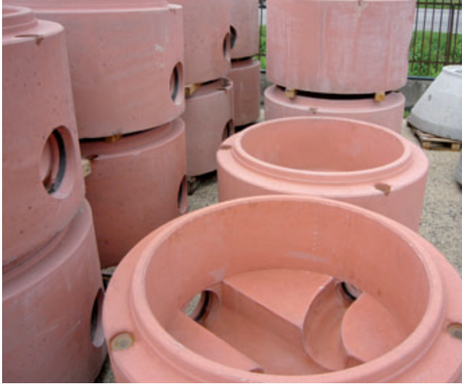
Both circular and oval manholes come with integrated seals.