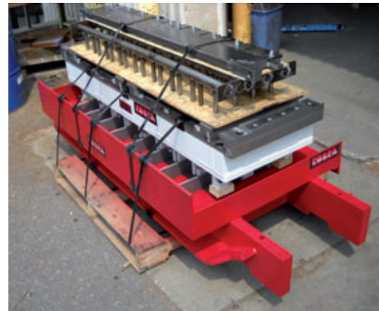
Kobra Mold for Besser SuperPac machine ready for shipment to Ferreteria Ochoa

pany design alternative versions of the current blocks they produce. Further, F.O. enjoys full access to Kobra's design team as well as the manufacturing facilities located in Lengenfeld, Germany and Hudson, Wisconsin.