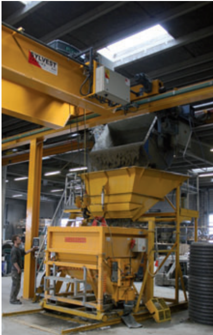
Transfer of SCC from the bucket conveyor to the concrete spreader