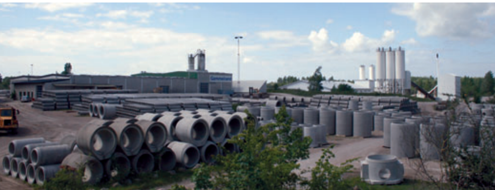
Gammelrand Beton A/S in Svebolle, Denmark

Following on from the commissioning of the first monolithic concrete manhole base production line with the Primuss System from Prinzing in 2009 (see CPI 5/2009), there are now already ten concrete production facilities using this system not even two years later in six European countries. Just recently, the family-run business of Gammelrand Beton A/S in Denmark took the step of investing in the Primuss System. After its run-in period, final testing was carried out by Prinzing technicians at the end of May. In the nine other concrete production facilities with a Primuss production line, manhole channels and connections are milled with a milling robot into partially hardened concrete blanks manufactured only a few hours beforehand from zero slump concrete on a Prinzing Atlas system. Gammelrand, however, decided on a solution with concrete blanks cast from self-compacting concrete. As the company only manufactures concrete manhole bases with a fixed diameter but with variable heights, the need for moulds is rather limited. All moulds in stock can thus be employed for any order.