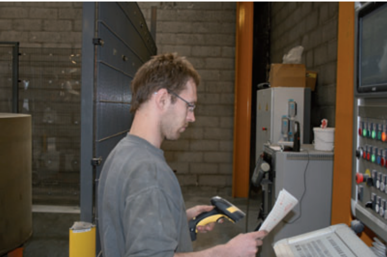
Scanning in the barcode activates the milling process