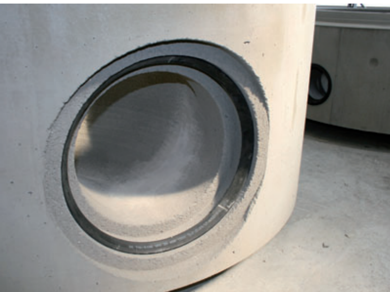
If needed, seals from DS Dichtungstechnik can be inserted later

Prinzing GmbH Anlagentechnik und Formenbau Zum Weißen Jura 3 · 89143 Blaubeuren, Germany T +49 7344 1720 · F +49 7344 17280 info@prinz-ing-gmbh.de · www.prinz-ing-gmbh.de www.top-werk.com · www.PRIMUSS.eu