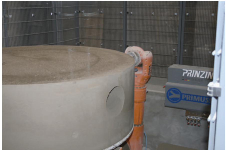
Milling the connections

precise and the finished products are appreciated by their customers.