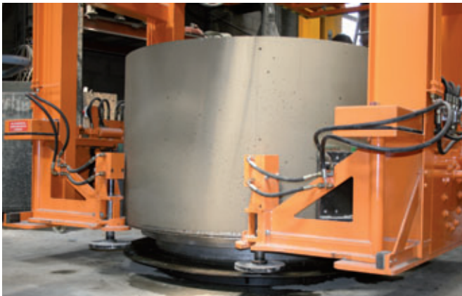
Detaching the support cap

The milling bay at Gammelrand also possesses two milling points. This enables the milling robot to work continuously without any downtimes due to changeovers. Whilst the robot is milling fully automatically at one station, the previously milled manhole base section is removed from the second point by the grab and a fresh concrete blank is placed in readiness. This means that one employee is sufficient to operate the entire milling process. Both the spigot end, which supports the concrete manhole base up to its final hardened state, as well as the processing stations in the milling bay are equipped with fastening points, which guarantee that the blank will be set