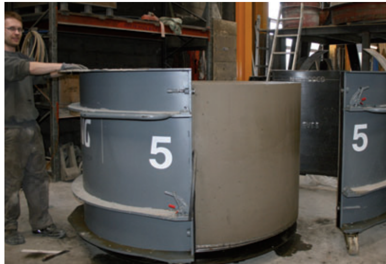
The formwork can already be stripped from the concrete monoliths after a few hours