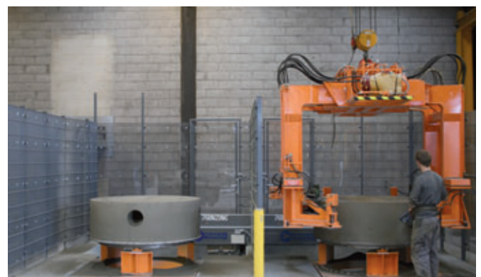
Primuss milling bay with two processing points