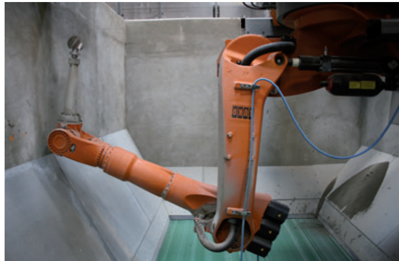
View of the work pit

process with its prior turning of the manhole element is repeated until all connections have been made. The monolithic concrete manhole base section is then finally ready. Whilst the milling robot changes processing point and works on the next monolith, the operator removes the completed component from its former processing point with the grab and sets it down at another. The element is brushed out here (pieces of milled material collect on the connection areas) and checked. The steel pallet is subsequently removed and the manhole base turned. The milled surfaces of both channel and connections correspond to all stated specifications entirely. This means that the monolithic manhole base is finally ready and can be brought immediately into storage, before it is transferred to a construction site in Denmark in order to fulfil its intended purpose.