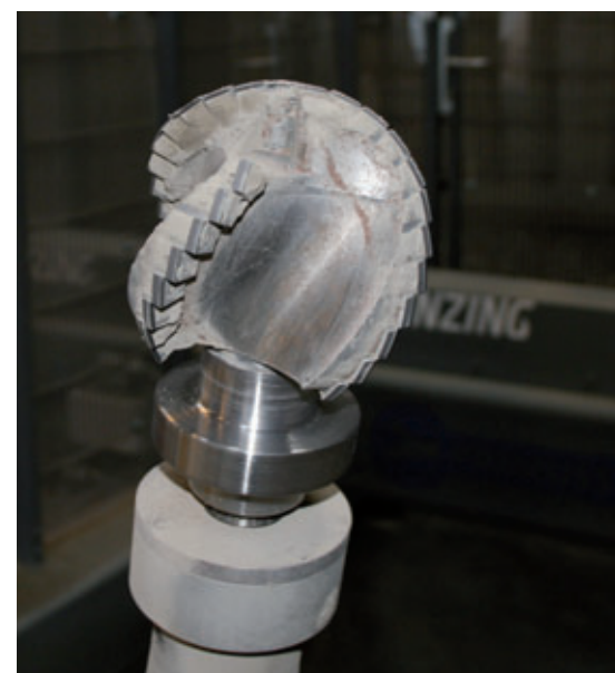
Milling head for cutting the channel