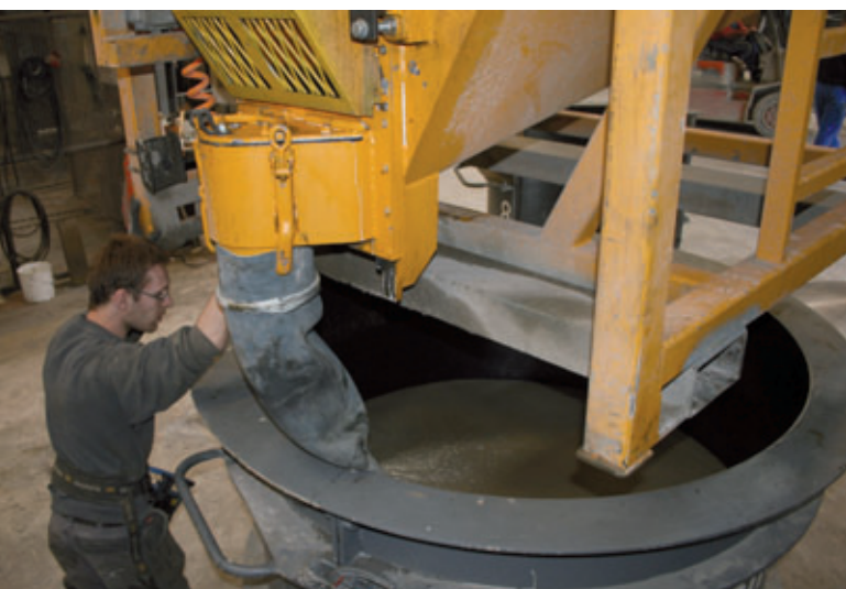
Carefully filling the casting mould with SCC

The grab is attached to the crane rail and can be operated by a remote control unit. The grab first carefully lays hold of the partially hardened concrete blank, then grips it from under the spigot end and lifts it off the support cap. A special release device ensures that stripping the formwork remains a trouble-free operation. The support cap stays on the ground and the concrete blank