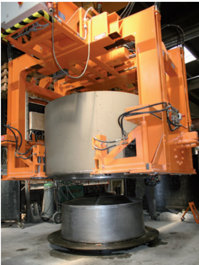
The stripped concrete element is carried on a steel pallet

down in exactly the right position. Each manhole base is planned beforehand on the computer. Once the product parameters for the connections and the channel have been entered, the Prinzing programme creates the entire construction component in the computer and calculates the milling paths for the robot precisely. The data is stored in the system and a corresponding data sheet with all product information accompanies the manhole base sections from the manufacture of the blank right up to the final milling sequence. When a particular manhole element has reached the milling bay, a barcode is read in on the product by means of a hand-held scanner. The system recognises the stored product data and the fully automated milling procedure can begin.