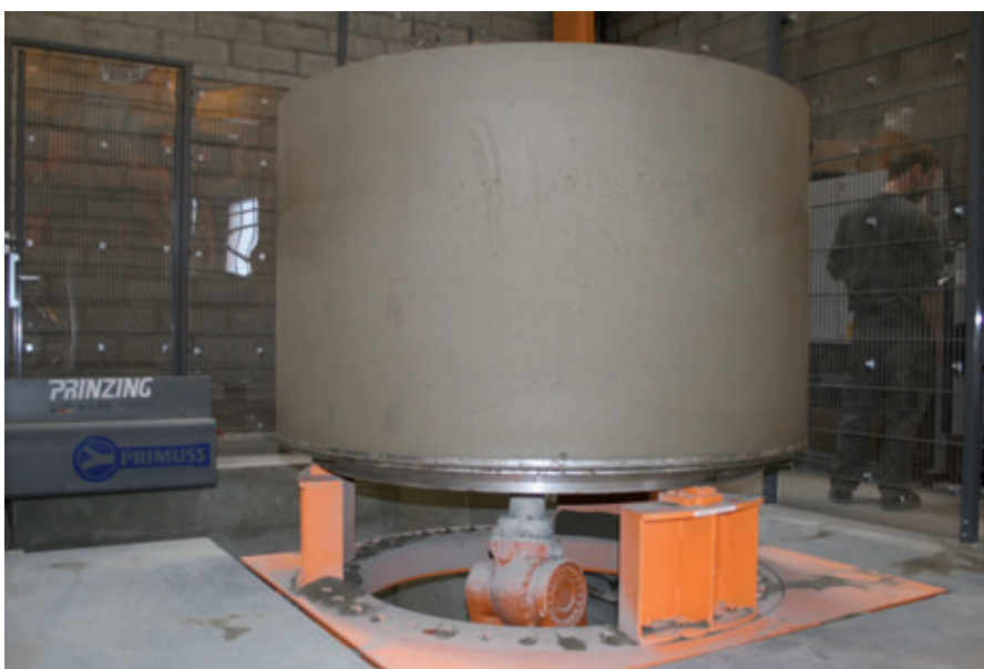
Milling the channel

Ole and Morten Pederson are very pleased with the surface quality attained with the concrete manhole bases, which need no post-processing. The milling work is very