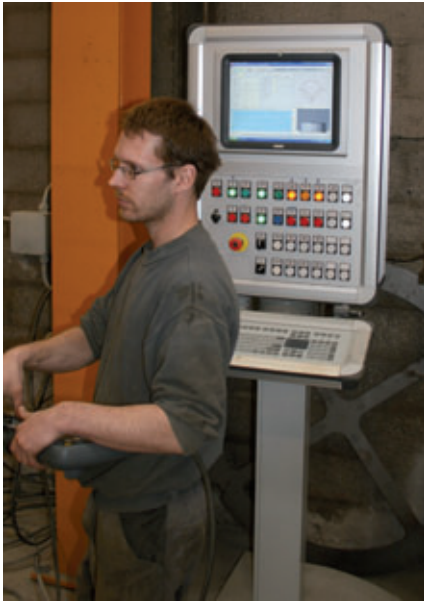
The milling speed can be controlled via remote control