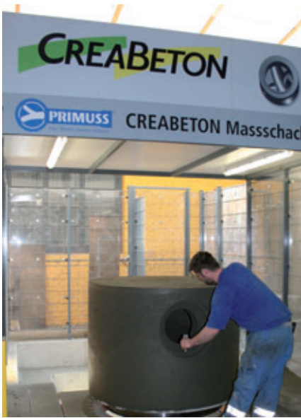
Pipe connections are swept out at the end