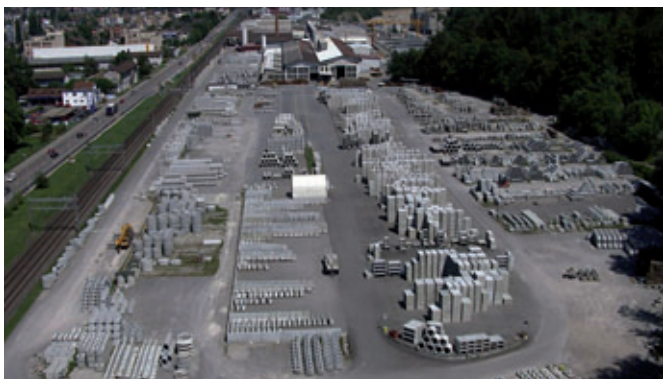
Creabeton Produktions AG company premises in Brugg, Switzerland

The origins of the facility in Brugg date back to the year 1874 and it has borne the name of Creabeton Produktions AG since 2006. Concrete precast components for civil engineering purposes are