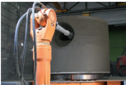
The milling head moves in circular paths. The concrete is cut in layers right up to the total wall thickness.

The Atlas system can produce manhole base sections without a channel in varying heights, differing wall thicknesses and diameters from 800-1,200 mm. First, a steel pallet and a support cap are placed into the unit. Release agent is applied to the support cap.