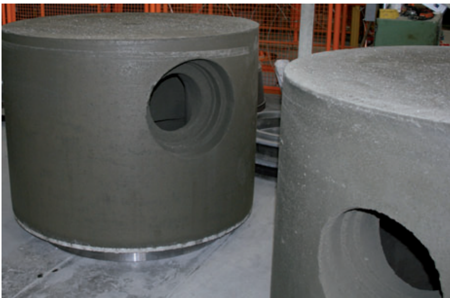
Milled manhole monoliths in the storage area for furthering hardening

Prinzing GmbH Anlagentechnik und Formenbau Zum Weißen Jura 3 89143 Blaubeuren, Germany T +49 7344 1720 F +49 7344 17280 info@prinzing-gmbh.de www.prinzing-gmbh.de www.top-werk.com www.primuss.eu