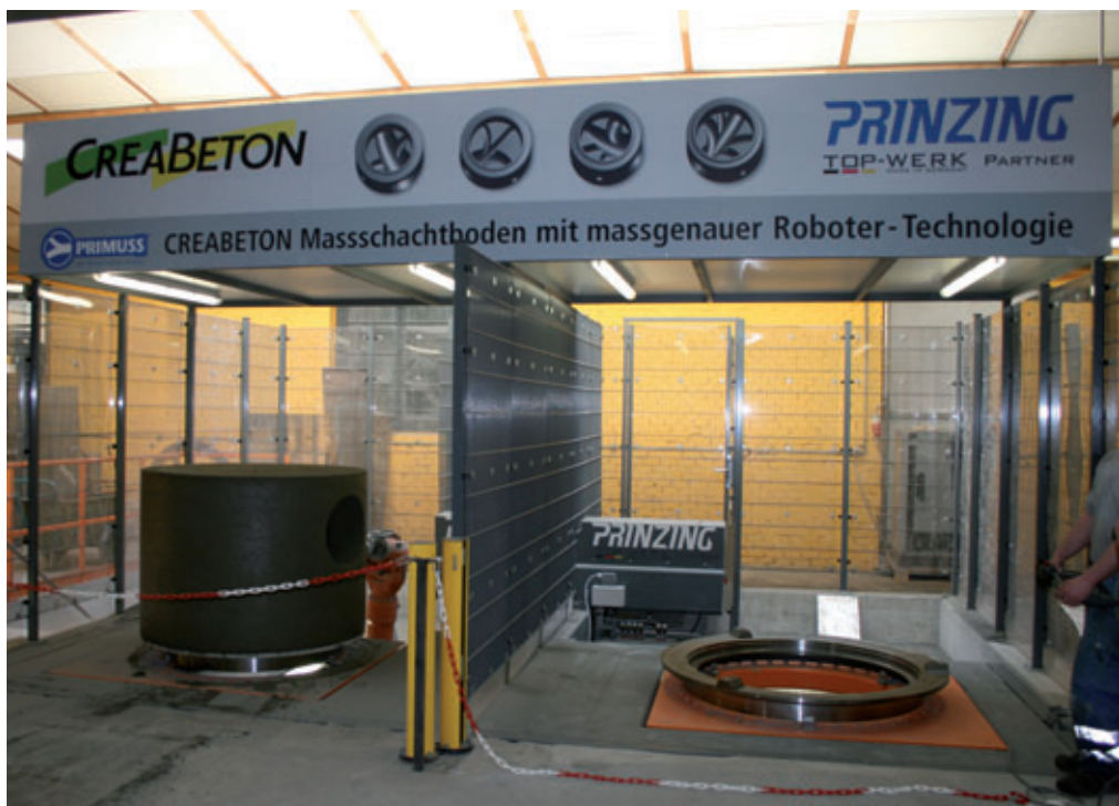
Primuss milling bay with two work places