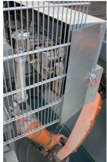
Automatic tool change

a special challenge any more and can be produced and supplied at short notice.