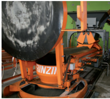
Dosing shutters control the flow of concrete

Creabeton Produktions AG is one of the major producers of precast concrete components for underground civil engineering in Switzerland. In Brugg, almost only great volumes of catalogued products are manufactured with the exception of the new con-