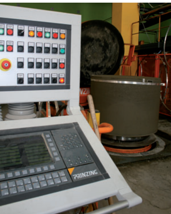
Atlas system control station

the Zurich western ring road, Kloten airport (Zurich) and the Gotthard motorway, are only some that can be named as examples. For all these projects, Creabeton Produktions AG has made its mark as a reliable supplier of high-class concrete products. In the field of waste water technology, Creabeton provides a comprehensive range of pipes and manholes. Demand has continually remained at a high level particularly in the manhole sector. In Switzerland as well, there has been a rapid growth in interest as regards monolithic solutions. Creabeton has introduced its new manhole base section unit at the right time. Individual concrete manhole base sections are now no longer