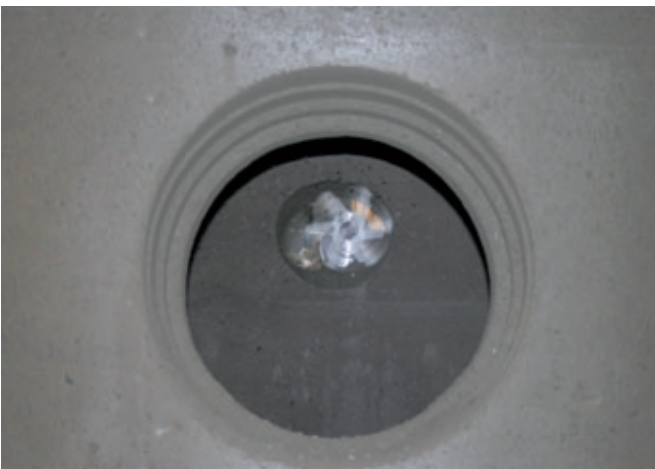
The milling head breaks through

When the channel is milled overhead, the loose concrete falls in small particles perpendicularly onto the above-mentioned downward sloping panels. Material, momentarily deposited on the robot's arm during milling, automatically drops down due to the machine's regular rapid movements. The robot keeps on continually cleaning itself in this way.