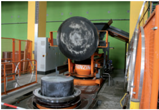
First, the steel pallet and support cap are positioned in the Atlas plant

produced in particular at this site. Its core competencies are the manufacture of light wells, cantilever retaining walls, pipes and manholes. The two first-named products are manufactured with self-compacting concretes whereas pipes and manholes are made with conventional concretes. A total of four concrete mixers from Kniele and Teka supply the entire production process.