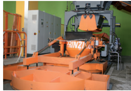
Subsequent compaction with superimposed load

crete manhole base section unit, which manufactures solely to customer specifications. All product groups are immediately available in high numbers for customers thanks to the large outside storage areas. Current high demand has ensured very good production capacity utilisation; the well-filled order books have required repeated extra shifts since the beginning of the year. The approximately 90 employees at the Brugg site have also played their part in the successful development of Creabeton Produktions AG. Numerous reference projects speak for themselves, in which the facility was involved as supplier. Extensive construction works, such as the Isisberg tunnel,