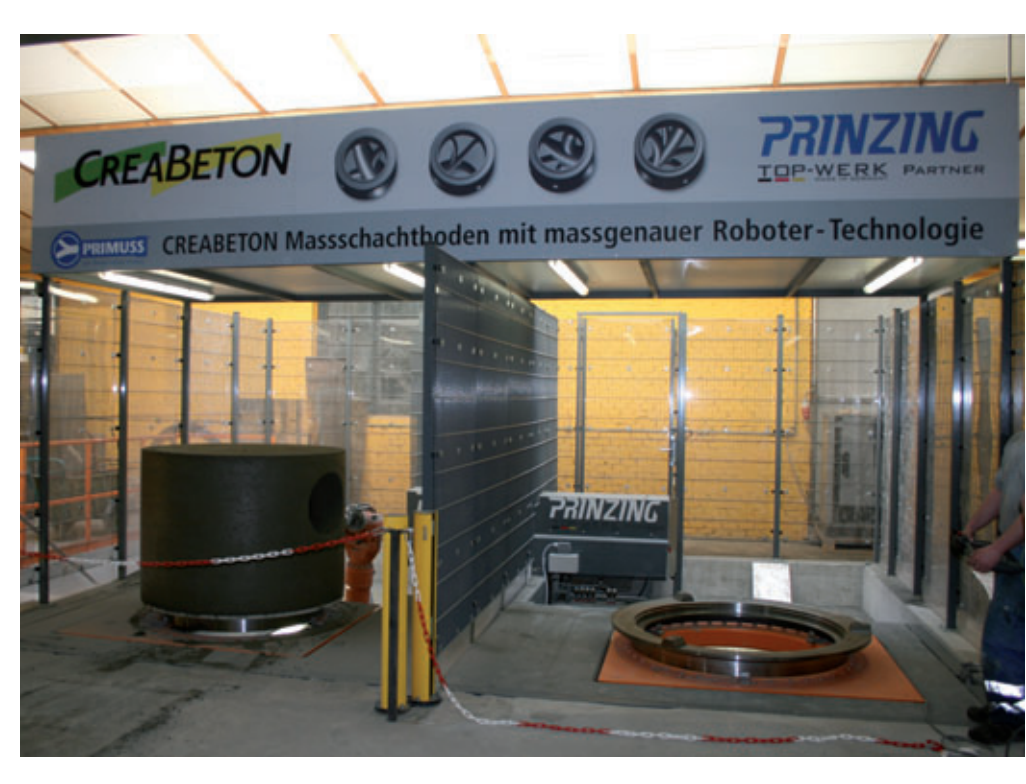
Primuss milling bay with two work places