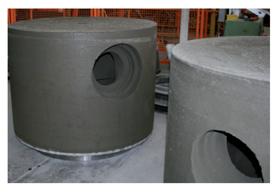
Milled manhole monoliths in the storage area for furthering hardening

Prinzing GmbH Anlagentechnik und Formenbau Zum Weißen Jura 3 89143 Blaubeuren, Germany T +49 7344 1720 F +49 7344 17280 info@prinzing-gmbh.de www.prinzing-gmbh.de www.top-werk.com www.primuss.eu