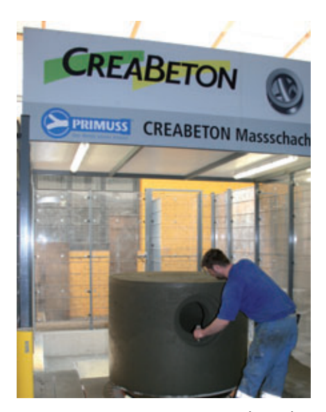
Pipe connections are swept out at the end

ed from the arm and a new tool attached in an analogous fashion. A side milling cutter is normally employed in milling the pipe connections.