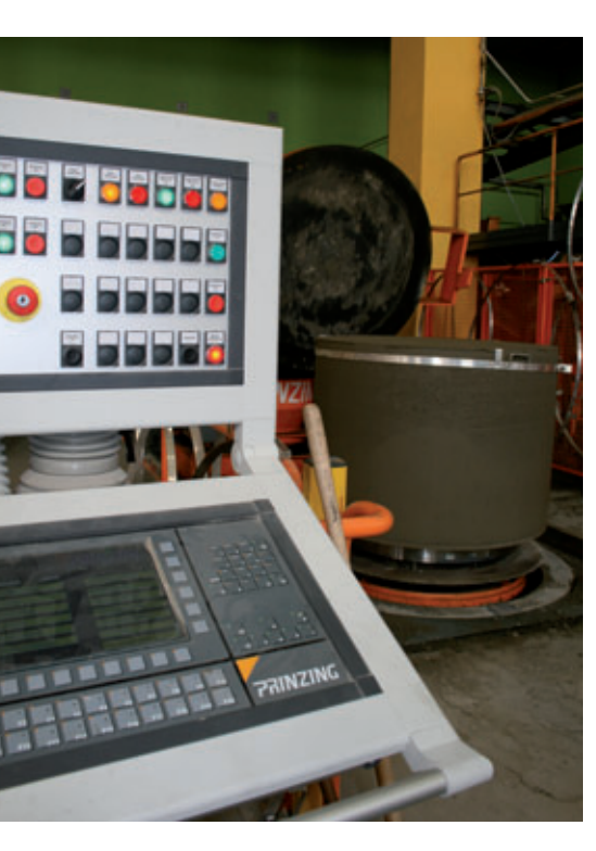
Atlas system control station

Concrete milling technology, as regards the manufacture of monolithic concrete manhole base sections, has also made its debut in