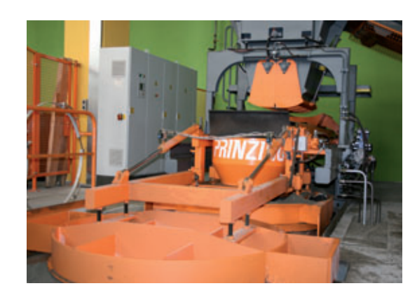
Subsequent compaction with superimposed load

available in high numbers for customers thanks to the large outside storage areas. Current high demand has ensured very good production capacity utilisation; the well-filled order books have required repeated extra shifts since the beginning of the year. The approximately 90 employees at the Brugg site have also played their part in the successful development of Creabeton Produktions AG. Numerous reference projects speak for themselves, in which the facility was involved as supplier. Extensive construction works, such as the Islisberg tunnel, the Zurich western ring road, Kloten airport (Zurich) and the Gotthard motorway, are only some that can be named as examples. For all these projects, Creabeton Produktions AG has made its mark as a reliable supplier of high-class concrete products. In