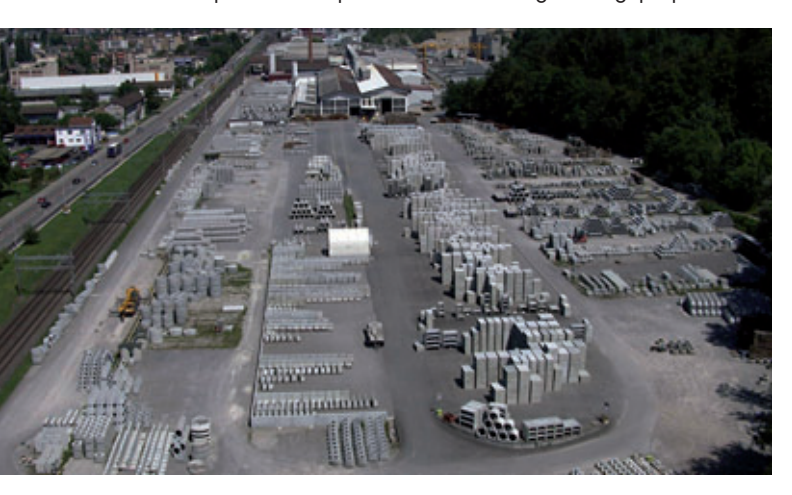
Creabeton Produktions AG company premises in Brugg, Switzerland

The origins of the facility in Brugg date back to the year 1874 and it has borne the name of Creabeton Produktions AG since 2006. Concrete precast components for civil engineering purposes are