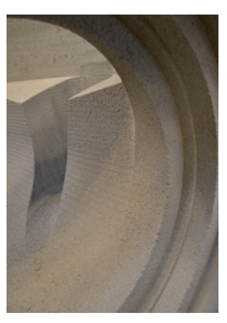
View of a milled manhole base section