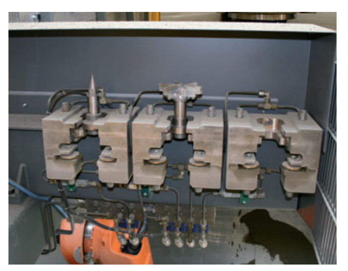
The two-part tool storage unit offers mountings for a total of six milling heads