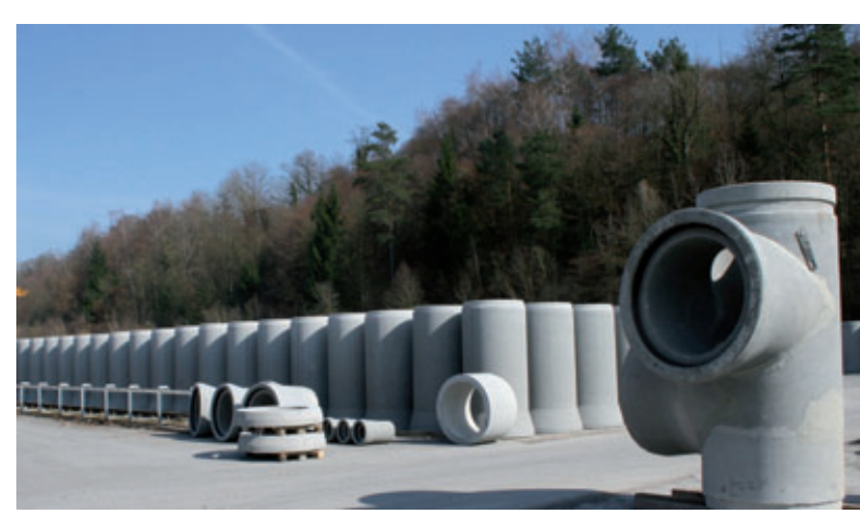
In the Brugg production facilities, Creabeton Produktions AG manufactures catalogued products in high quality and great numbers; special construction components are also a feature of daily business