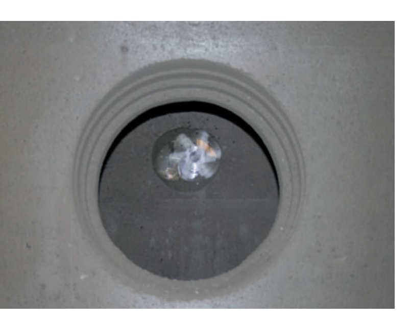
The milling head breaks through

The next stage involves milling the pipe connections. For this purpose, the robot first automatically changes the milling tool. The robot arm travels to the tool storage unit and places the milling head in prior use into the mounting provided. The tool is detach-