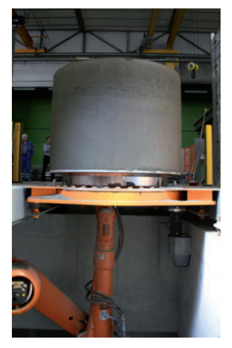
Milling a drainage channel