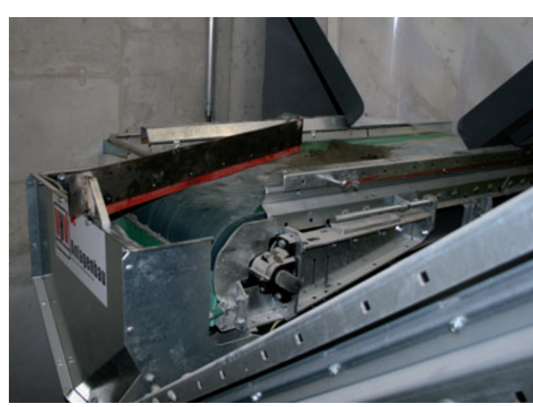
A well-designed conveyor belt system carries the milled material away from the working area