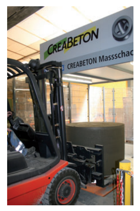
Setting down a concrete manhole blank on the clamping ring in the work bay