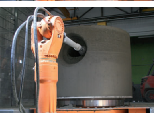
The milling head moves in circular paths. The concrete is cut in layers right up to the total wall thickness.

Concrete is fed into the Atlas unit's storage hopper by means of a Rekers bucket conveyor. The concrete is transferred via dosing shutters to a conveyor belt, which then brings the concrete to the mould. The zero-slump concrete is compacted with vibration of controlled amplitude and frequency. The flow of concrete can be controlled very precisely via these dosing shutters so that no more concrete is given into the mould than absolutely necessary.