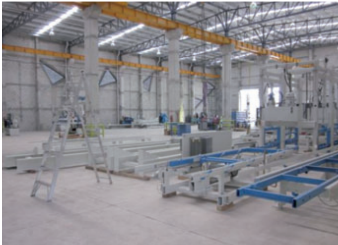
The factory has over 2,500 square meters construction facilities and 700 square meters for offices

Chavez, who was also trained in Germany, as head of the service department at Hess Mexico. Hess' biggest challenge is to offer a combination of high technology, high efficiency and low maintenance Hess quality machine along with simple handling systems that could be of easy use for the Latin American labour intensive average customer.