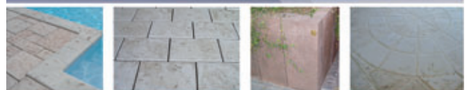
Wet cast production

Contact our sales / distribution service at +33 (0)4 50 03 92 21 www.quadra-concrete.com