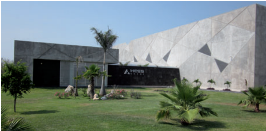
The new Hess factory was designed in a modern style concrete shape in a modular form to point out the Hess slogan "We put Concrete into Shape".

With over a dozen manufacturing units worldwide, the German Hess Group based in Burbach-Wahlbach is one of the global leaders in the concrete machinery business. Recently, they opened their new production facility in the Yucatan, only 15 km from the International Port of Progreso. Hess Mexico will serve the Latin American countries with technical service in Spanish and a spare part centre that understand the needs of the Latin American customer. This new factory with over 15 employees (planning to reach 60), all of them experienced German and Latin American Engineers working under Hess head quarters technical supervision, is expected to manufacture between 12-15 plants per year.