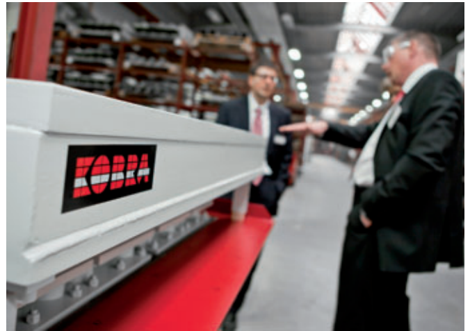
Kobra presented various mould technologies in the workshops.