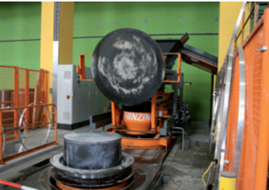
First, the steel pallet and support cap are positioned in the Atlas plant