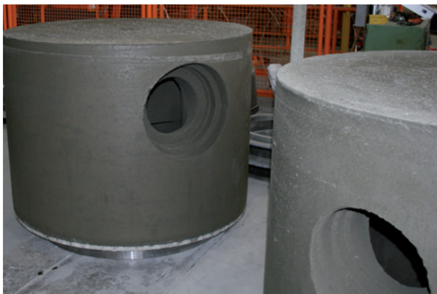
Milled manhole monoliths in the storage area for furthering hardening