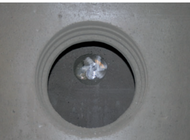
The milling head breaks through

The next stage involves milling the pipe connections. For this purpose, the robot first automatically changes the milling tool. The robot arm travels to the tool storage unit and places the milling head in prior use into the mounting provided. The tool is detach-