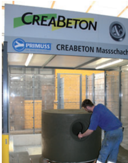
Pipe connections are swept out at the end

ed from the arm and a new tool attached in an analogous fashion. A side milling cutter is normally employed in milling the pipe connections.