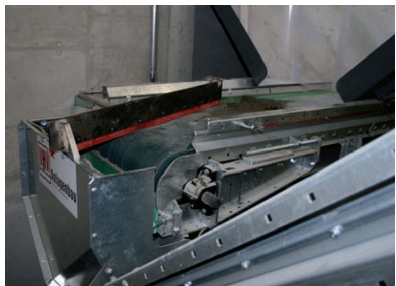
A well-designed conveyor belt system carries the milled material away from the working area