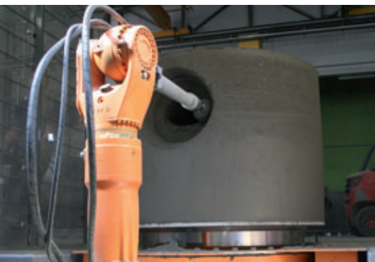
The milling head moves in circular paths. The concrete is cut in layers right up to the total wall thickness.

Concrete is fed into the Atlas unit's storage hopper by means of a Rekers bucket conveyor. The concrete is transferred via dosing shutters to a conveyor belt, which then brings the concrete to the mould. The zero-slump concrete is compacted with vibration of controlled amplitude and frequency. The flow of concrete can be controlled very precisely via these dosing shutters so that no more concrete is given into the mould than absolutely necessary.