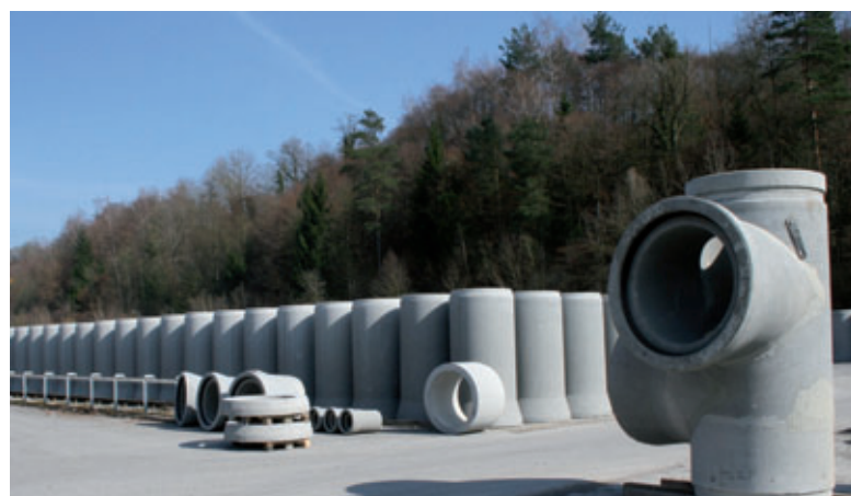
In the Brugg production facilities, Creabeton Produktions AG manufactures catalogued products in high quality and great numbers; special construction components are also a feature of daily business