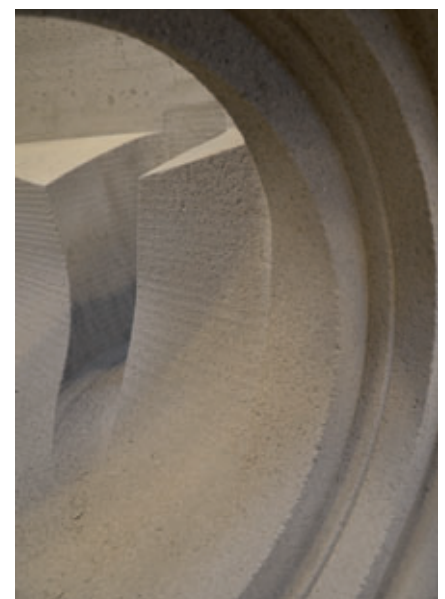
View of a milled manhole base section