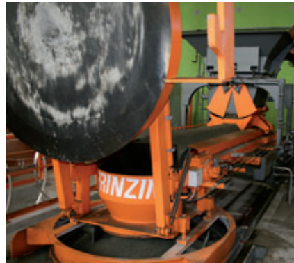
Dosing shutters control the flow of concrete