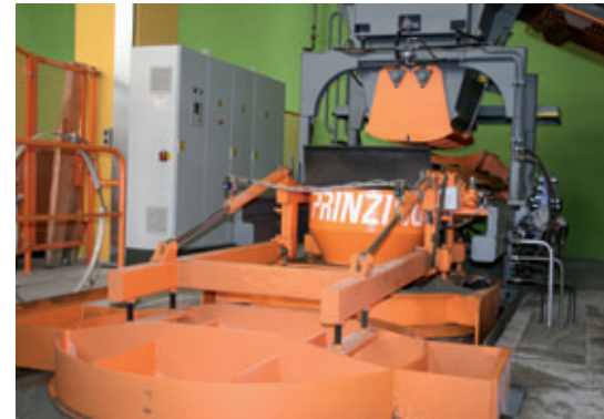
Subsequent compaction with superimposed load

produced in particular at this site. Its core competencies are the manufacture of light wells, cantilever retaining walls, pipes and manholes. The two first-named products are manufactured with self-compacting concretes whereas pipes and manholes are made with conventional concretes. A total of four concrete mixers from Kniele and Teka supply the entire production process.