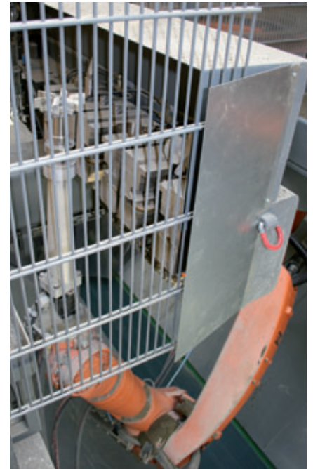
Automatic tool change

Switzerland with the commissioning of the new Primuss plant. The Primuss features a high degree of automation. The programme-controlled production of any type of drain channel and corresponding pipe connections can be carried out with great precision. Great numbers of concrete manhole base sections can be manufactured automatically in a short time with minor manpower resources using just a handful of moulds.