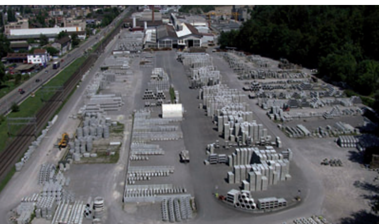
Creabeton Produktions AG company premises in Brugg, Switzerland