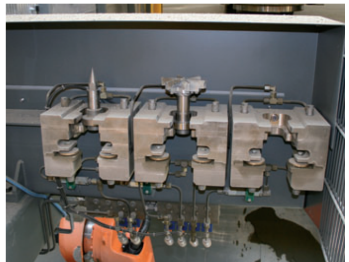
The two-part tool storage unit offers mountings for a total of six milling heads