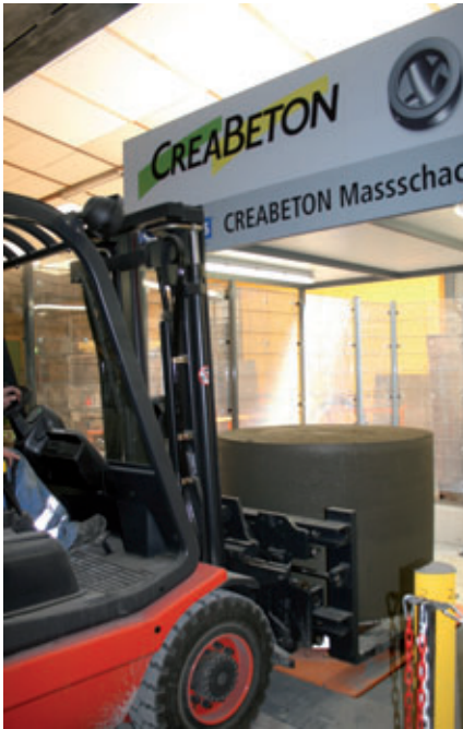
Setting down a concrete manhole blank on the clamping ring in the work bay