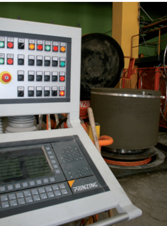
Atlas system control station

Concrete milling technology, as regards the manufacture of monolithic concrete manhole base sections, has also made its debut in