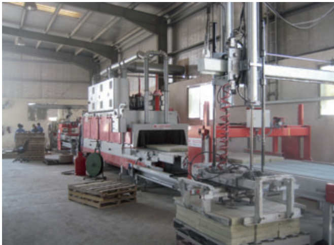
The new curling line at Transgulf

In Nov. 2009 company Transgulf ordered a curling line with SR-Schindler Maschinen – Anlagentechnik GmbH. The line was shipped in June 2010 and commissioned in August. Meanwhile Transgulf delivers value added products to several customers in the Middle East region.