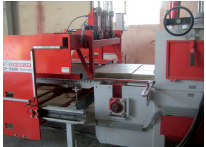
Slabs after the treatment

The line has a working width of 1200 mm, products 50-300 mm thick can be processed. The max. passage height is 350 mm. The line is currently working in semiautomatic mode. I.e. loading and unloading of product layers get done by means of cranes and clamps provided by customer.