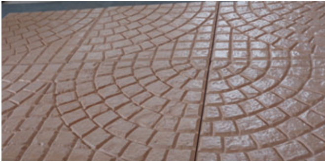
Products after treatment

automatically. The occurring dust gets removed by means of dust suction.