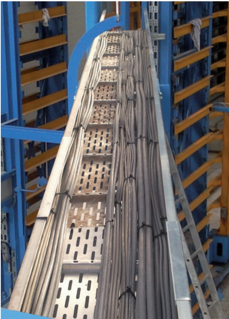
Cable routing via cable trays

The basic structure of the packaging device consists of a portal frame of robust profile steel. The warp-resistant chassis as well as the lifting and lowering movement are each driven by toothed belts and geared servo-