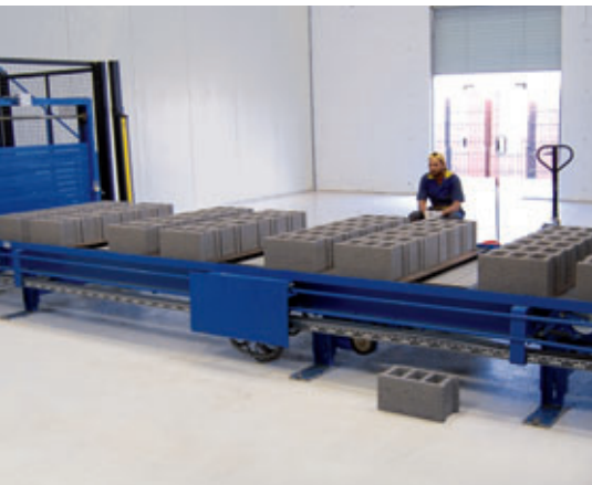
Quality control at Masa: boring with certainty.

An important component in the creation of the Masa safety concept, apart from the internal risk evaluation and minimisation, is also the transfer of these findings to understandable and comprehensive safety documents. Masa supplies explanatory technical operating instructions for each plant component that also provide important plant safety instructions. Beyond that, Masa has prepared comprehensive safety materials.