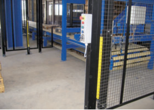
Light curtain/light barrier